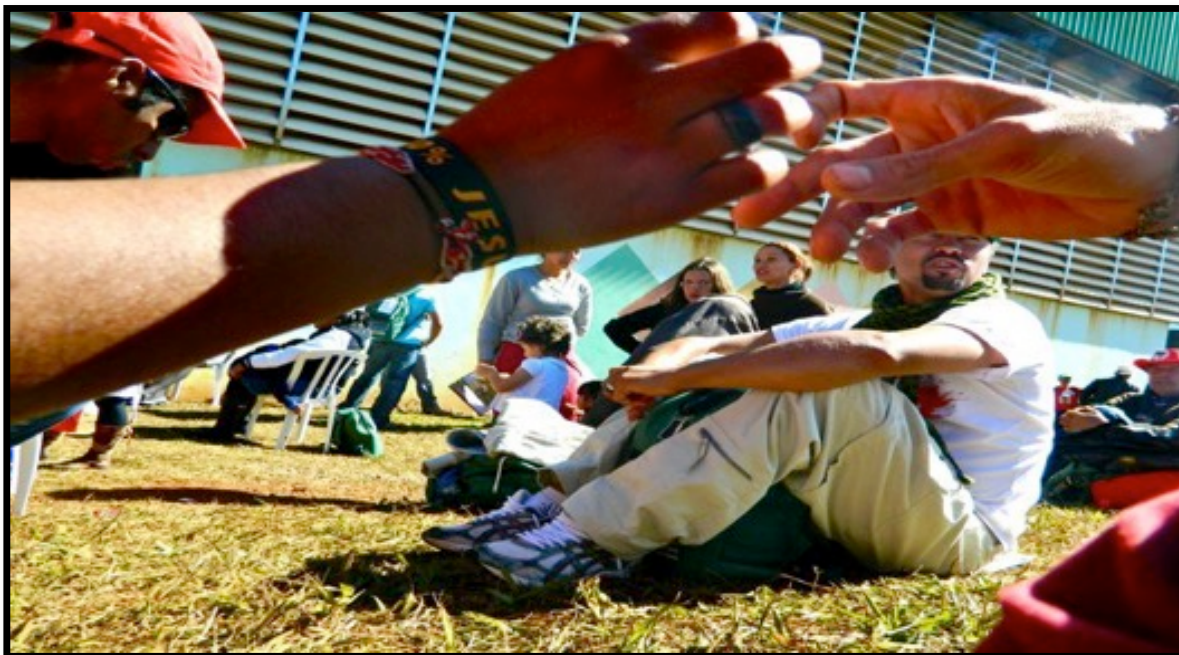
7/2012. Sharing cigarros de palha at the Jornada de Agroecologia. This was my first substance-sharing circle with the young paulistas. Londrina, Paraná.