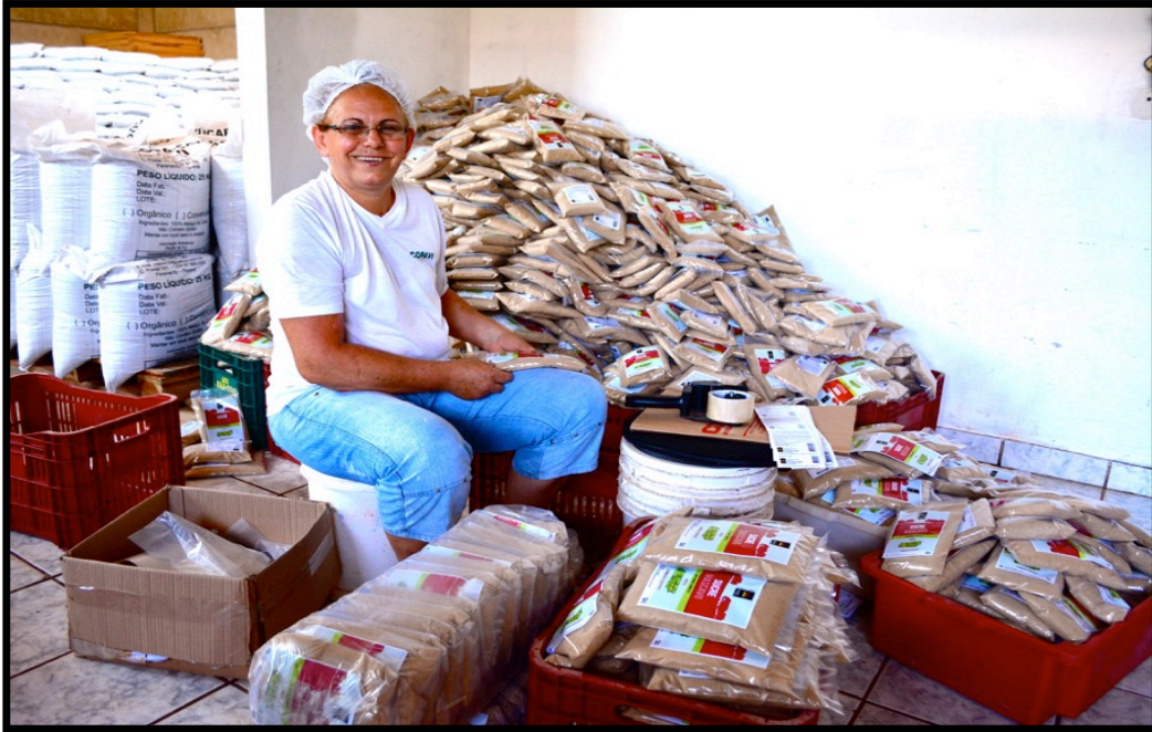
10/2013. Solange packages organic brown sugar in agroindustry to be shipped to France.