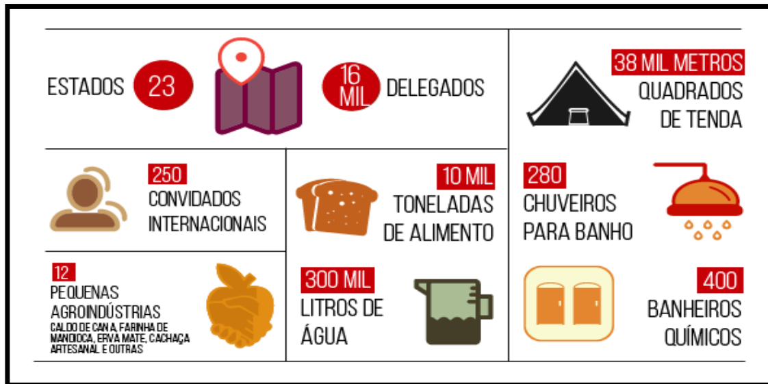
Figure from Mídia Ninja's Coverage of the Event : 23 states, 16,000 delegates, 38,000 meters of canopies, 250 international guests, 10,000 tons of food, 300,000 liters of water, 280 showers, 400 chemical outhouses, and 12 small food processors.

ability to colonize a given setting with rapidity. This was accomplished through the delegation of tasks to individuals within organized work groups: for security, childcare, cleaning, and cooking. In the space of a few hours, an impromptu city had been erected, which would be populated by the 16,000 delegates for the next four days. According to Mídia Ninja's report on the event, 280 showers and 400 chemical toilets were installed; 10,000 tons of food and 300,000 liters of water were ready to be consumed. 6