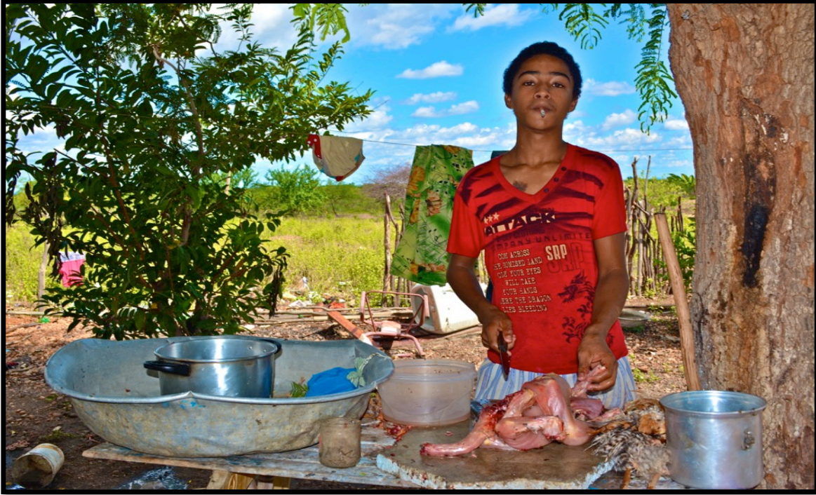
3/2014. Rural youth runaway lived at a house in land reform settlement in Pernambuco. In exchange for housing, he cleaned the home and cooked. Here he is butchering a chicken for use in a love magic ceremony.

This dissertation examines the forces that sustain and weaken young adult participation in Brazil's Movimento dos Trabalhadores Rurais Sem Terra (Landless Rural Workers' Movement, MST). In contrast to the poverty, crime, homicide, insecurity, and state-sponsored violence for which Brazil's urban areas are notorious (Goldstein 2003; Holston 2008; Perlman 2010), the MST seeks to create a rural-based alternative that promises full employment, dignity, and social security for farming families (Welch 2004: 108). Present in twenty-four of twenty-six Brazilian states, the MST organizes long-term occupations of land to pressure the state to comply with the provisions of the 1988 Federal Constitution which state that land must