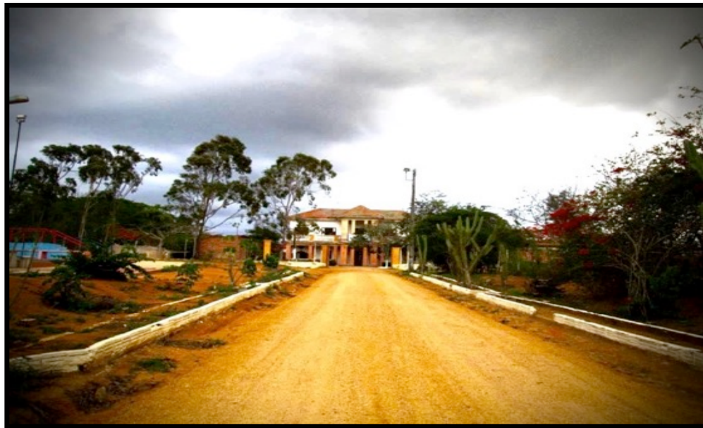
6/2014. Caruaru. The old plantation house at a land reform settlement. The space was converted into MST-PE's Centro de Formação in 2010.

POL ITIC AL TRA ININ G IN PER NA MB UC O MS