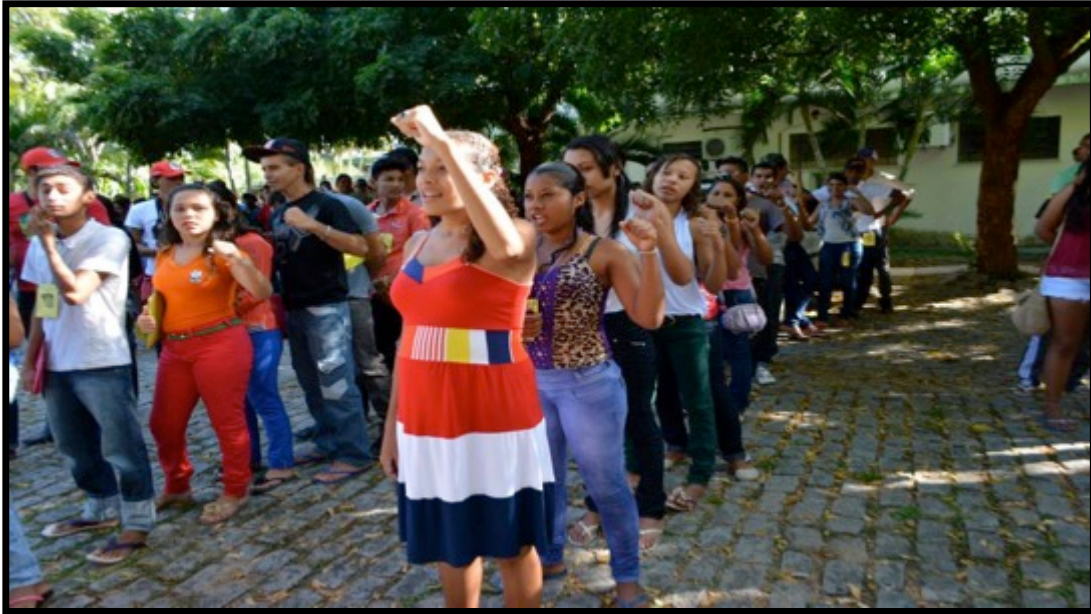
8/2014. Fortaleza. MST youth group stands in single file lines to chant slogans.