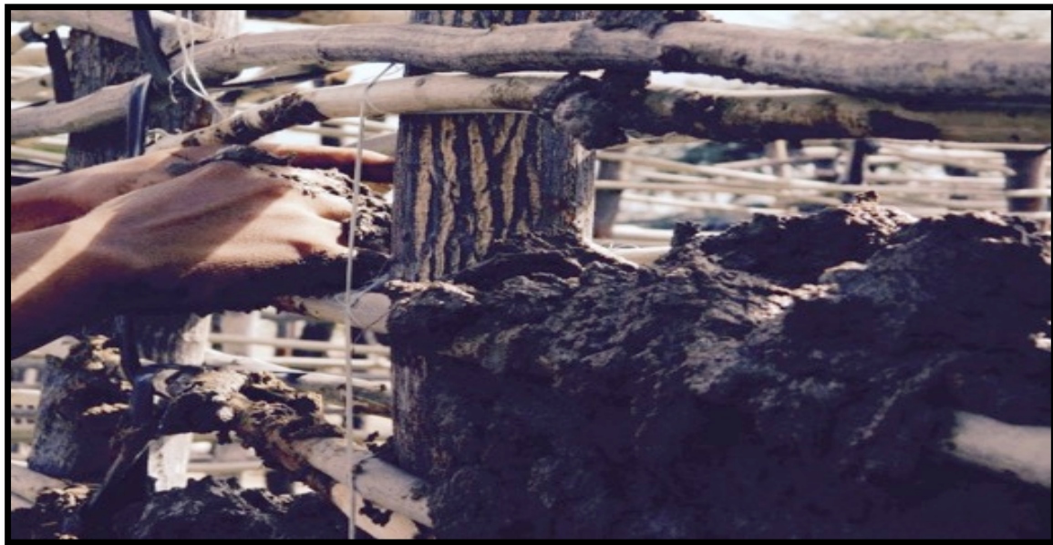
5/2014. Cleia (18/f) builds her first shack in an MST occupation camp, Pernambuco.