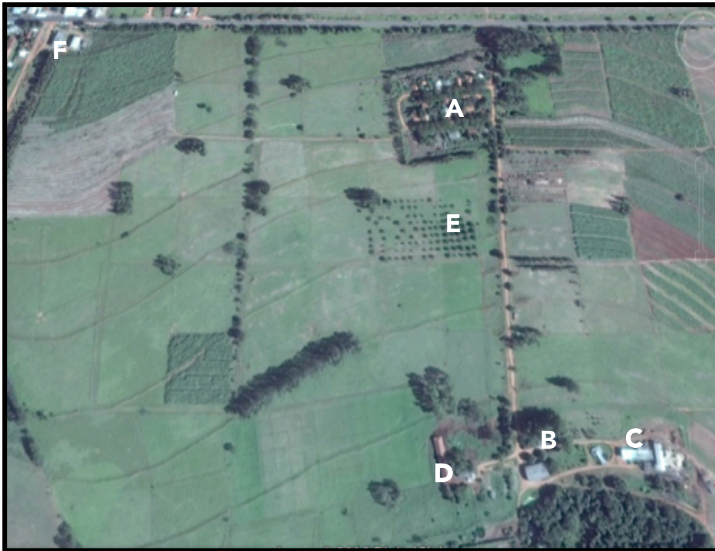
Satellite image of Copavi, Google Earth, 2016. One can see that the community is relatively small. 23 families live together in one neighborhood (A) and work in collectively in the office/cafeteria (B), agroindustry (C), dairy farm (D), agroforestry system (E). Copavi is located just 500 meters beyond the urban perimeter of Paranacity (F).