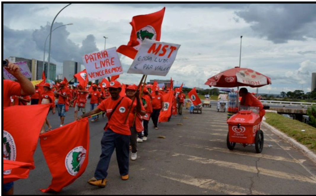
2/2014. The marchers remained joyful and enthused, while street vendors followed the procession. Brasília.

As we walked, we were urged to maintain the formation by MST-security guards. “ Fica na fila! Fecha burraco! Keep to the line! Close the hole!” They implored us not to break ranks for any reason. Beyond the aesthetic importance of disciplined marching, at the most practical level our corporeal formation prevented breaches by angry drivers. This was difficult to achieve in a way, “like herding cats,” as one North American solidarity activist put it. Failure to comply sometimes engendered harsh words by leaders and exhortations to get back in line. Meanwhile, the loudspeakers reminded us that we were “not there for tourism, but to work.”