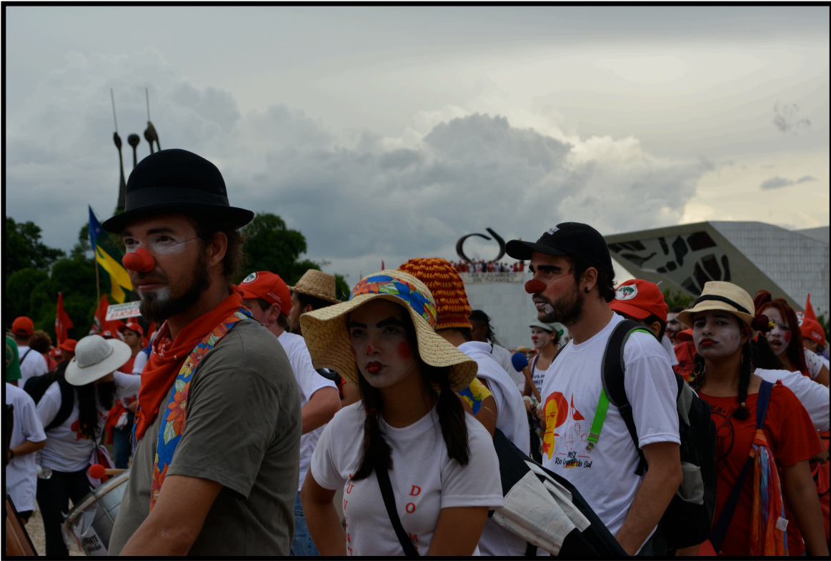
Contingent of Sem Terra Youth at Palacio Planalto, Brasília. 2/2014.