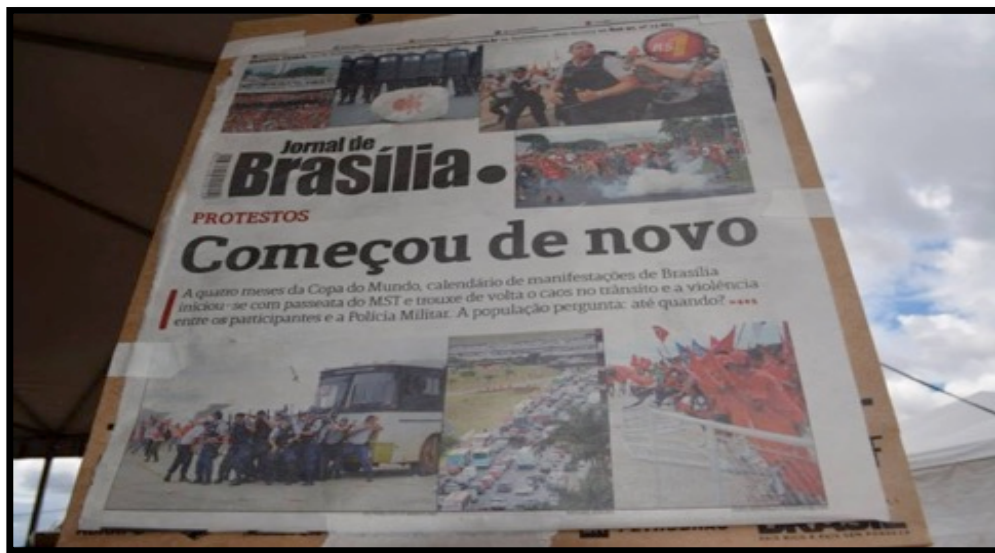
Newspaper from Jornal de Brasília, hung from booth at Agrarian Reform Fair the morning after the march. Headline reads: "Protests Began Again: Four months until the World Cup, the calendar of demonstrations in Brasília began with the march of the MST and again caused traffic problems and violence between the participants and the Military Police. The population asks: until when?"

Such informal conversations indicated the stakes involved in protest. While repression might foment collective identification in the moment, it may also promote disaffection, shame, and embarrassment among the rank-and-file (Mansbridge 2001). Even though Elena was ready for a standoff with the police, Vanessa and Isabel were terrified and only wished to escape the confusion.