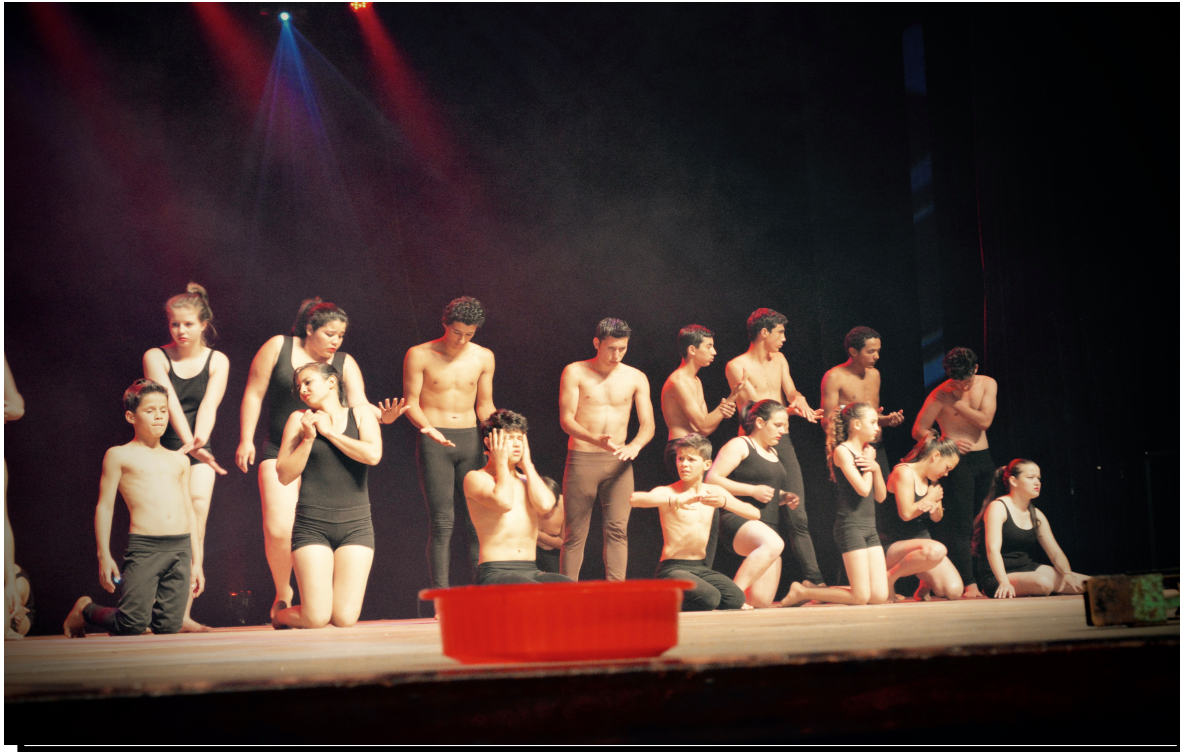
Theatre troupe, Saci Arte, comprised of young people from land reform settlements, perform at MST-PR's II Festival of Arts in Curitiba. 10/2013.

remaining rural? Who are these “landless” youth?