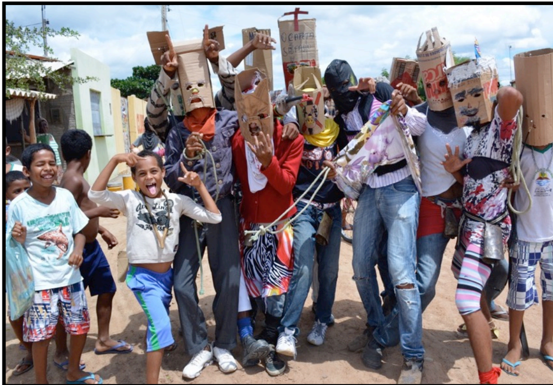
4/2014. Boys cross-dress and ask for offerings, house to house, for a communal ritual during Easter.