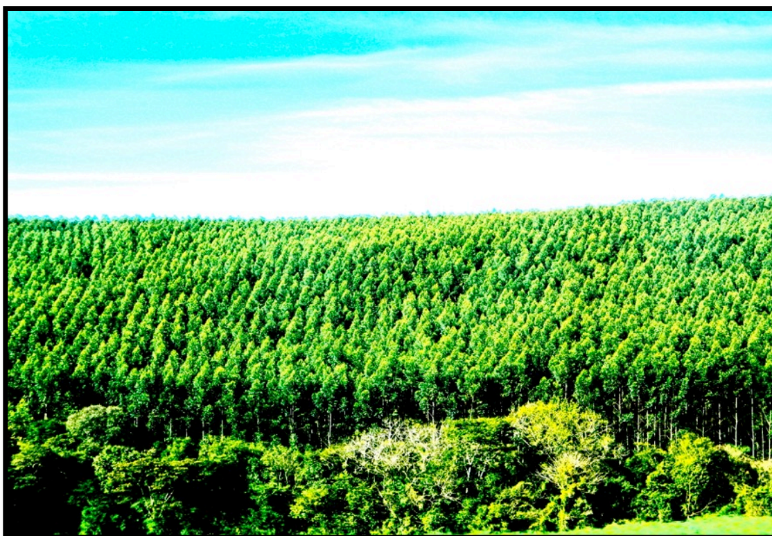
2/2014. Que monótono! Endless views of eucalyptus plantations in Minas Gerais. View from the MST-PR bus.