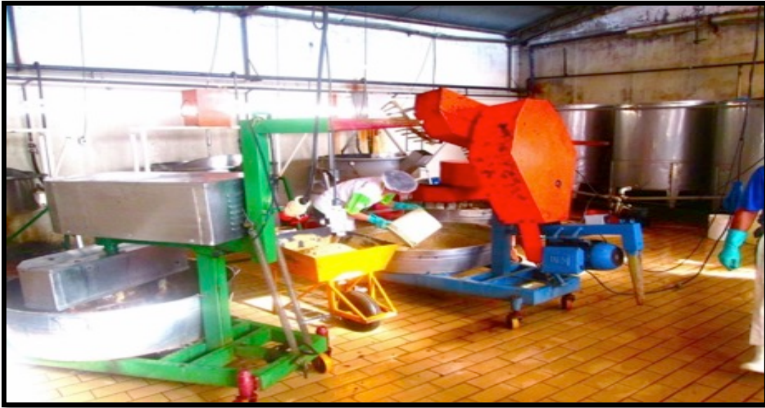
12/2013. Denise processes brown sugar.

settlement in Southern Paraná]—completely disorganized, cada um pra cada um [everyone for himself], poor and ashamed.