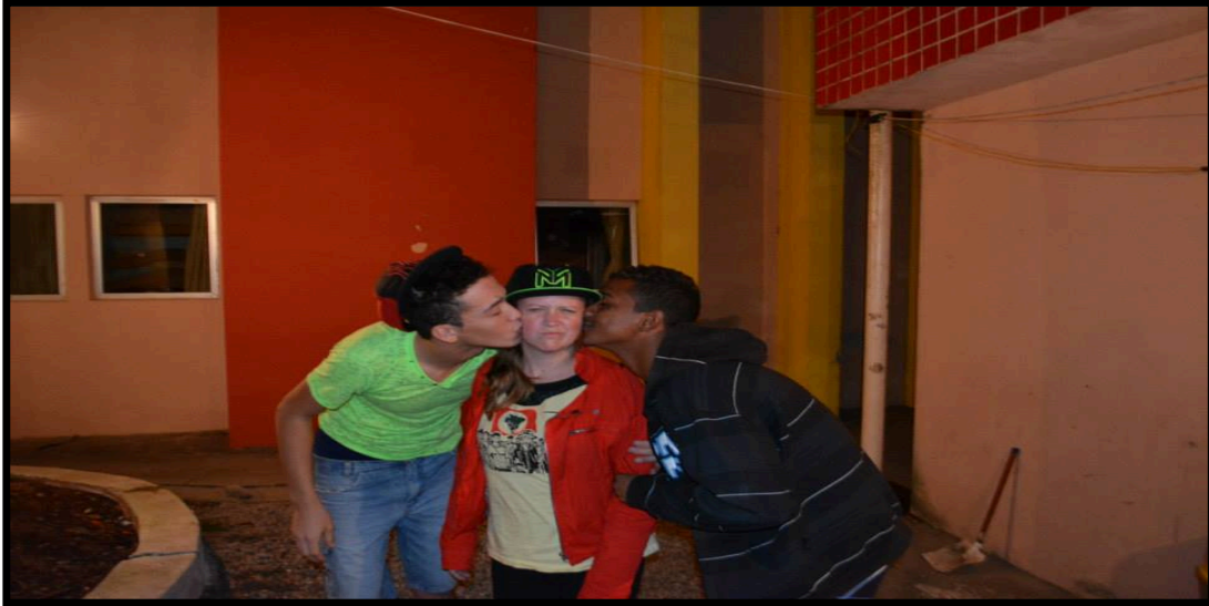
After a day of collective farming, the researcher poses for photograph, and is unexpectedly kissed by research participants. 4/2014.

gender, sexuality, and belonging. These conflicts and my own inability to inhabit a socially recognizable role worked at cross-purposes with my own expectations as an activist scholar or scholar of activism.