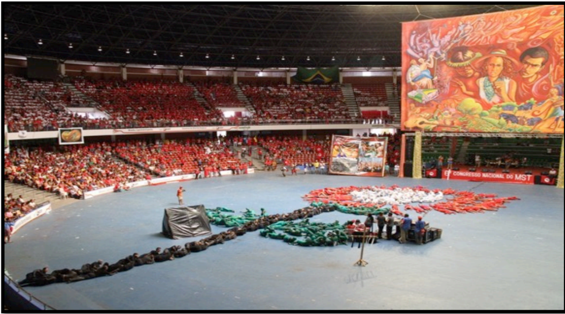
2/2014. MST-PR's opening mística .

particular section, which made it easy for MST regional leaders to track attendance. All state chapters designed a unique t-shirt for the event (white, red, and black), and when uniformly dressed the bodies sent a message of unity and discipline.