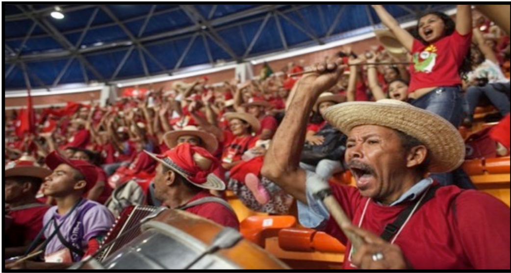
2/2014. Chanting slogans.

After the completion of the mística , a male MST leader led the seated spectators in rounds of gritos de ordem (chanting of slogans). Delegates were called to their feet on a state-by-state basis, and each state chapter attempted to out-shout the rest. Upon hearing their chapter called, all jumped to their feet (or were jostled awake by their neighbors), pumped their left fists upwards, and shouted the appropriate response.