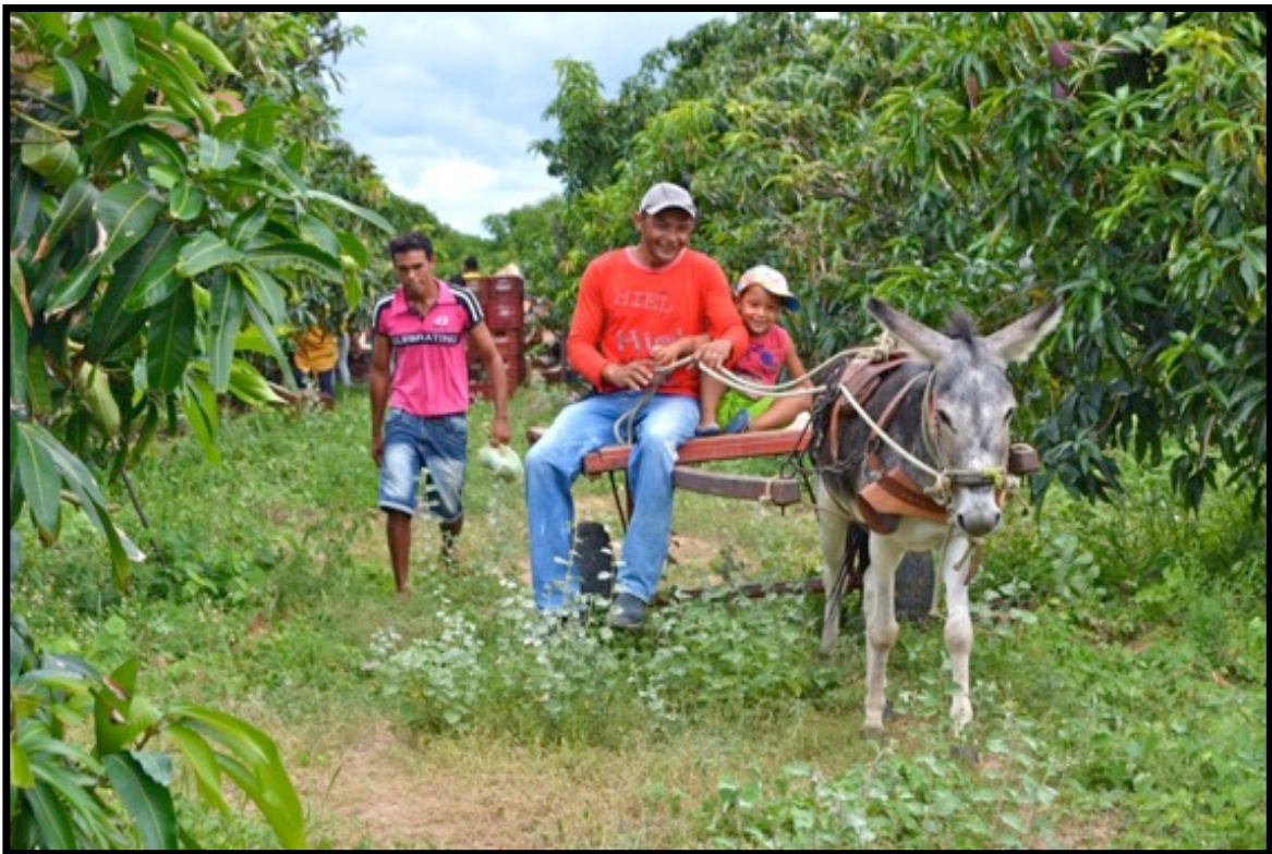
2/2014. Three generations of men harvest mangos, Semente's top-selling crop.

of their own, which in this context should be understood as a means of production. I was often told that temporary migration was the preferred strategy to actualize these desires for mobility. Males married and moved out later than their sisters and often migrated elsewhere on a temporary or more permanent basis. If interested in working the roça , they might expect to inherit their father's plot in the settlement; otherwise they would have to save money to purchase or rent space elsewhere. Most circulated in and out of the settlement, returning to help on a seasonal basis.