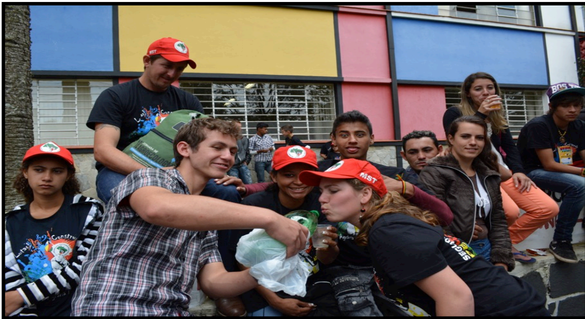
10/2013. Youth from MST-PR drink disguised liquor at occupation of the Ministry of Education, Curitiba, Paraná.