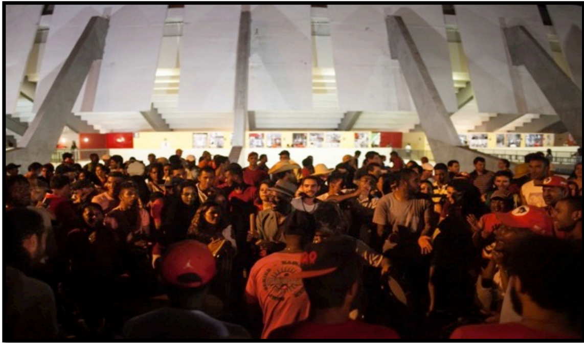
2/2014. Secular Nights . Parading around the stadium at the dance parties.