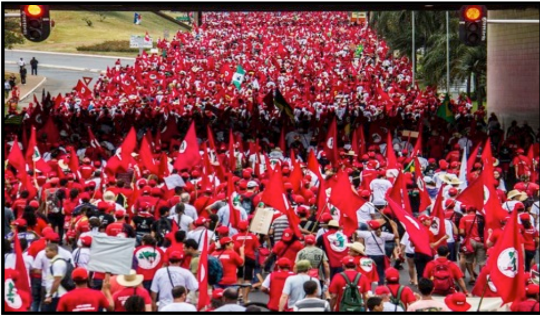
2/2014. The multitude, post-conflict.

After the bombs were dropped and the police backed off, the multitude waited for instructions. After a few moments, a voice over the MST’s loudspeakers announced that we were dismissed from the procession and instructed to return as quickly as possible to the