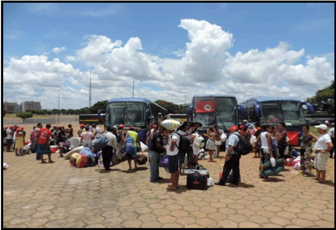
2/2014. MST delegations getting ready to depart.