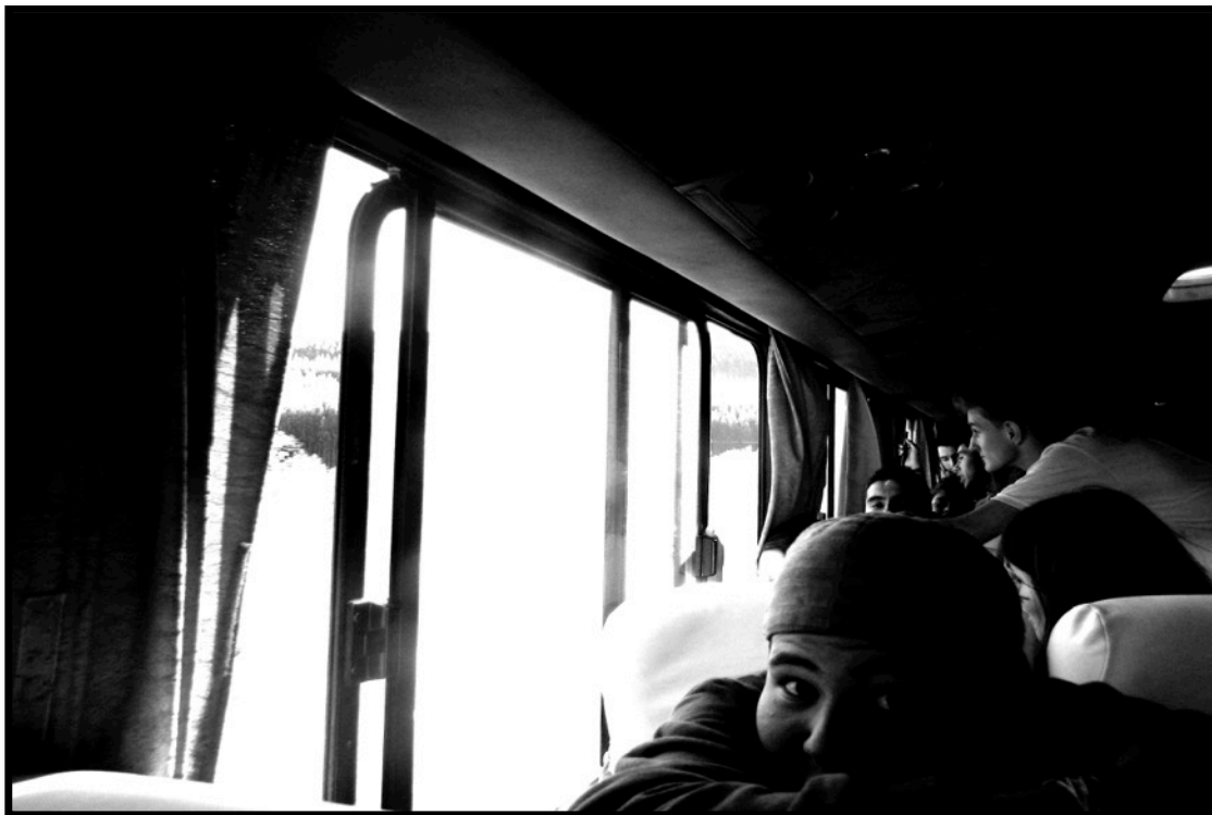
12/2012. Mass action through seeing. MST youth on a 16-hour bus ride, traveling to MST protest camp.