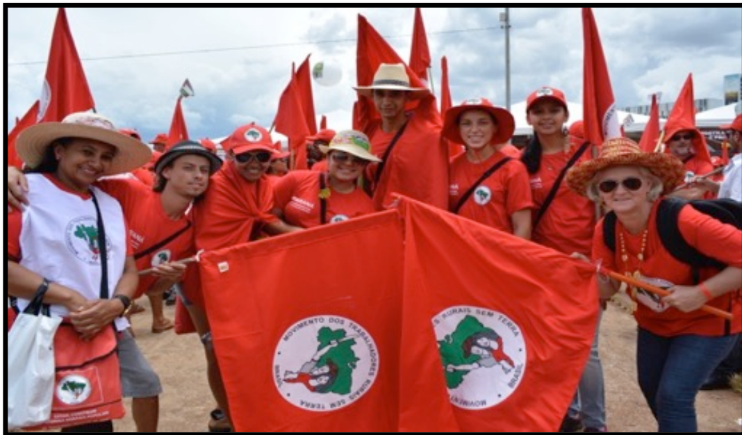
2/2014. Becoming active participants, Copavianos and friends get ready to march. Brasília.

Some leaders told me that the MST possesses a unique “culture of marching.” While the MST certainly did not invent marches, they organize them in a peculiar fashion, incorporating seemingly disparate elements, for example, those of a military parade, political rally, religious procession, and party (Chaves 2000: 25, see also Comerford 1999). 13 A news article captured such creative dimensions and uncanny juxtapositions in its description of the MST’s 1997 National March: