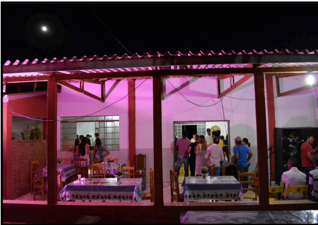
10/2013. Birthday party at Copavi. Festivities were held in the cafeteria.