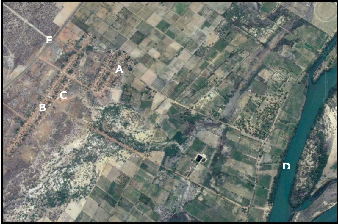
Satellite image of Semente, 2016, Google Earth. (A) denotes Agrovila I, (B) denotes Agrovila 2. The school lies approximately mid-way between the villages at marker (C). One can visually see individual irrigated farms, fenced in, that extend from the villages until the São Francisco River (D). The nearest city, Curaça, Bahia is located just beyond the river, and is accessible by motorboat. (E) marks Agrarian Reform Street. Although it

Those who farmed did not prioritize subsistence production. They sold crops to third-party transport companies at reduced rates (e.g., R$30 per box of mangoes). A few settlers hoped that they would eventually get governmental funds to develop an agroindustry on-site to process fruit pulps. This would allow them to capture value-added income and sell their fruits to governmental entities.