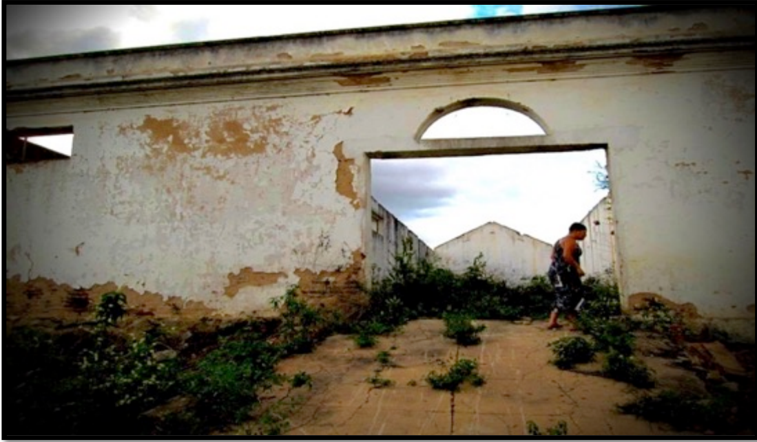
2/2014. Bruna gives me a tour of the “haunted” ruins of the former plantation.