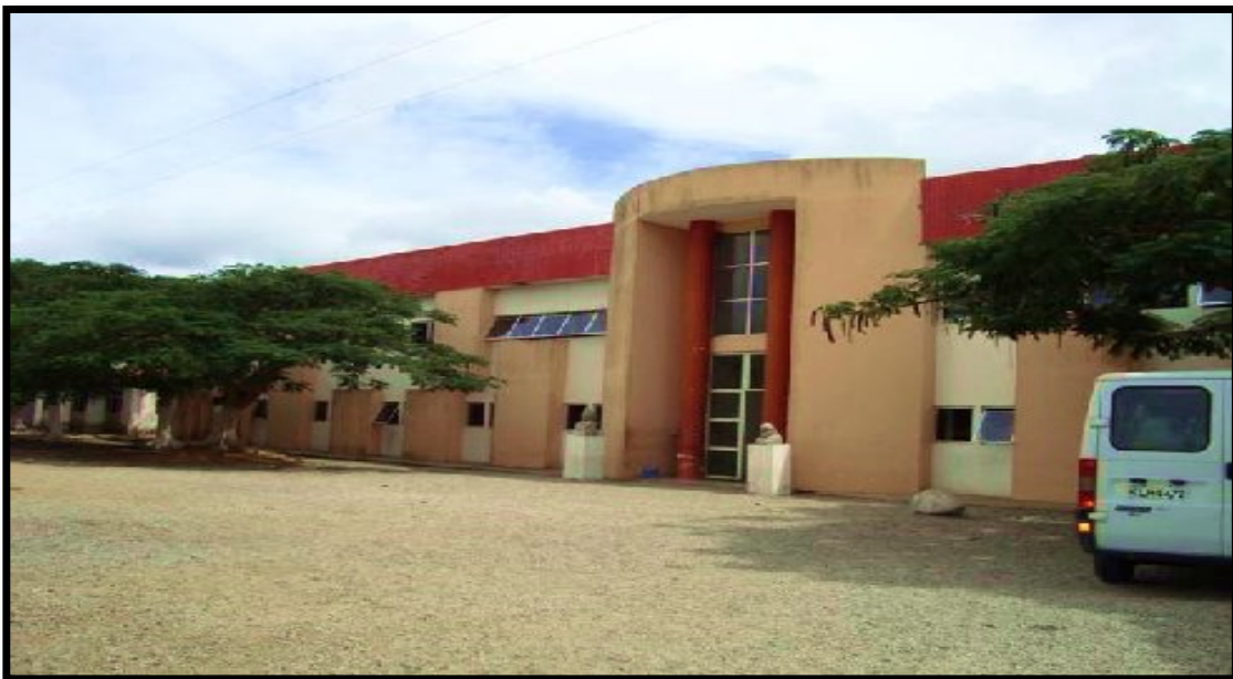
6/2014. View of Dormitories/Classroom Building, with Paulo Freire's Bust (on the Right), Che Guevara's bust was badly damaged and eventually removed.

Behind this antiquated structure, new additions had been made to the site. A bust of Brazilian pedagogue Paulo Freire stood in front of a large, two-story building with gender-segregated dormitories, with space to host one hundred guests. Metal barred-doors (which remained unlocked and open) separated the male and female quarters and lavatories. The