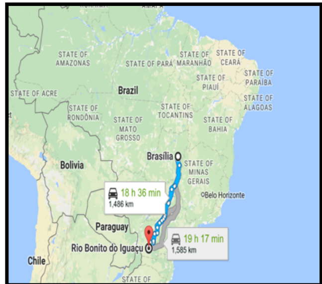
Figure III. Although google maps estimates the travel time to be 18-19+ hours, because we were on a bus and traveling in a caravan, it took three days.

The following days, as Bea had predicted, were not pleasant. First of all, the men on the bus were a noisy, exuberant bunch. Although the MST explicitly asked that males and females be equally represented, and special care to recruit youngsters be made, as mentioned, the young and female were significantly outnumbered. Of the thirty-five bus mates, ten were women and six were “young” (aged 15-29).