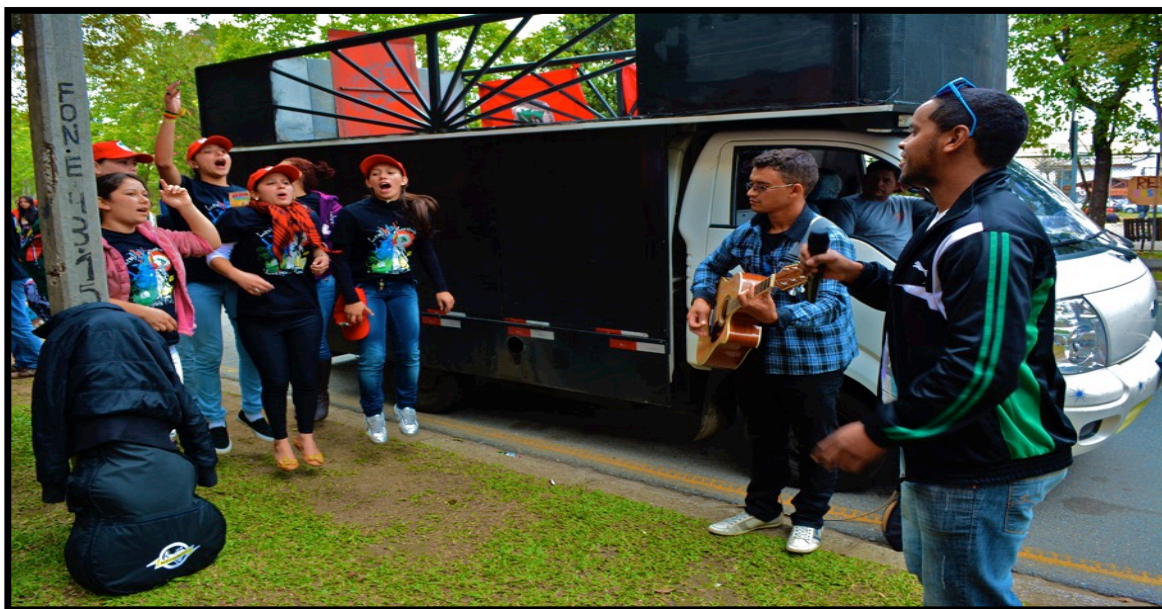
10/2013. Rural youth jump with glee and sing along while members of Saci Arte perform, outside an occupation of the Ministry of Education. Curitiba, Paraná.