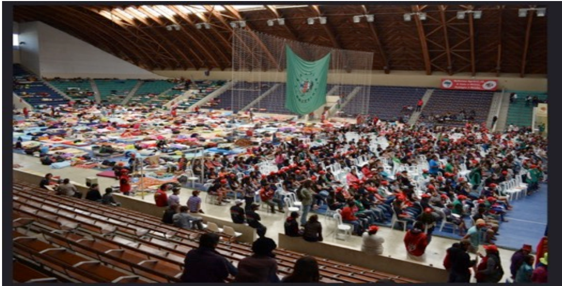
10/2013. MST-PR'S II Festival of Arts, held in a soccer stadium on the periphery of Curitiba, PR. There are sleeping mats on the left, and on the right young people watch the speech event.