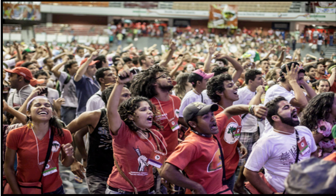
2/2014. Juventude Sem Terra: Estamos Aqui! Ebullient youth dance and shout during opening musical performances at the III National Landless Youth Assembly in Brasília.