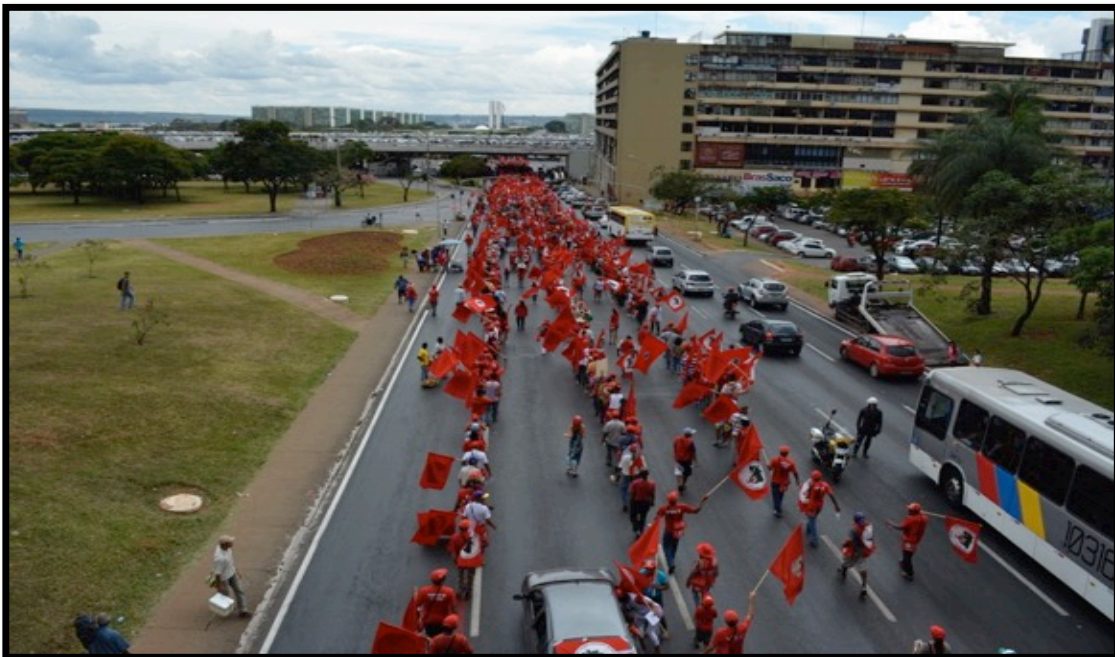
2/2014. View from the overpass, as the ranks marched through downtown Brasília.

After lunch, the 12,000 uniformly-clad delegates dressed in their MST t-shirts, donned caps and straw hats, and began to assemble themselves in single-file lines. All were instructed to leave name badges behind, to avoid being personally identifiable. The bodies snaked and spiraled around the stadium, until one-by-one, state-by-state, we slowly crawled out of the stadium's protected space and made our way towards the Palácio Planalto, some five kilometers away. The objective was simple: to draw public attention to the urgent need for agrarian reform and demonstrate the MST's ongoing relevance. It was, as Frantz Fanon might put it, "a spectacular gathering" (Fanon 1995: 181-182) where the MST exhibited its bodily forces in order to insist that after thirty years it was still a unified force to be reckoned with.