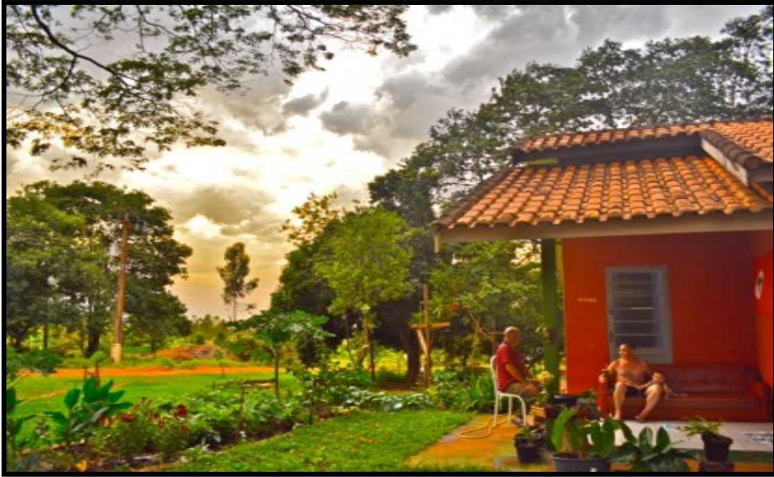
11/2013. Typical scene in the agrovila after work: Pia sits with his infant son, Dominic, and shares chimarrão with his neighbor, Silvio.

Copavi produces for the market (domestic, national, international) and for the subsistence of settled families. While it was difficult at first, they have developed a complex, durable productive structure over the last twenty years. In 2013, all of Copavi's residents (aged fourteen and older) worked in one (or more) of the productive sectors: agroindustry, bakery, commerce, administration, vegetable gardens, and dairy. Some were involved in the production of primary materials, such as: sugarcane, milk, vegetables, meat, forestry; processing raw materials, such as: baking breads and cakes, cheese and yogurt; refining brown sugar and molasses; packaging products to be ready for market; distribution to customers in nearby cities and the local school system; administration and planning, which involved tracking hours, investments, payments; and finally, others were involved in explicitly political activities.