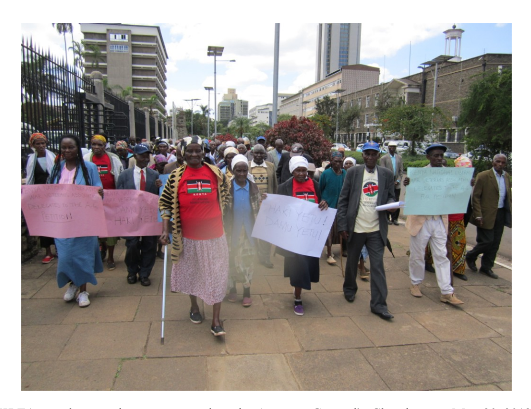
KLFA members on the protest march to the Attorney General's Chambers on May 30, 2012.