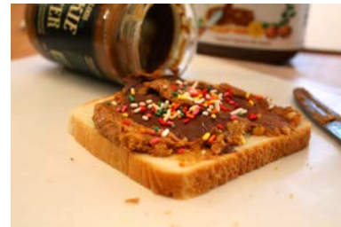
A White Bread Girl kinda sandwich

20somethings do so much more than just party and hookup. I started White Bread Girl to document my experience and offer other non-stereotypical 20something girls, an alternative persona for our generation.