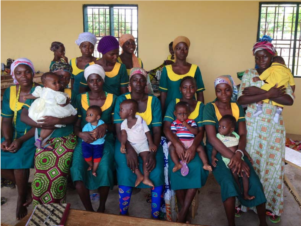
Mothers and their children at the Savelugu Regional Training Center.

Images from GIGDEV's Regional Training Centers