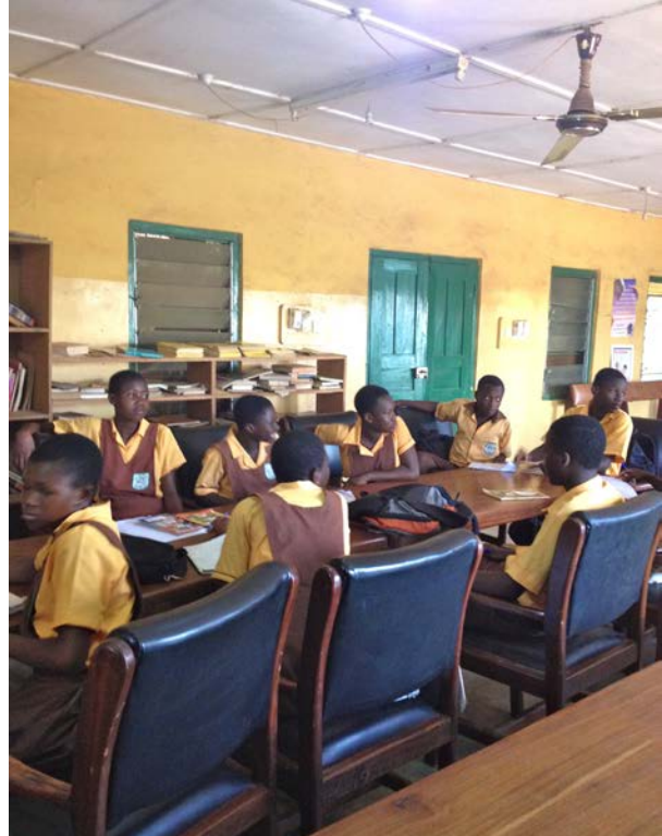
JHS students at a Young and Be Wise class.