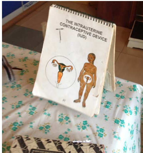
A book of contraceptives providing information for an IUD.