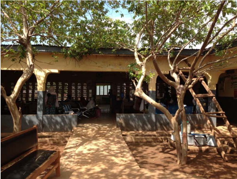
Figure 2: Courtyard of the Kalpohin Health Center