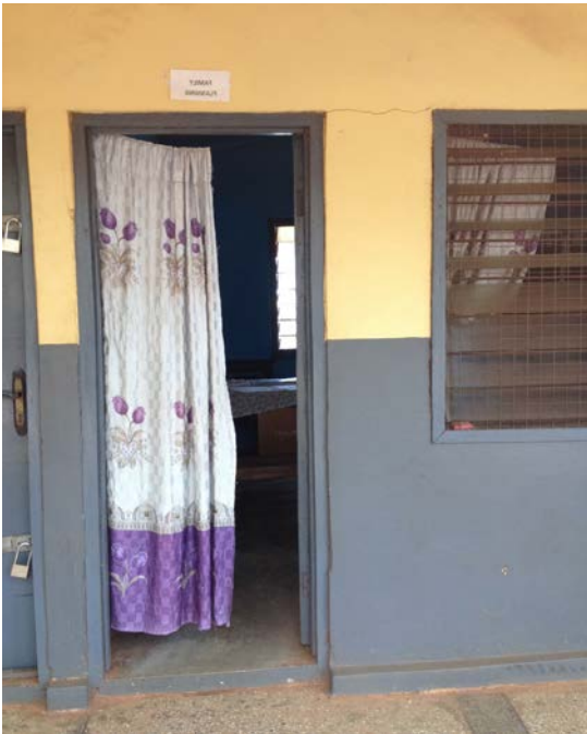
Figure 3: Family Planning consultation room at Kalpohin