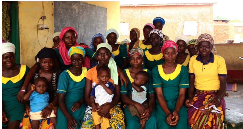
Mothers and their children at the Bognayili Regional Training Center.