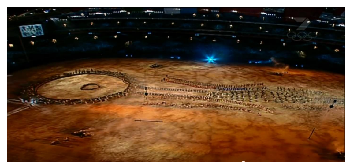
Figure 3: "Indigenous Tribes in Dance"