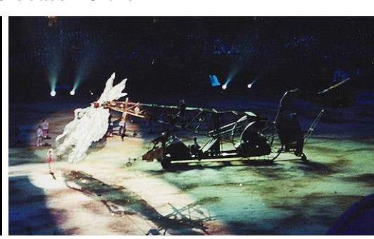
"Tin Symphony II"