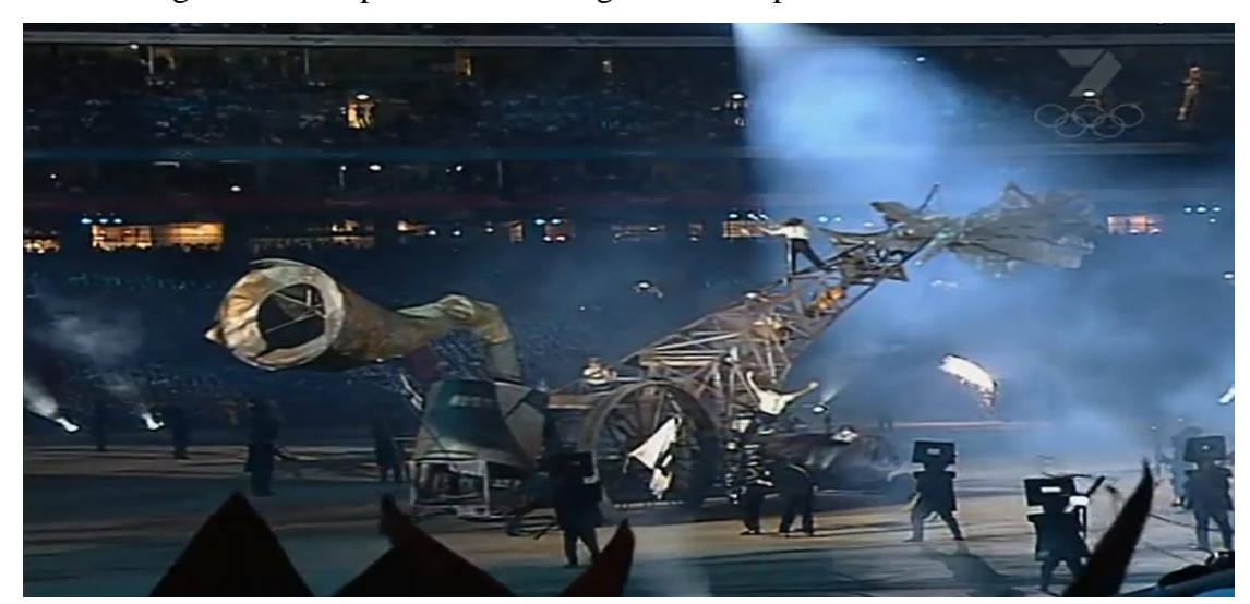
Figure 8: "Steel Horse of Technology"

A swift change to yellow-tinted lights and a switch to banjo-inspired folk music signals that the following scene symbolizes the pastoral elements of Australian country life. The audience immediately joins in clapping and stomping as performers clad as farmers usher sheep and herding dogs across the stage—"rural traditions taking hold" (Wilkinson). While earlier scenes from this segment featured wheels and cogs of factory machinery, the stage is now set with tools of agriculture and farming. Ranchers opening boxes labeled "exports" gather around the circumference of the stage (Fig. 12), and as the last sheep dog exits, actress Nikki Webster enters into the spotlight, feeding the steel horse an apple (Fig. 13). A cheerful Wilkinson remarks at the conclusion of the segment, "It was prosperity that fueled the growth of Australian cities and our young Aussie dreamer shares the dream that our great Australia continue to evolve" (Wilkinson). Here, prosperity relies not just on the industrialization and invention of technology but also on the agricultural exploitation of Indigenous-occupied lands.