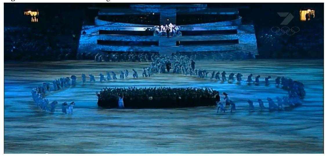
Figure 2: "Indigenous Tribes Join Together"