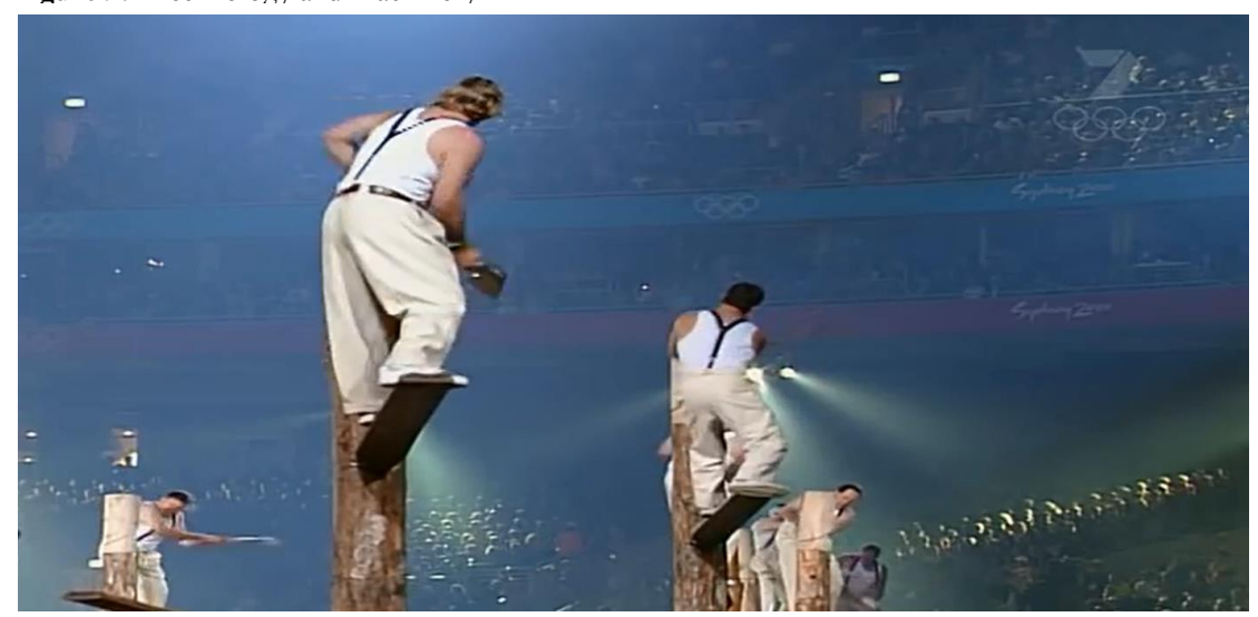
Figure 10: "Lumberjacks of Progress"