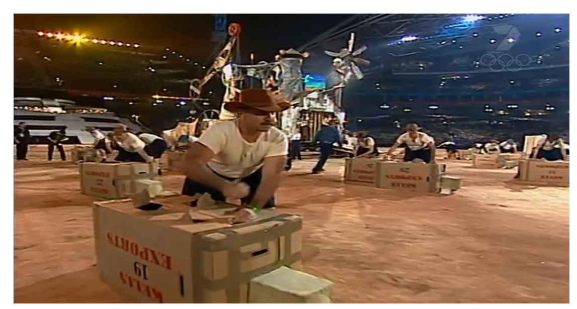
Figure 12: "Agriculture Modernity"