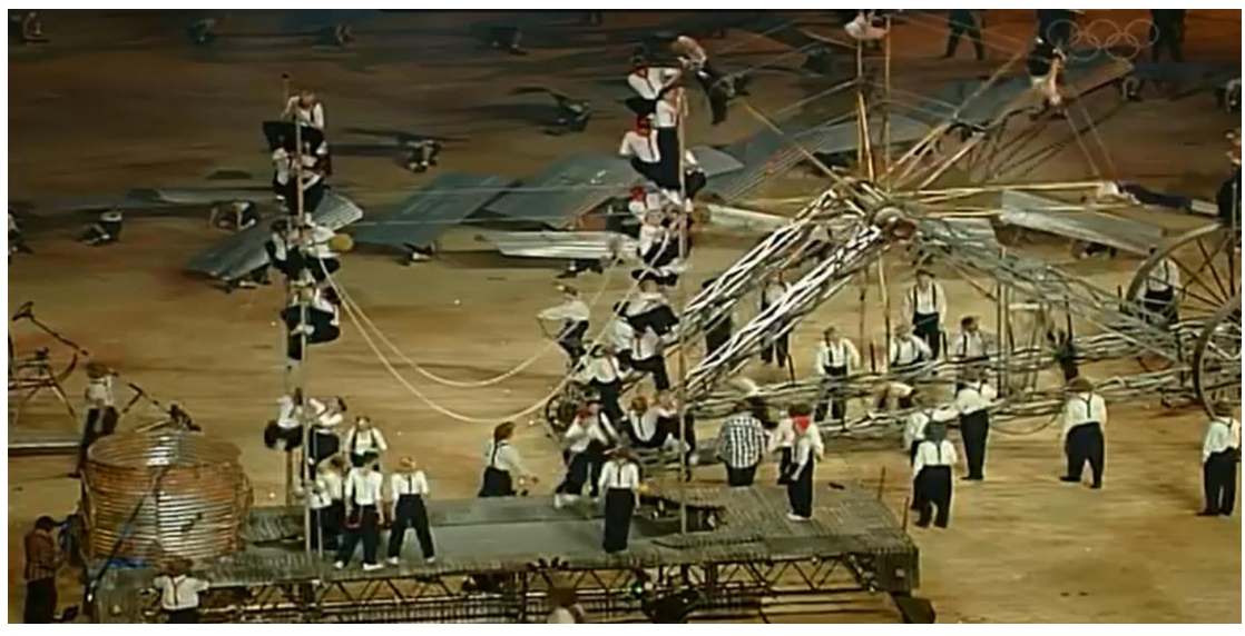
Figure 11: "Ladder of Progress"