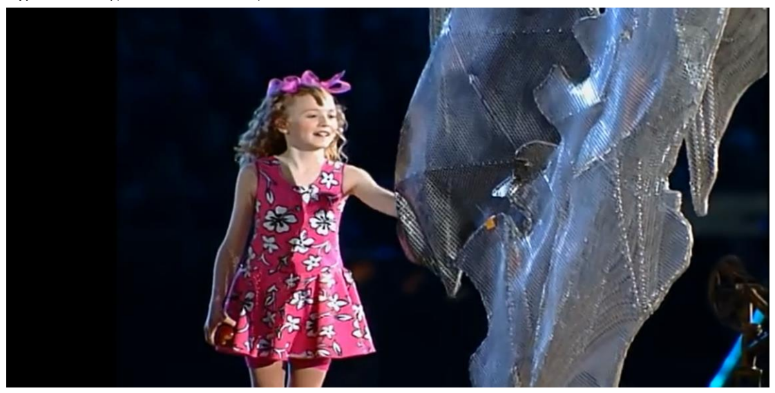
Figure 13: "Webster and Steel Horse of Progress"

While my first chapter analyzes the spectacle of "Awakening" through the analysis of racial representation, particularly in the script of its Indigenous population, a close reading of "Tin Symphony" reveals how the narrative staging of Australia's colonization and modernization by European settlers entails profound effects on not just racial representation but gendered representation as well, working to promote the notion that ideal Australian citizenship relies on the production of bodies, of goods, and of dominant ideologies.