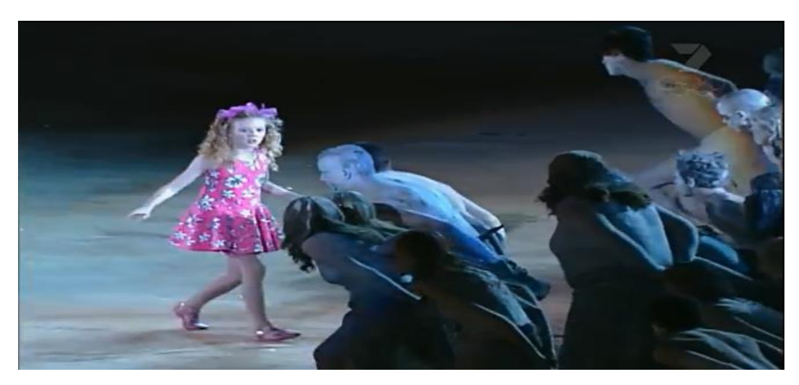
Figure 1: "Webster Meets Aboriginal Australians"

though he is walking on clouds (Fig. 4). Djakapurra then joins the performers below, each tribe slowly merging together back into one mass as an Aboriginal symbol for sunlight is lifted towards the ceiling of the arena (Fig. 5). Each tribe, again as one group, walks towards the prop, raising their arms upward as the audience then joins in a similar motion, cellphones and glowsticks held high in the air (Fig. 6).