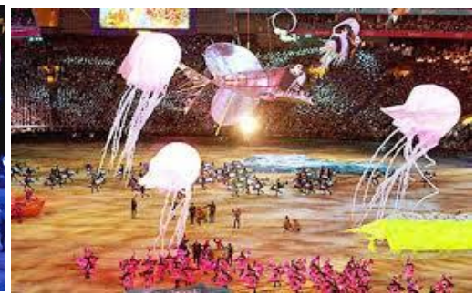
"Deep Sea Dreaming II"