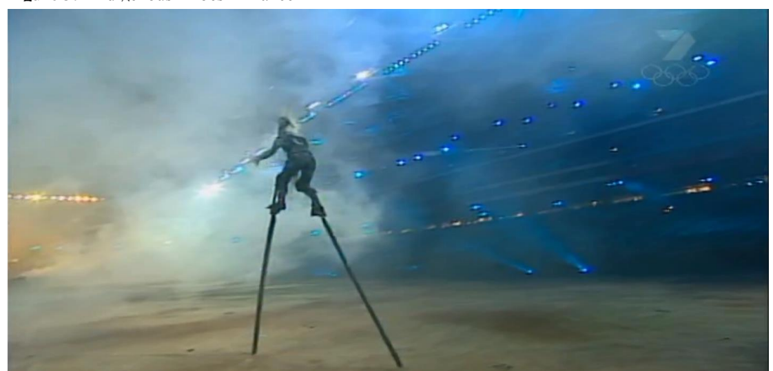
Figure 4: "Man on Stilts"