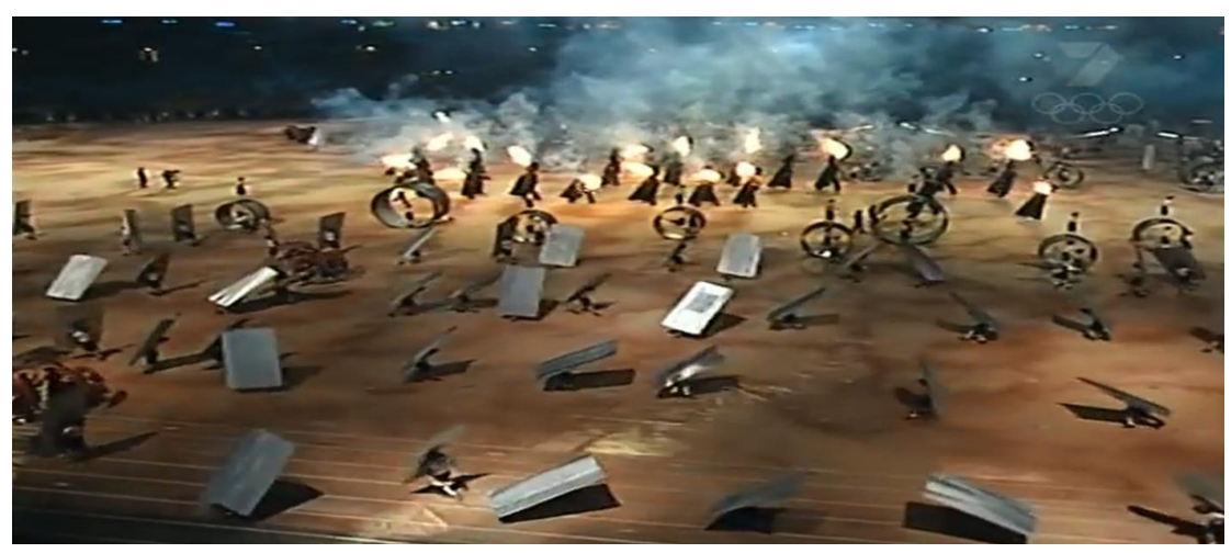
Figure 9: "Technology and Machinery"