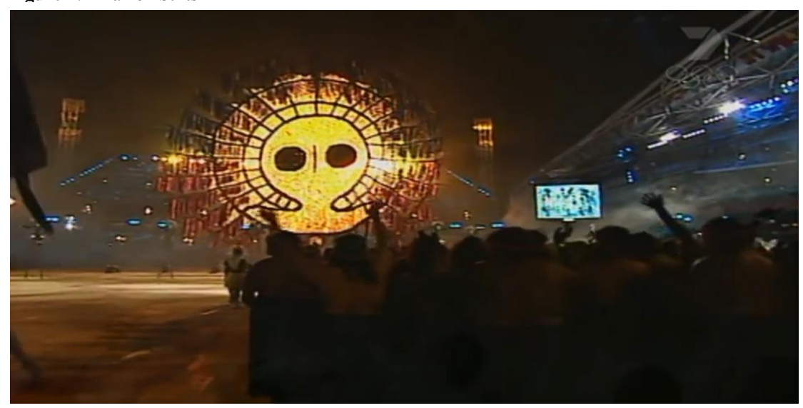
Figure 5: "Aboriginal Sun"