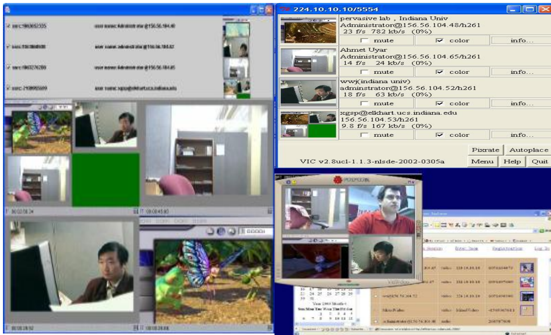
Figure 2 Prototype Demo pictures