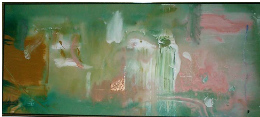
24. Untitled , 1979, acrylic on canvas