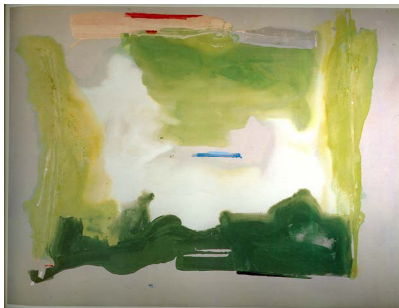
22. Lush Spring , 1975, acrylic on canvas, 7'9" x 9'10"