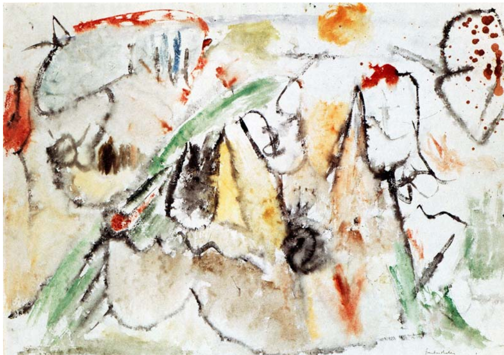
4. Great Meadow , 1951, watercolor on paper, 22 x 30"