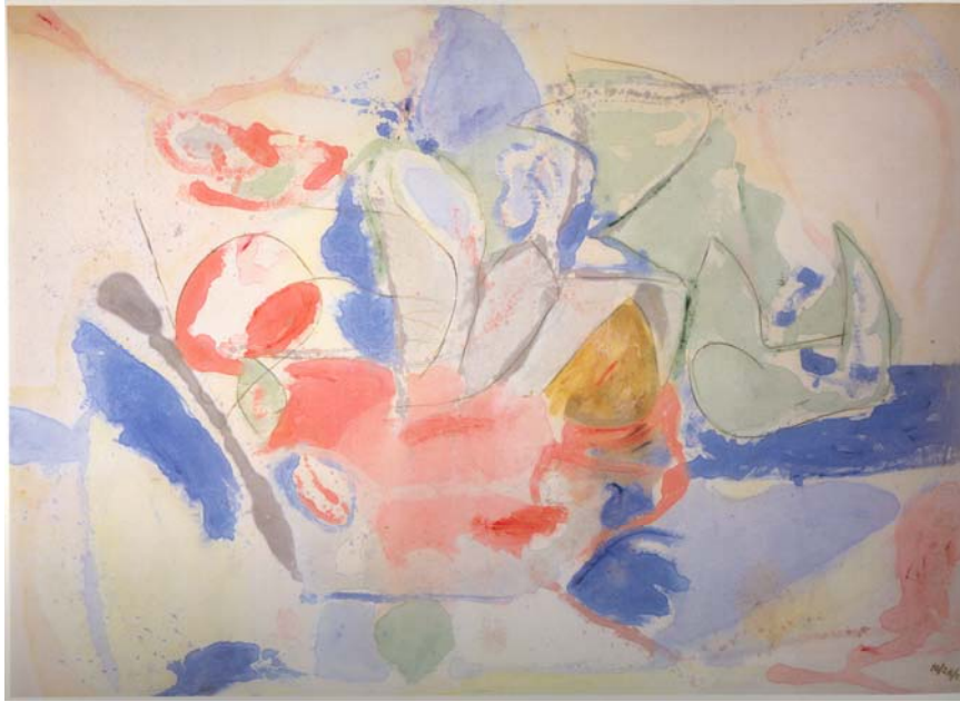
1. Mountains and Sea , 1952, oil on canvas, 7'2 5/8" x 9'9 1/4"