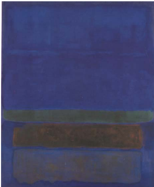
6. Rothko, Blue, Green and Brown , 1951