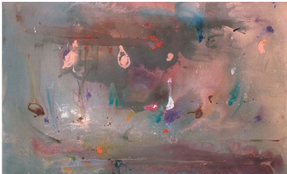
25. Grey Fireworks , 1982, acrylic on canvas, 6' x 9' 10 1/2"