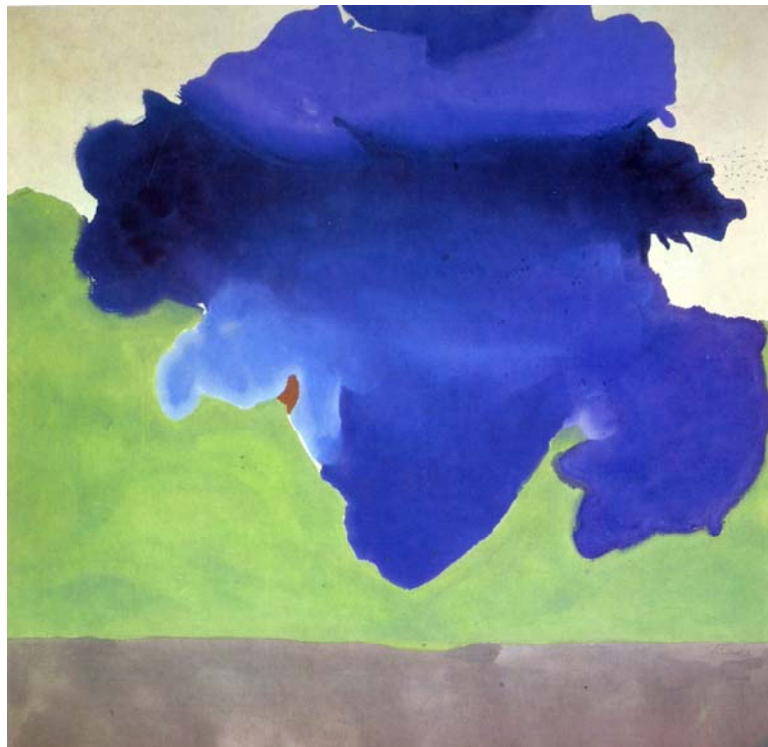
19. The Bay , 1963, acrylic on canvas, 6'8 3/4" x 6'9 3/4"