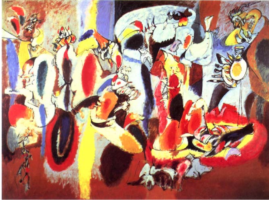
5. Gorky, The Liver is the Cock's Comb , 1944, oil on canvas, 6' 1 1/4" x 8' 2"