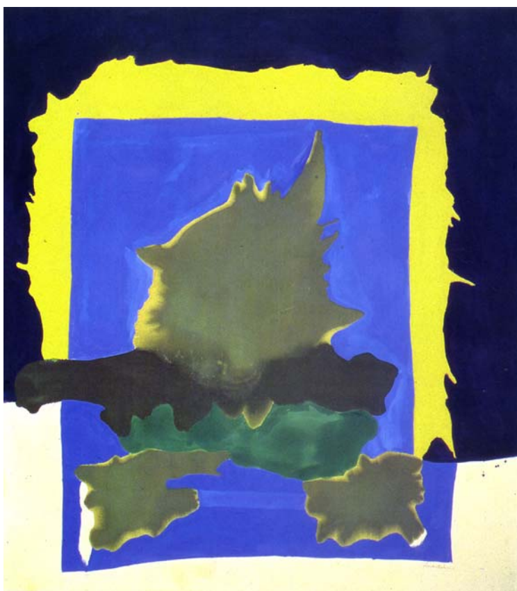
26. Interior Landscape , 1964, acrylic on canvas, 10' 4 3/4" x 9' 2 3/4"