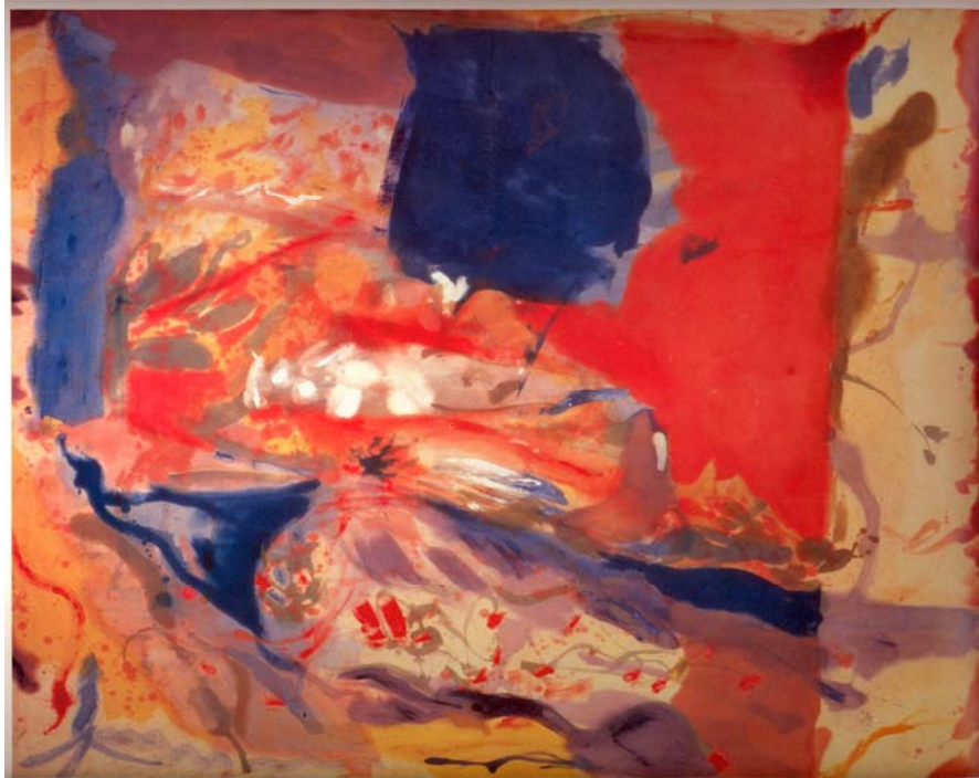
12. Lorelei , 1956, oil on canvas, 5'10 5/8" x 7'2 3/4"