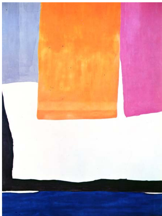
20. The Human Edge , 1967, acrylic on canvas, 10'4" x 7' 9 1/4"