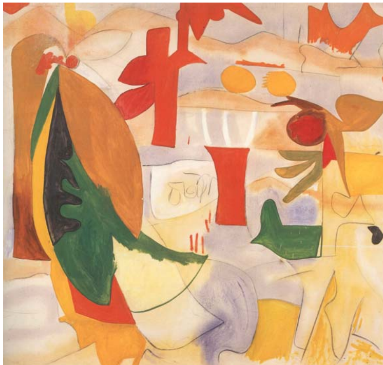
10. Abstract Landscape , 1951, oil on sized, primed canvas, 5'9" x 5'11 7/8"