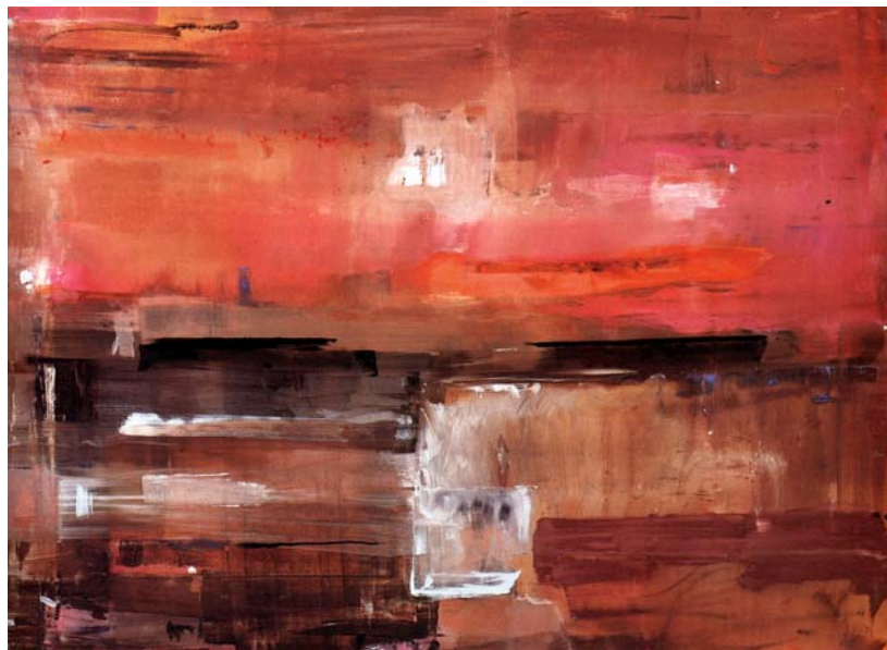
23. Natural Answer , 1976, acrylic on canvas, 8 x 11"