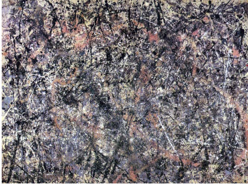
7. Pollock, Lavender Mist , 1950, Oil on canvas, Oil, enamel, and aluminum on canvas, 7'3" x 9'10"