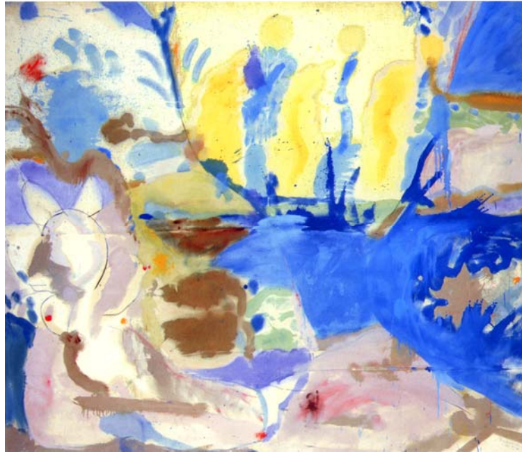
15. Basque Beach , 1958, oil on canvas, 4'10 5/8" x 5'9 5/8"