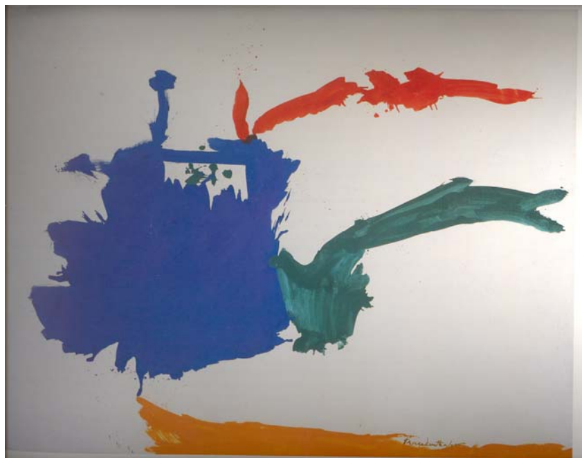
16. Italian Beach , 1960, oil on sized, primed canvas, 5'7" x 6'10"