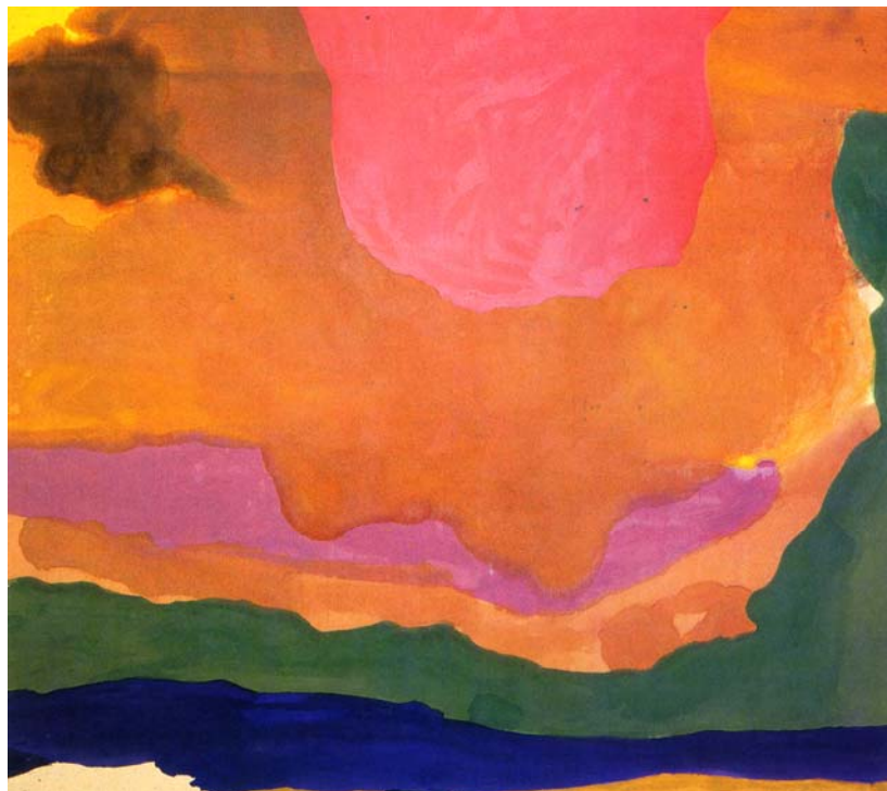
21. Flood , 1967, acrylic on canvas, 10'4" x 11'8"