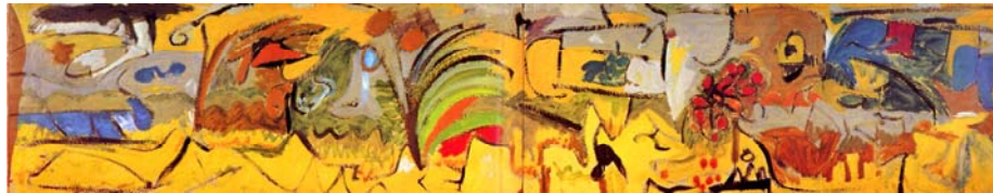
8. Ed Winston's Tropical Garden , 1951, mixed medium on paper on mounted board, 3'1/4" x 15'11/4"