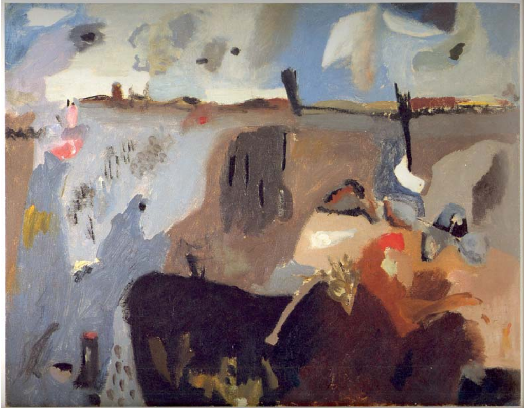
3. Provincetown Bay , 1950, oil on sized, primed canvas, 16 1/4" x 20 1/4"