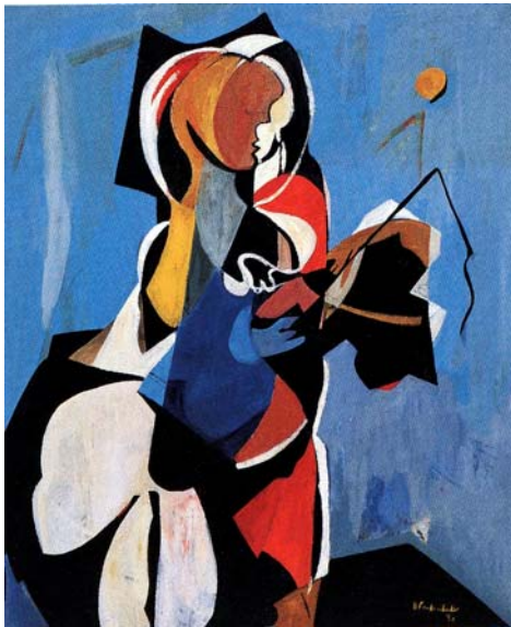
2. Woman on a Horse , 1948-1950, oil on sized, primed canvas, 4'2 1/4" x 3'4"