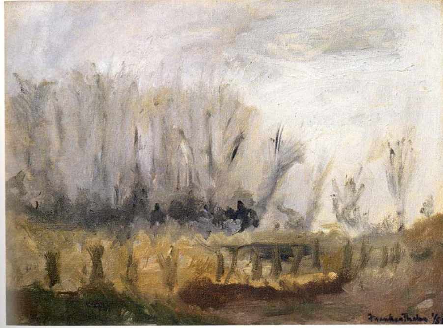
11. New Jersey Landscape , 1952, oil on canvas, 9 x 12"