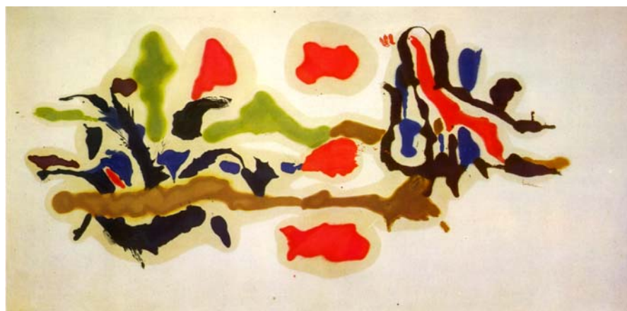
18. Seascape with Dunes , 1962, oil on canvas, 5' 10" x 11' 8"