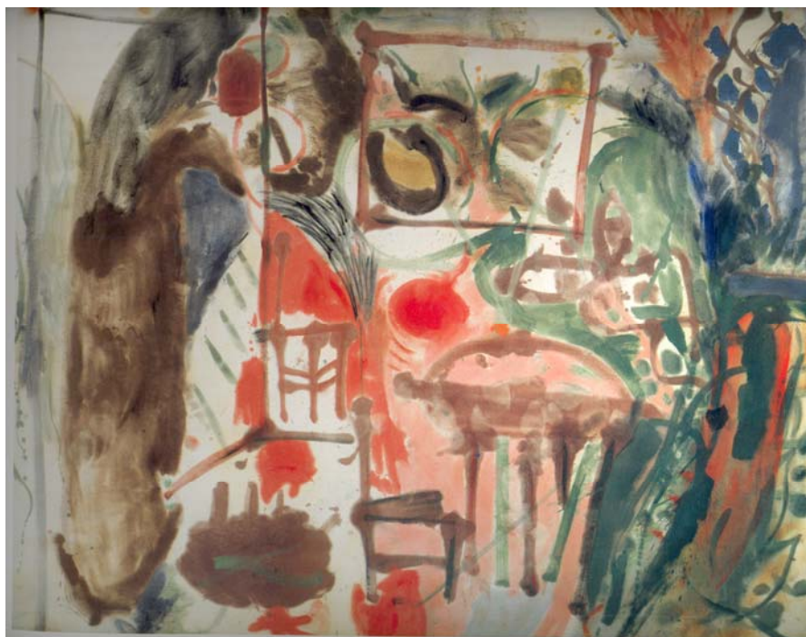
14. Interior , 1957, oil on canvas, 5'10" x 7'2"