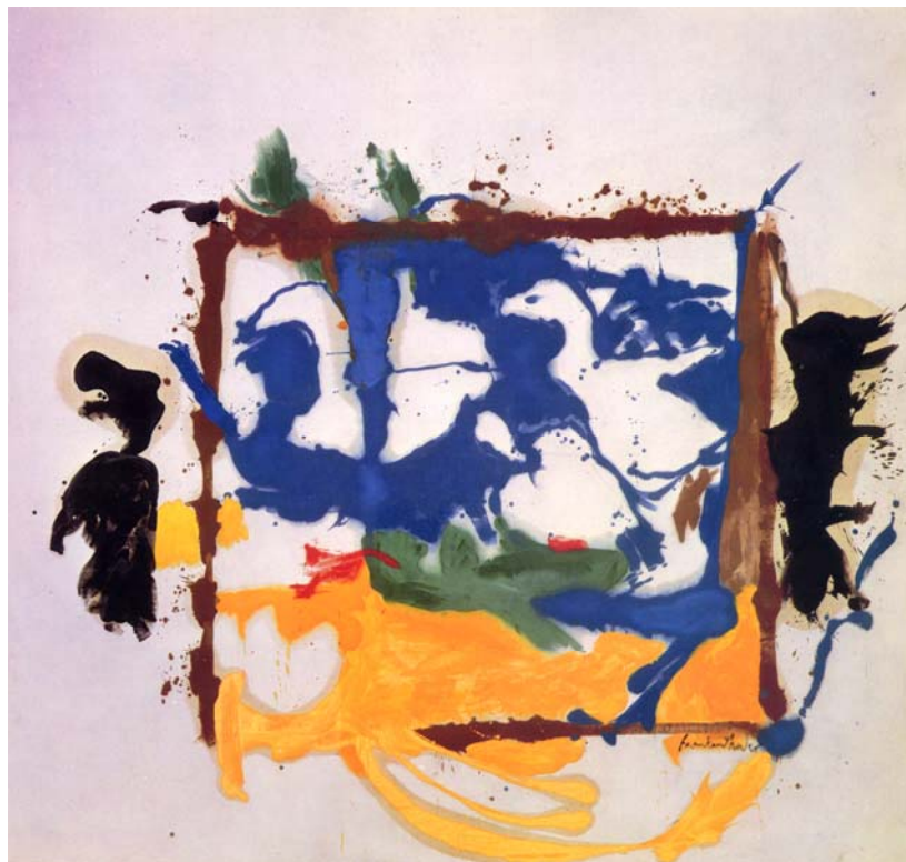
17. Swan Lake I , 1961, oil on canvas, 7' 5 1/8" x 7' 9 3/4"