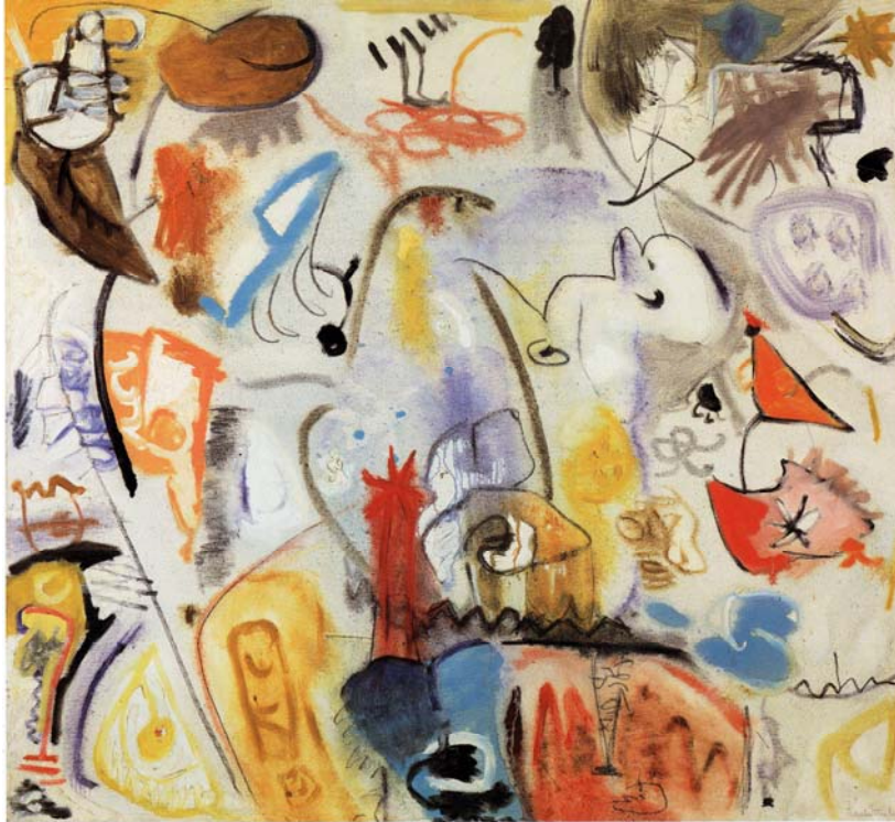
9. Circus Landscape , 1951, oil on sized, primed canvas, 40 x 44"