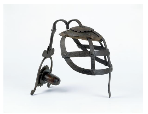
Figure 4. The Scold's Bridle

No such instrument is used in Shakespeare's play, but Shrew's public declaration of its silencing objectives recall the memory of such shaming rituals. The question becomes, should the play welcome praise for its kinder shrew-taming tactics, or does its revision of this history of physical abuse only perpetuate the persistent social problem of gender relations and the male desire to quell female threats to the social order? We seek the answer, once again, in Kate's speech. Two readings emerge. If we read Kate's speech as a vocal performance of her authority and ability to simultaneously comply and defy, as multiple productions in which Kate slyly winks at the audience have already done, the "kinder" form of taming employed by Shrew may seem harmless, if not empowering, for the woman who can manage to manipulate it in her favor. If taken literally, however, the submissive nature of the address suggests that though she is given these 44 lines of speech, Kate has ultimately been bridled.