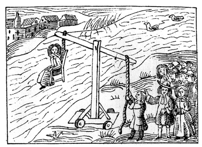
Figure 3. The cucking stool

abuse in early modern cultural and social history. In her edition of Shrew , Dolan offers an extensive discussion of the social phenomenon that was the "tenacious popular tradition of depicting domestic violence as funny" (Dolan 244). Fueled by a general fear of the disturbance of the patriarchal social order and overall domestic harmony, the early modern Englishman and woman would have engaged in the acts of "singing songs, repeating stories and jokes, and participating in as well as observing shaming rituals," both producing and absorbing "lessons in proper gender relations" (Dolan 244). One such public shaming ritual was "cucking," or dunking the shrewish woman repeatedly into cold water until she quieted, as depicted in the following figure: