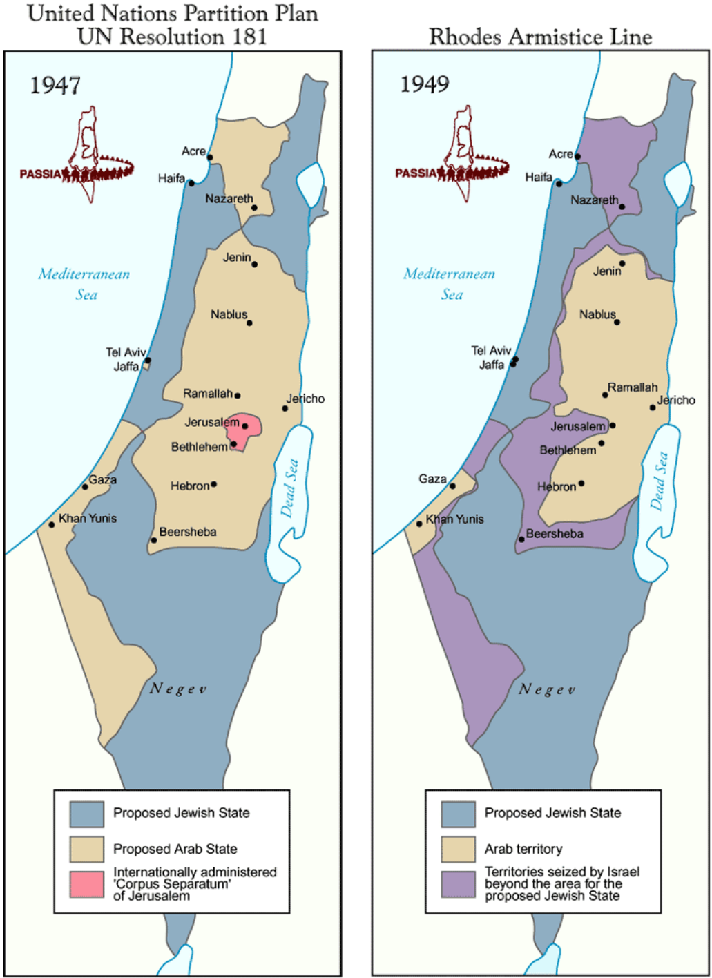
Image A. Illustration of Jewish and Arab territory before and after the armistice agreement. (Palestinian Academic Society for the Study of International Affairs)