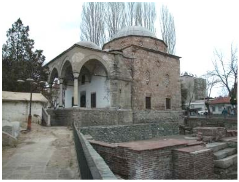
Oblique view from right side showing the setting of the monument above the site of the Roman baths of Kyustendil (Roman Pautalia). The present-day bathhouse, the core of which is Ottoman, is located little more than a dozen meters opposite the front of the portico, i.e. just to the left of the area contained in the photo.

The condition is very good, although there are signs of moisture penetrating the half-dome.