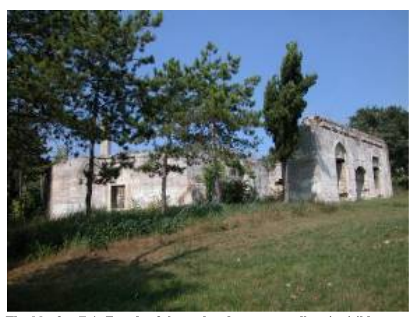
The Meydan Evi. Façade of the enclosed entrance gallery is visible at the far right; the remains of the seven-sided minaret-like chimney of the hearth of the main chamber is visible behind the tree at the left. Originally, the main chamber had been covered by a high conical wooden roof and the vestibule by a similar roof. These roofs were destroyed and the chimney of was damaged long ago, possibly (this requires verification) by a Russian artillery bombardment during the Russo-Turkish war of the 1870s. At the time, Russian and Bulgarian artillery indeed considered it sport to bombard minarets of mosques.

The condition of the mausoleum has deteriorated rapidly over the last decade. The exterior stonework shows extreme exfoliation and the interior dome and walls show signs of dampness and water damage. Intervention is needed to prevent this well-preserved monument from deteriorating rapidly. The ceremonial hall would benefit from being cleaned and conserved, and possibly by recreating its original (seven-faceted) conical wooden roof over the main hall and a similar roof over the vestibule.