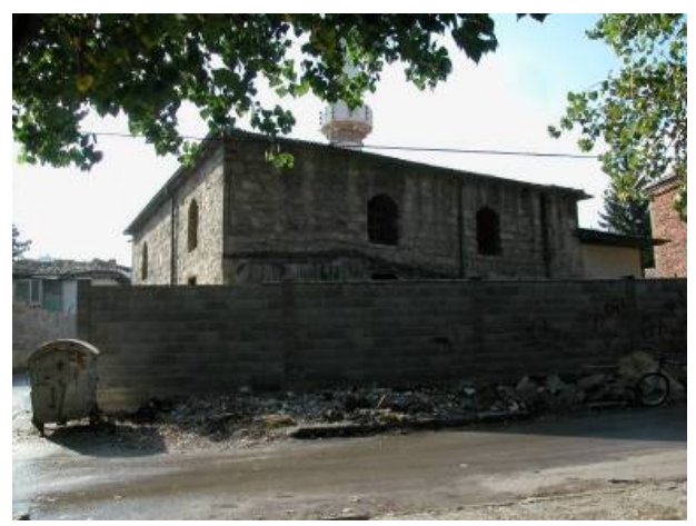
Lateral view from street. Note qibla wall at left and enclosed portico at right.

The building appears to be in fair condition despite some buckling of the walls and staining due to dampness.