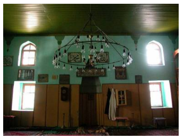
Interior towards mihrab.