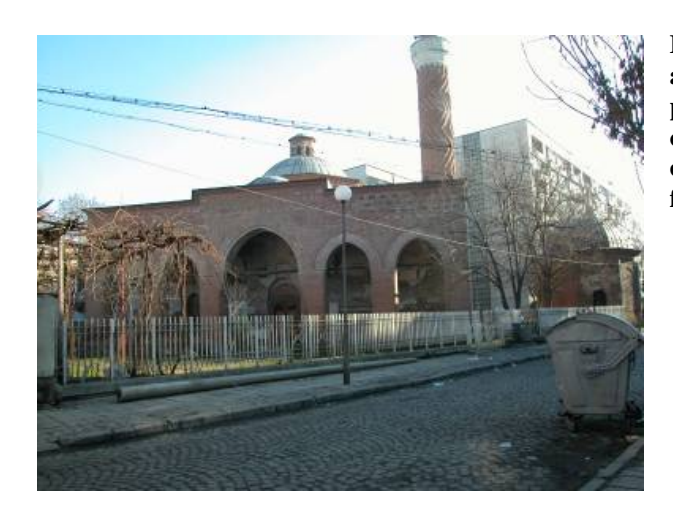
Façade from street. Note mass and severe geometry of the portico. Also note the covered oculus atop dome the dome of the central vestibule. The türbe of the founder is visible at the far right.