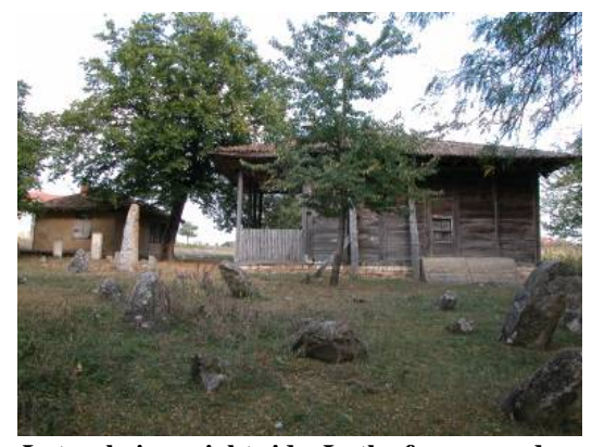
Lateral view, right side. In the foreground, the remains of the cemetery. At the far left, the former mehteb . Note the older wooden buttressing of the wall of mosque and more recent brick and concrete reinforcement at the base of the wall.