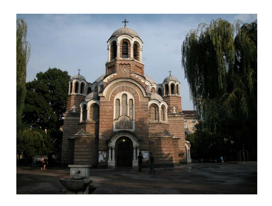
United States Commission for the Preservation of America's Heritage Abroad 2010