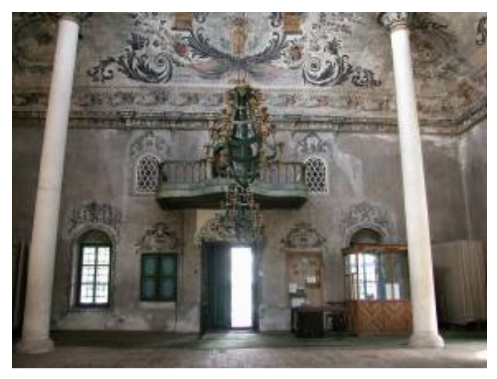
Interior towards entranceway. Note small but elegant wooden \it mafil and latticework windows from \it medresse .