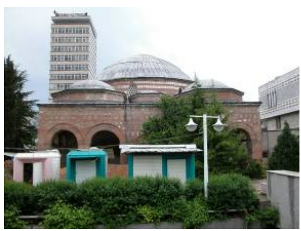
Frontal view of mosque. It is possible that the three domes over the portico are the product of later (possibly 18<sup>th</sup> century) renovation. The sixpier, five-arch design of the portico ordinarily would suggest the presence of five domes, one over each arched space.

The round shape of the windows in the tambour, a form associated with the Ottoman baroque, suggests that the mosque may have undergone substantial renovation sometime late in the 18<sup>th</sup> century. A partial restoration was carried out in the 1970s, during which the portico was opened up (it had been bricked in after the independence of the Bulgaria and the flight of almost all of the city's Muslims). As part of the restoration, the mosque's minaret, (a late-19<sup>th</sup> century copy of its original minaret) was razed. The original minaret had been destroyed during the Russian bombardment and invasion of Stara Zagora in 1876. Adjacent buildings and a warren of alleyways were also cleared away at the time of the restoration, freeing the structure on all four sides. The site is owned by the Municipal Museum of Stara Zagora.