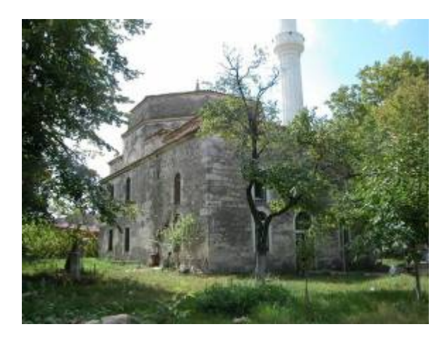
Oblique view facing front of mosque.

This mosque is located in the town of Suvorovo, which is 30 minutes west of Varna on the highway to Shumen. Built in the 16<sup>th</sup> century, the interior was partially restored (painting and plastering) around the year 2000. The walls of the portico are of far rougher-hewn stone than the massive, finely cut, and precisely placed stones comprising the exterior wall of the sanctuary proper, suggesting that the enclosed portico may be a later addition built to replace an original open portico. Walling-in porticos was common after 1876 as remaining Muslims sought privacy and security in newly-independent Christian Bulgaria.