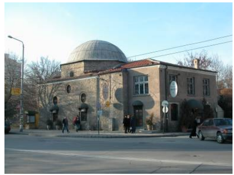
Oblique view showing adjacent building through which the former mosque is entered.

This is one of only three mosques remaining in a city that once boasted dozens. Its location near the Maritsa is indicative of the spread of the city during Ottoman times.