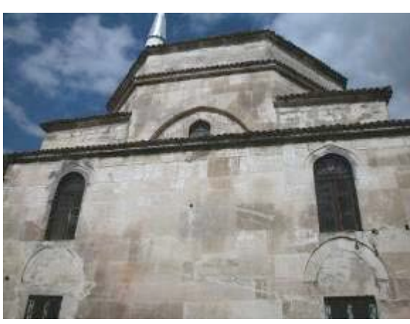
Rear view also reveals quality of stone work and double tambour with corner "wings" covering interior half-domes.

The mosque is located in a large enclosed courtyard with a locked gate on the main street of Suvorovo. The structure is a typical Ottoman domed cube preceded by an enclosed portico. The large sandstone blocks used to construct the building probably came from nearby quarries. The walls are unusually heavy, measuring approximately 1.2 meters in thickness. The transition from walls to dome is accomplished by eight arches and pendentives. Half domes in the corners of the interior lend support to the dome. The sanctuary measures approximately 12 by 12 meters. The enclosed portico runs the full width of the mosque and has a depth of about five meters.