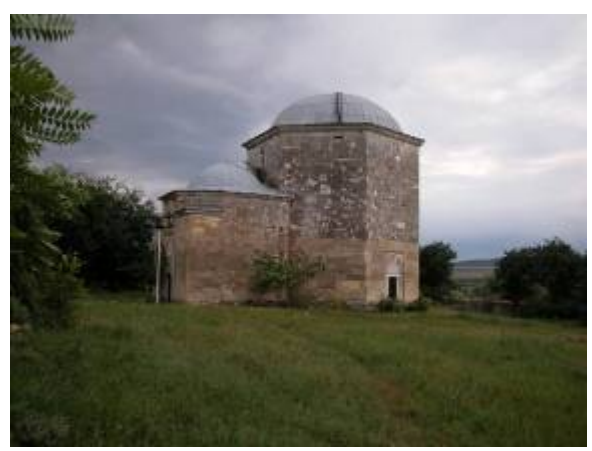
Türbe of Ak Yazili Baba. Note enclosed portico with setbacks at left and right to form an irregularly-shaped hexagonal transition drum between dome and walls. Also note the tall heptagonal main chamber and its lack of transitional drum. Also interesting is the difference between the fine ashlar at the lower levels of the walls of the main chamber and the rougher stonework above.

This tekke , established in the 16<sup>th</sup> century, is located in the village of Obrochishte, located near Balchik. The site originally functioned as a mausoleum and ceremonial meeting hall comprising the main elements of a heterodox Muslim tekke . The mausoleum still contains the grave of the saint and attracts local as well as Turkish tourists and pilgrims. It is a major work of Ottoman art and is the most complete classical tekke remaining in Bulgaria.