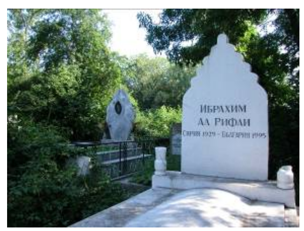
A grave of a Syrian Muslim reaffirms the official Muslim identity of the cemetery.