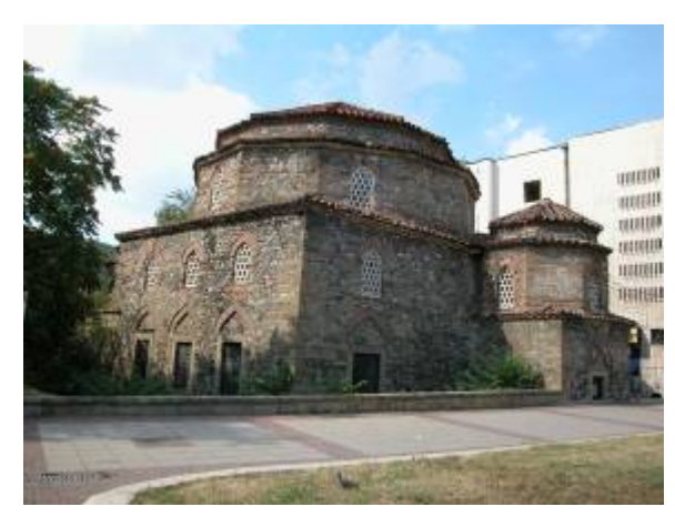
Rear of mosque from main city square. Note semi-attached türbe of founder on the right.