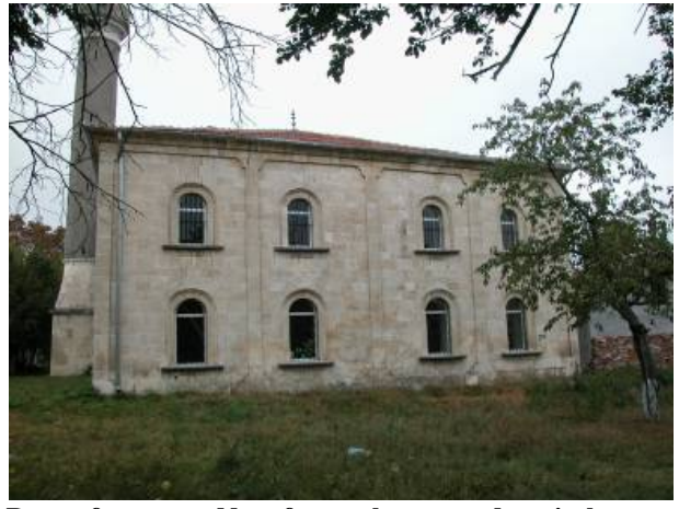
Rear of mosque. Note faux columns and capitals.