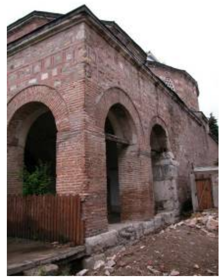
Close-up of piers. Note that the piers are of brick. Also note the high-quality of the cloisonné work and that the portico and sanctuary are of a single piece. Signs of excavation work are visible in the foreground.