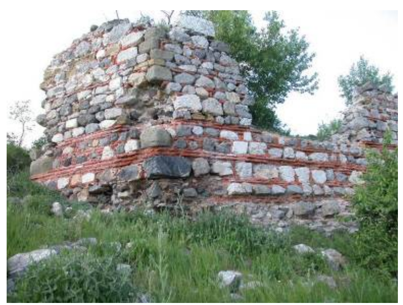
The meydanevi is built at the end of a precipice.