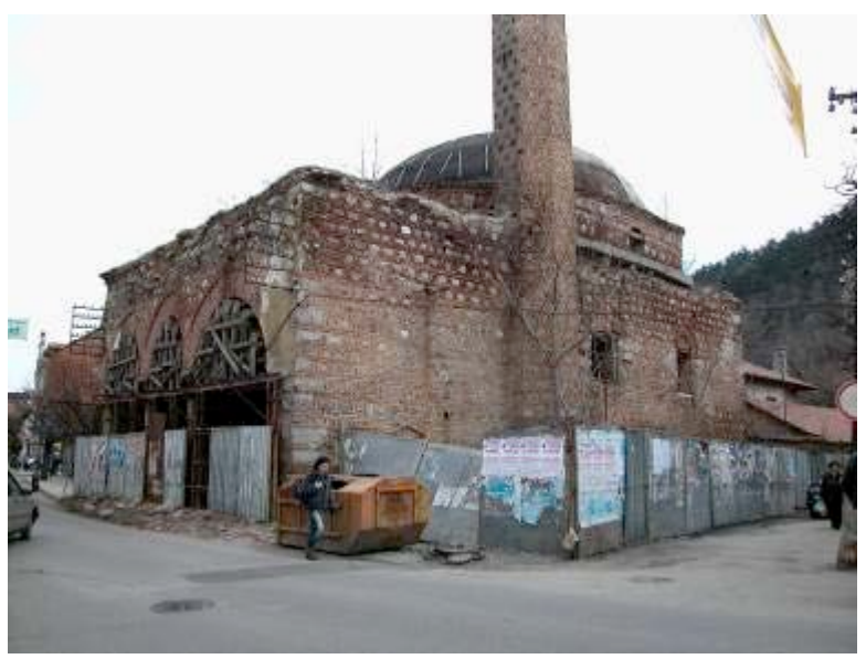
Oblique view from right. Mosque fronts on the main traffic thoroughfare running through Kyustendil.