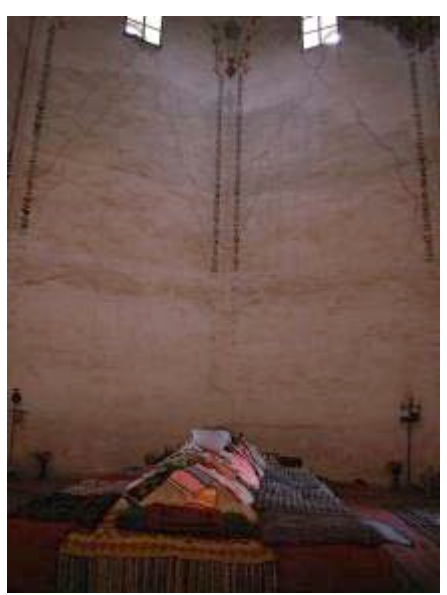
Grave of the saint in the context of the walls of the mausoleum chamber. Note the height of walls and high placement of windows.

The meydan evi (a hall for devotional ceremonies) is roofless and derelict, but the presence of an improvised stage and scattered chairs and lights indicates that it is also being used for performances. Recent restoration work was performed on the lead paneling of the mausoleum dome, but as interior dampness indicates, it was not successful. There are cracks in the interior walls that appear to have been unsuccessfully patched, as seepage is still evident. A sign at the site reports that the fencing that surrounds it to keep out grazing livestock was recently rebuilt by the Beautiful Bulgaria Project, a joint program of the UNDP and Bulgarian Ministry of Labor to provide work and training through the restoration of architecturally worthwhile façades. The site is a Bulgarian "Monument of Culture." The owner is probably the Ministry of Culture via the regional museum in the nearby town of Kavarna (Asen Salkin, director).