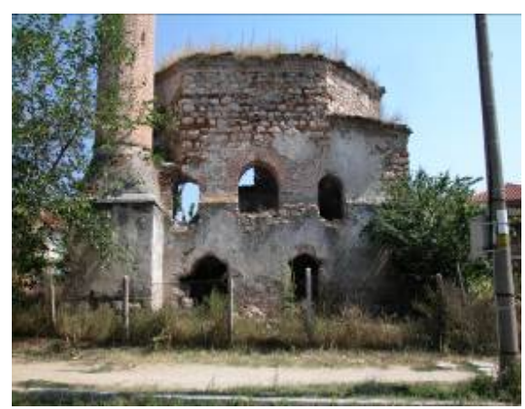
Lateral view with minaret.

Located in the city of Gotse Delchev, formerly called Nevrokob, this partially collapsed mosque was built in the second half of the 15<sup>th</sup> century by the son(s) of Dayi Karaca Bey, an important Ottoman official. The fenced-in ruin is set in a rubbish-filled lot at the intersection of two streets. The site is surrounded by chain link and barbed wire fencing affixed to concrete posts. Access is awkward. Part of the lot is used as a vegetable garden.