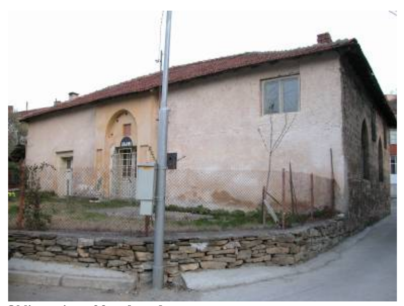
Oblique view of façade and entrance.

The building appears stable from the exterior.