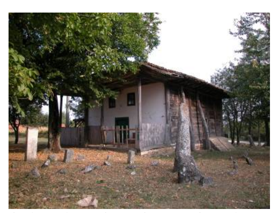
Oblique view to front of mosque from right. Remains of cemetery in foreground.

The interior walls show evidence of dampness. The brickwork at the foundation and the newly poured concrete buttresses suggest past and potential future instability of the walls, possibly due to shifting soil, which is a problem endemic to the region.