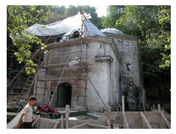
Oblique view of the türbe from right.

The structure was built in the Ottoman style with characteristics (including the style of transition from the dome to the walls of the main chamber) that suggest construction in the late 18<sup>th</sup> century. The heptagonal shape of the tekke is associated with Bektashi and Hurufi-related mausoleums; the number seven being significant in Hurufi teachings.