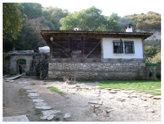
Approach to complex. Gateway at left; rear of imaret/meydan structure at right.