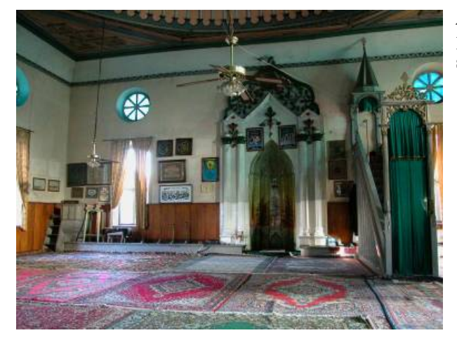
Mihrab and minbar . Note eclectic, partially neo-gothic, decorative elements surrounding mihrab .

Mosque is on the second story of the structure. Modern shops occupy the former carşi on the ground floor. Wall perpendicular to the façade encloses the portico which is entered through the rear of the structure.