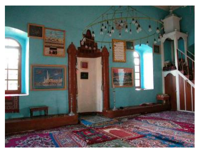
Mihrab and minbar.