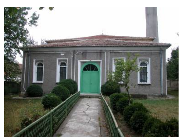
Entrance through walled-in portico.

The overall condition of the building is quite good. There is some evidence of dampness on the interior and exterior of the walls as well as some shifted stones possibly due to past earthquakes.