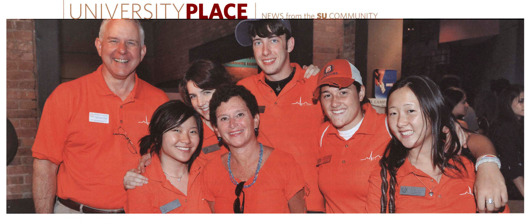
National Honor >>