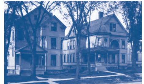
Parker Cottage on the right.

A number of students were passing by at the time and Philip Lightall and Ernest Knodel volunteered to go up and put out the blaze. The upper hall was filled with dense smoke. The students went into the room and began to throw the burning things from the window. While they were doing this, Mrs. Scott, together with two girls in the house, carried buckets of water to the men with which to extinguish the flames. One of the girls ran over to the cottage next door and got a fire extinguisher. With this and the water the men put out the blaze before it was necessary to call the fire department.