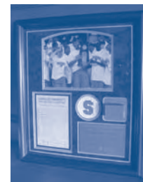
2003 Syracuse men's basketball team commemorative plaque, which includes an actual piece of the hardwood court from the Carrier Dome.

Archives has already begun scanning images of SU football legends Jim Brown, Ernie Davis, Larry Csonka, Tim Green, Floyd Little, and Art Monk for possible use by Syracuse Steiner Collectibles. Basketball greats Pearl Washington and Dave Bing