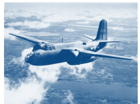
An A-20C in flight over Newfoundland

After strategizing a plan of attack, I decided there was no easy route. I slowly began devising categories for the prints as I began to recognize similarities throughout