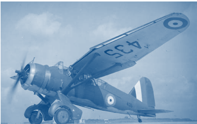
A Lysander on the runway

the front. However, just as many were not accompanied with a description or any indication as to where or when the photograph was taken or what the photograph was of.