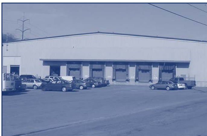
The University Records Center is housed at the Hawkins Building.

The University Records Center is a secure, cost-effective, climate-controlled facility. It is specifically designed to hold University records that must be retained for legal or administrative reasons, but are not referenced often enough to warrant storage in expensive office space. Once there, records can “wait out their time” until destruction. Records stored in the Records Center may be retrieved, normally within 24 to 48 hours. Emergency requests can also be handled.