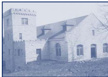
One of our favorite "lost buildings" is the old Power Plant (also known as the Power House), on the site where Link Hall now stands. It was torn down, circa 1932.

Do you know there are currently 251 buildings on the SU campus? Do you have any idea how many buildings once stood here, but are now gone? Well, we don't either, but when you add in all the cottages and houses that once dotted the campus, and all the temporary buildings added for the GIs after World War II, we're sure that there must be an equal number of lost buildings. The Archives considers buildings to be "lost" if they have been sold (such as the medical college and Sagamore), burned (the original Minnowbrook and the Boat House), demolished (Quonseteria and the Women's Gym), renovated beyond recognition (Regent Theatre), or even those planned but not built (Alumni Hall and the fine arts complex).