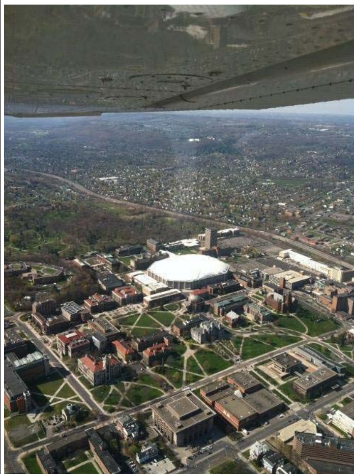
A rare view of the SU campus... from the air! (thanks, Lizzie Gilbert)