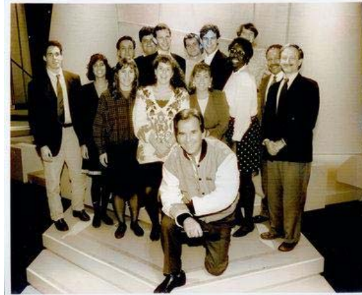
SU students remember Dick Clark's generosity as no act