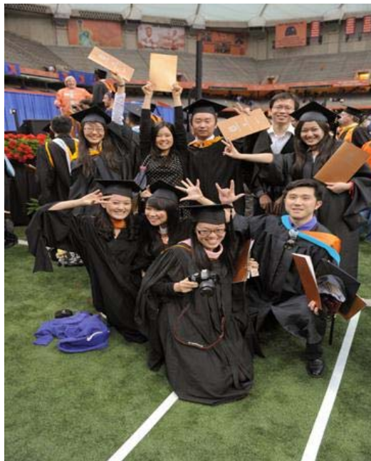
Sunday May 13th, 2012 9:30 A.M. Carrier Dome http://commencement.syr.edu/