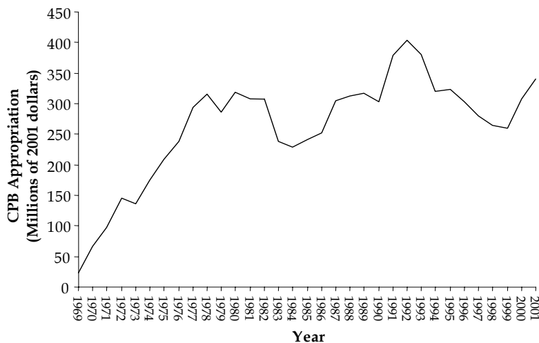
Figure 2. Corporation for Public Broadcasting Appropriations