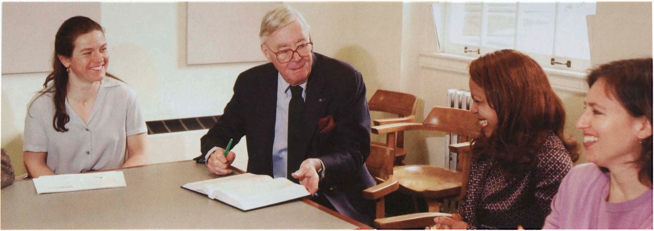
Senator Moynihan meets with students in the Maxwell School.

of gratitude, the senator remarked, “The thing about you lobbyists in D.C., whether you’re Democrats or Republicans, is you all wind up in the evening at the same saloon!” In unprompted notes later, several of the students called the experience the highlight of their SU academic careers.