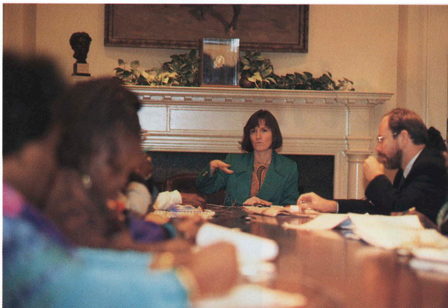
Varney begins each day with a White House staff meeting in the Roosevelt Room. The meeting includes announcements of upcoming events and a review of Clinton's schedule for the day.