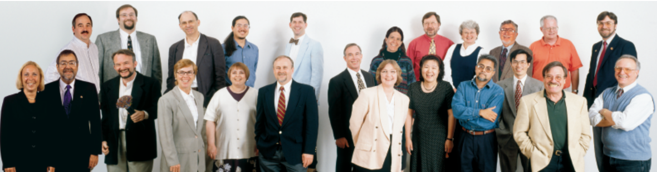
The assembly of faculty in 1999 captures the spirit of community in the school.