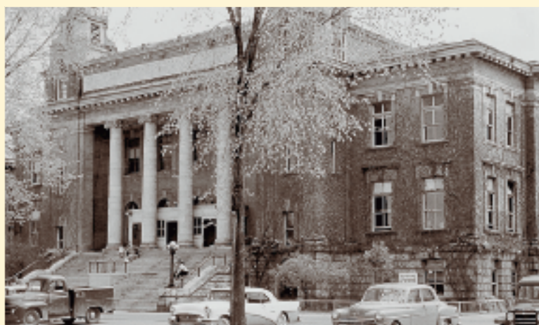
Library courses are offered at Carnegie Library in 1907. The library science program remains at Carnegie until 1969.

1 The program separates from the College of Liberal Arts, and the School of Library Science is established as the eighth degree-granting entity of the University.