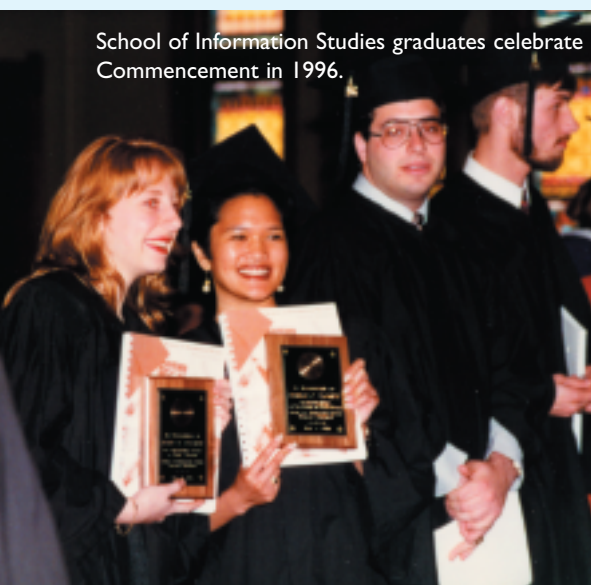
School of Information Studies graduates celebrate Commencement in 1996.