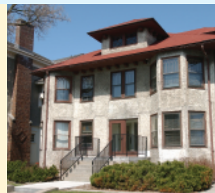
Euclid Avenue facility