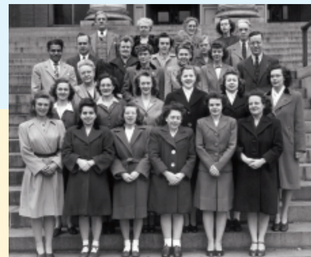
School of Library Science students in 1946.