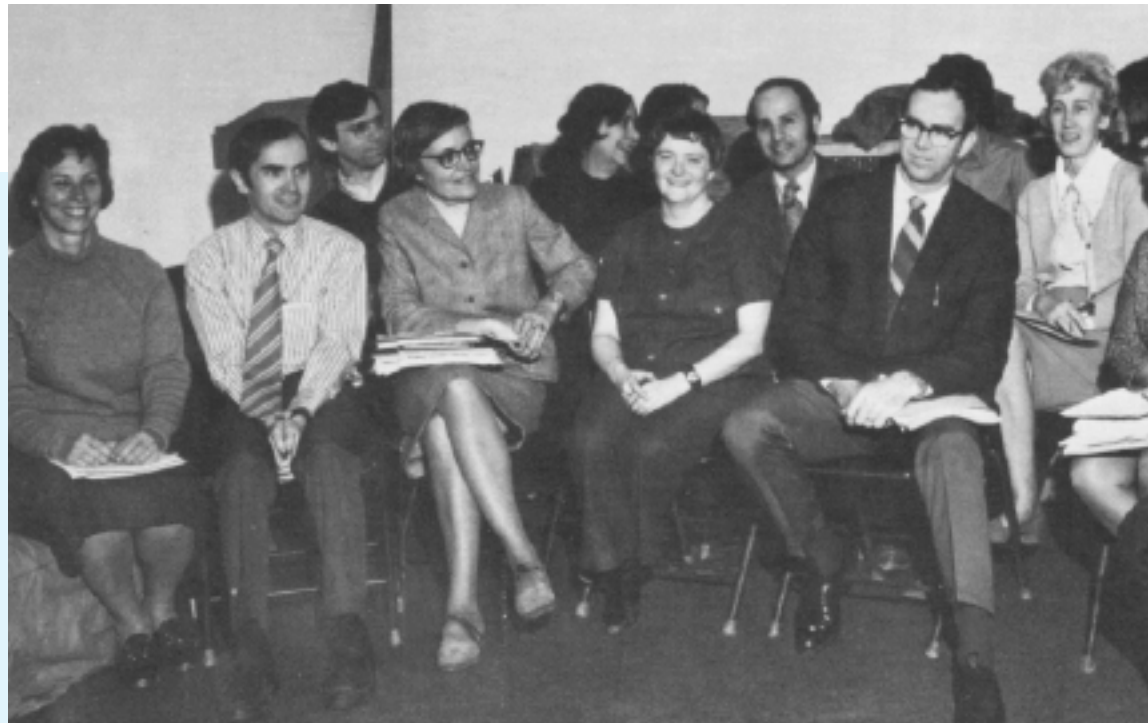
A School of Information Studies faculty meeting in 1971.