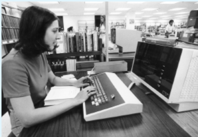
A library science student works on an early computer system in 1975 to catalog a book.