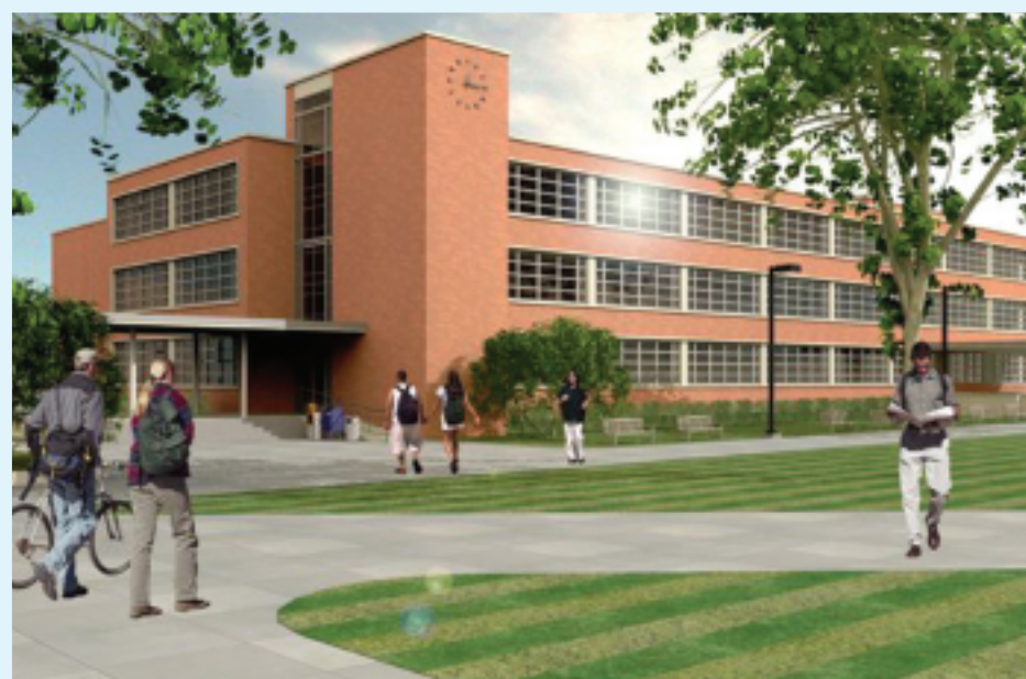
The School of Information Studies is established as a signature school for the University and relocates to the Quad, taking Hinds Hall as its new home.

Through SU’s Greenberg House in Washington, D.C., the School of Information Studies began offering the information resources management with a specialization in