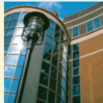
The Center for Science and Technology