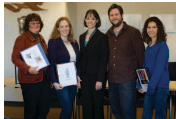
Students in IST 613 learn the key elements of developing a strategic plan for libraries by applying those lessons in community-based projects.

Nothing could make the students happier than to see their ideas implemented and