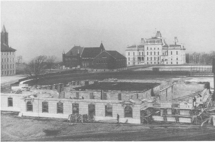
Fig. 5. Carnegie Building under construction.