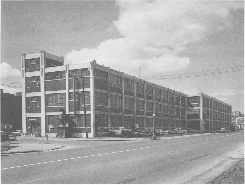
Fig. 3. Continental Can Building.

Congress classification in 1962, the same year in which Syracuse University Library became a member of the Association of Research Libraries; a quarter-million volumes sent to storage at Con Can in 1963 to relieve space crisis in Carnegie Building; beginning of pioneering library automation efforts in mid-1960s; opening of Bird Library in 1972; science collections housed in Carnegie Building (cohabiting with the Mathematics Department) and serving as hub of five science libraries; SULIRS, one of the first on-line catalogs in the country, goes public in 1979; opening of the Diane and Arthur Belfer Audio Laboratory and Archive in 1982, following two decades of record collecting; Hawkins Building replaces Con Can as remote storage site, now used primarily for archival materials, in same year; reconfiguration of Bird Library in 1991; completion of William Safire Seminar Room in 1994; rediscovery of Benjamin Tucker's Epitome in 1995.