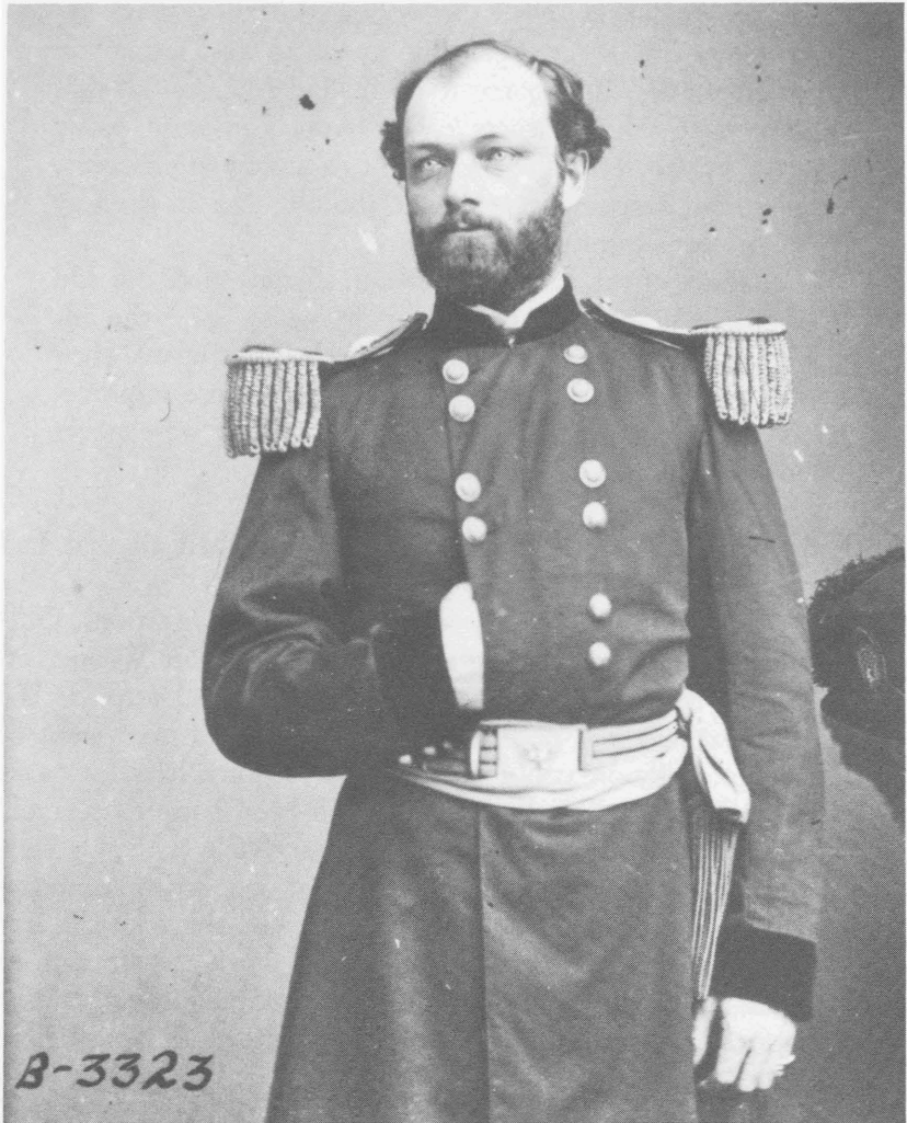
Brigadier-General Quincy A. Gillmore at the time of the Civil War.

nally contemplated. He reasoned that when the fleet reached the city, the Confederates would abandon their defensive works on the islands around Sumter. But Dahlgren had failed to act at the opportune moment: