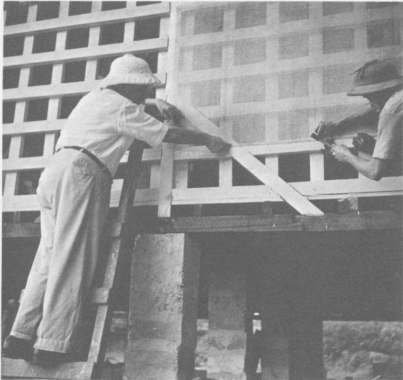
Albert Schweitzer giving a hand to fasten the mosquito netting.

that only Schweitzer with his authority could in fact keep the natives working. He showed understanding for their attitude towards work, recognizing that they were not lazy in our sense of the word, but merely accustomed (since nature in Lambaréné is usually provident) to put out effort only when required by circumstances, as, for instance: when the land no longer yielded the necessary subsistence and the whole village had to be moved; when money was needed to pay hospital bills, to buy medicine or perhaps a wife. Also, Schweitzer expressed a worry about the alcohol problem.