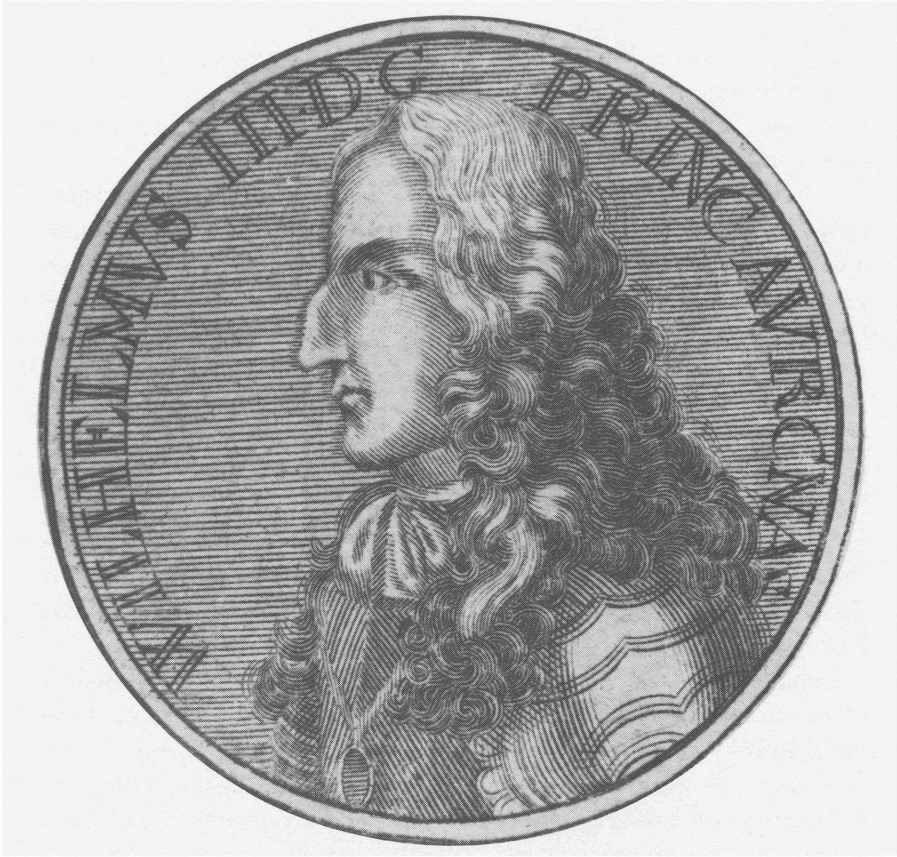
William III as portrayed on a medal struck to commemorate the occasion of his becoming a stadtholder in 1672. From The Life of William III. Late King of England, and Prince of Orange. (London, 1703).

wheeling Charles II payment of the Laureate's stipend had often been in arrears and secured only by rather dogged petitioning, Dryden had had, nevertheless, a basic annual income. Now, as age brought gradually increasing infirmity, Dryden faced the apprehension of want and turned energetically to measures to supply his needs. In agreeing to translate Virgil, Dryden was responding to an informal mandate. There had been a steady accumulation of public suggestion that he, the most highly acclaimed poet of his day, undertake to translate all of Virgil. In past years many translations had been published, but none had achieved a concurrence of critical approval. It was felt that a Virgil done by Dryden had a very real chance of accomplishing the perfect result.