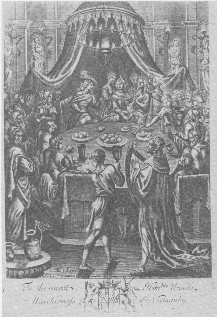
Aeneas receives a kind entertainment from Queen Dido. Book I. (Plate unaltered)