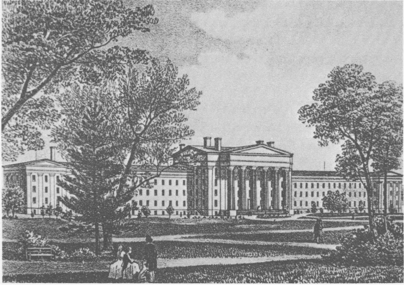
New York State Lunatic Asylum, Utica, New York, from History of Oneida County, New York (Philadelphia, 1878).