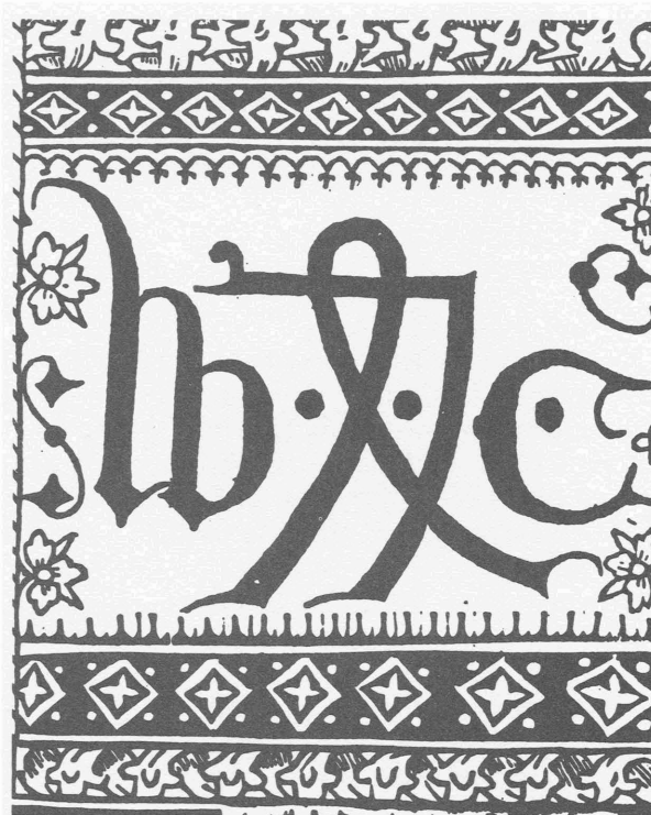
Caxton's famous printer's mark from the Boke of Eneydos, translated from French, printed, and published by William Caxton about 1490.