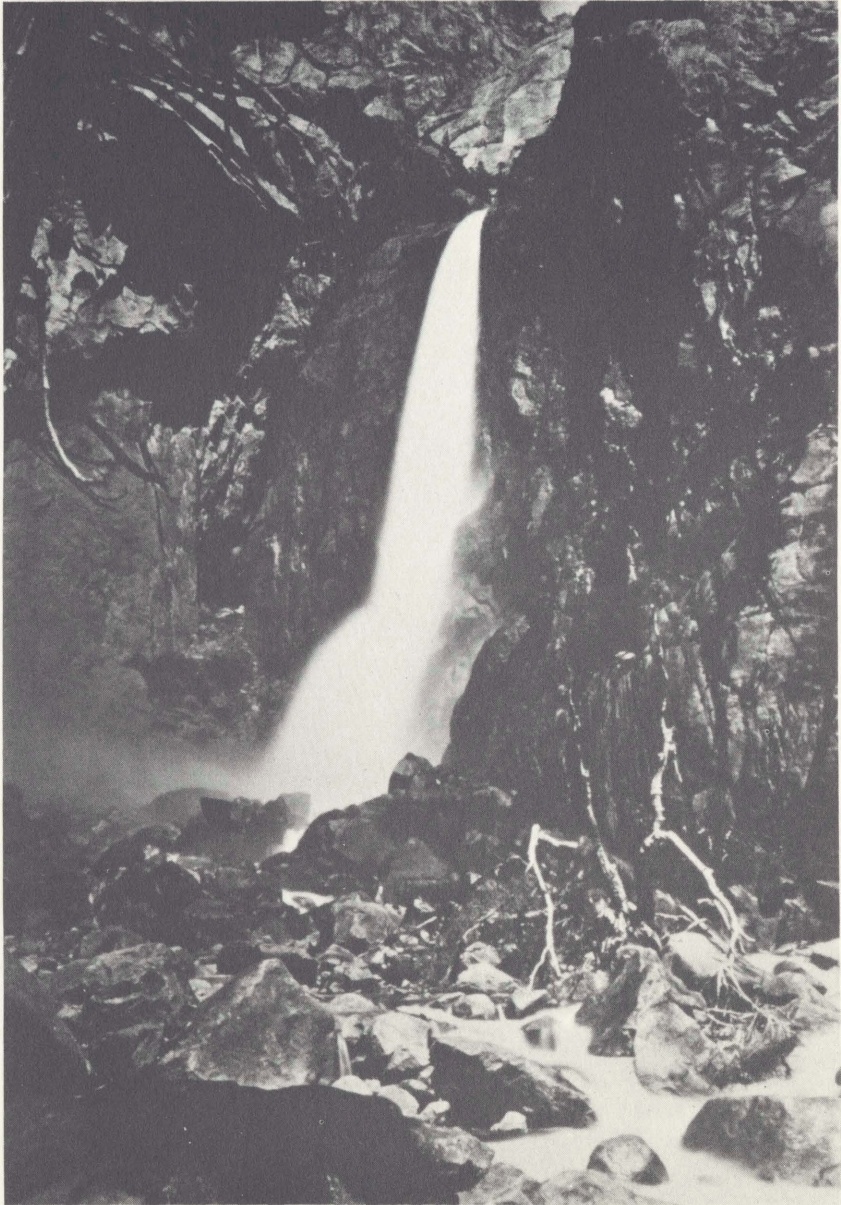
THE LOWER YOSEMITE FALLS

From a Carleton E. Watkins album at Syracuse University