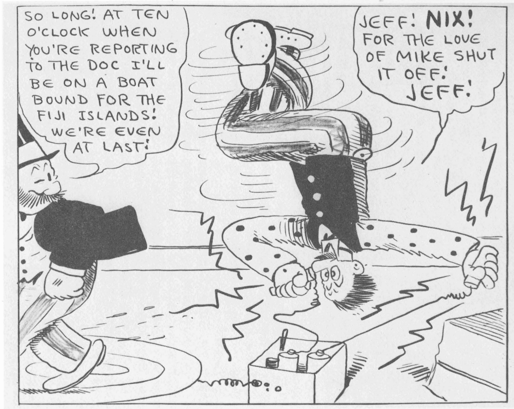
Mutt and Jeff in a lively drawing from an early strip, about 1915. The original drawings in the Bud Fisher cartoon collection at Syracuse University seldom indicate the year in which they were drawn, showing only the day and month. This original drawing, part of a strip, is size 6¾" x 8".