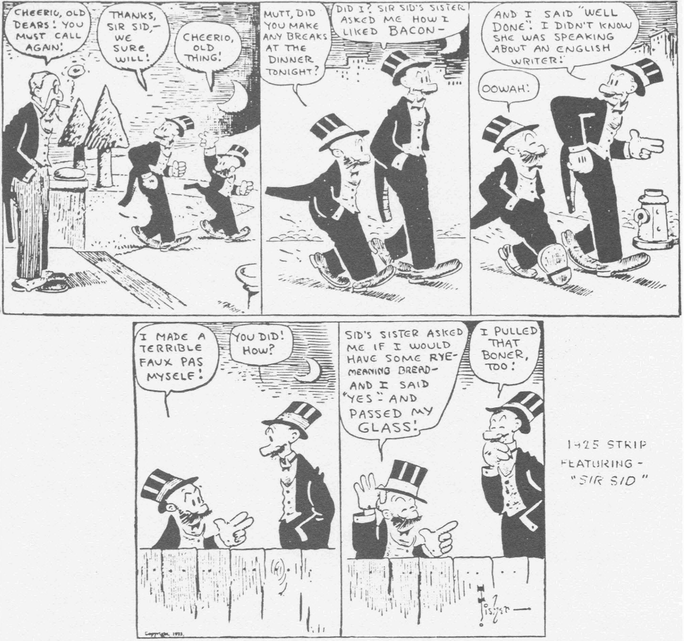
“Mutt and Jeff” as published in 1925. (Strip has been arranged to fit this page.)