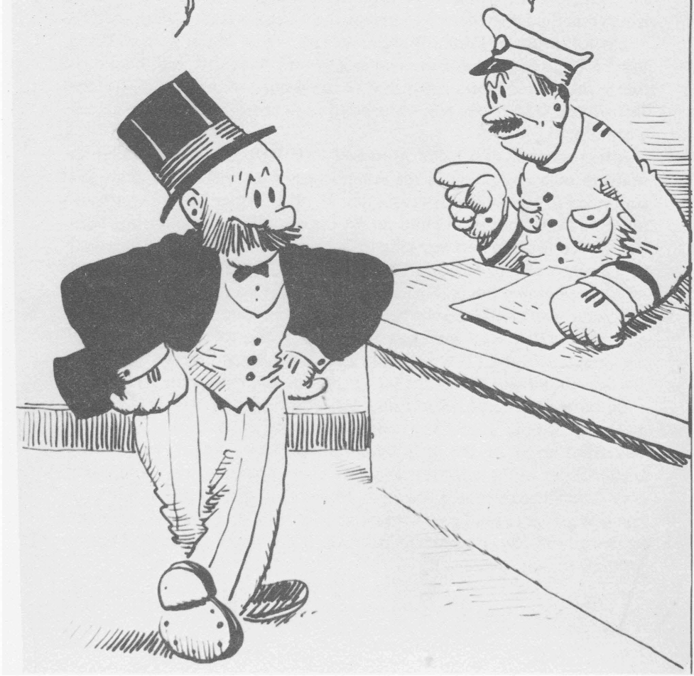
Jeff at a World War I recruiting office. From the original strip, this cartoon is size 5¼" x 8".

VERY WELL! SIGN HERE AND THEN I'LL TAKE YOU IN FOR A PHYSICAL AND EYE EXAMINATION