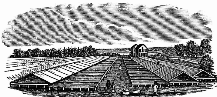
A field of salt vats in Salina. From an engraving in Historical Collections of the State of New York , by John W. Barber and Henry Howe. 1842