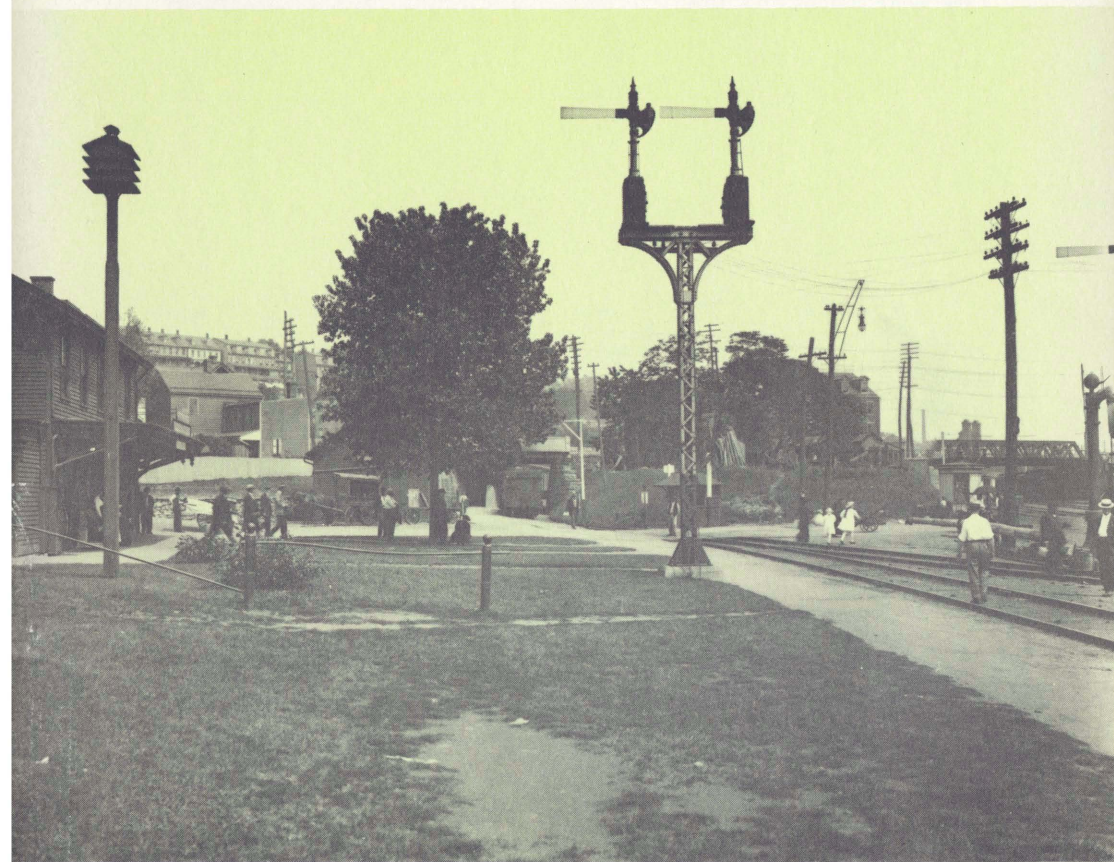
The old Phillipsburg, New Jersey passenger station on the Delaware, Lackawanna and Western Railroad. 1913