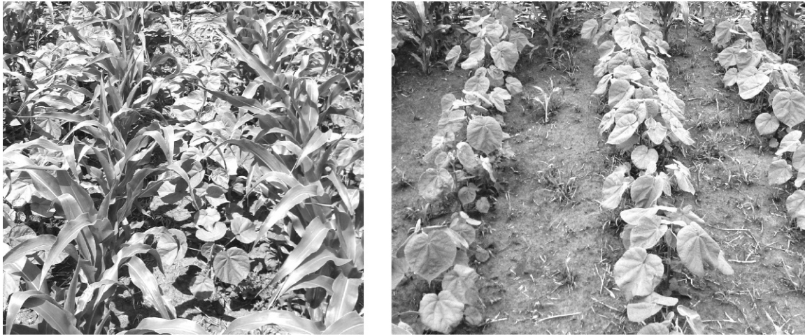
Figure 1. Photo of velvetleaf growing with and without corn at time of tissue collection.

faster early in development but that respond relatively less dramatically to competition later in the season (Weinig 2000). However, no molecular studies have yet been done to identify the mechanisms that might bring about these changes in growth and development. In this report, we compare the transcriptome of velvetleaf grown in monoculture to the transcriptome of velvetleaf in direct competition with corn with the intent of identifying differential expression of numerous well-characterized genes to determine which signal transduction and physiological pathways are altered by competition with corn.