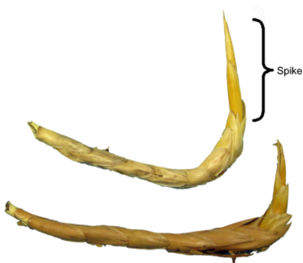
Fig. 3 Activated adventitious meristems on long rhizomes. These meristems were collected from the core samples, but their origins were axillary buds on an active proaxis peripheral to the area of the core sample. Note the overlapping, stiff, scale-like leaves that form a spike that emerges above the soil surface during autumn.

vigorous growth during spring, thus resulting in abundant biomass production by the end of the growing season. On the other hand, autumn precipitation during 2007 and spring precipitation during 2008 were slightly lower than the long-term average.