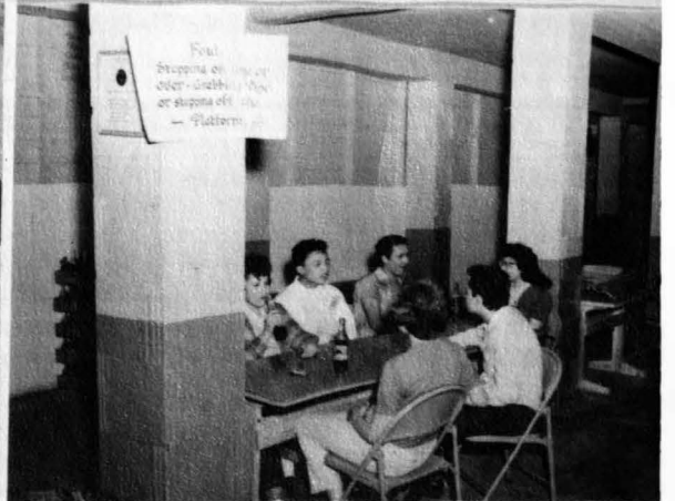
Mixed groups of adolescents in class and free-time activity at Oglala Community School, Pine Ridge