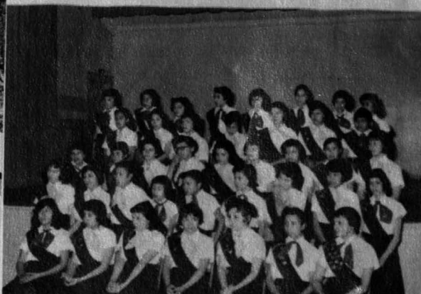
Adolescent girls in recreational activities at Holy Rosary Mission and Wahpeton Indian Schools