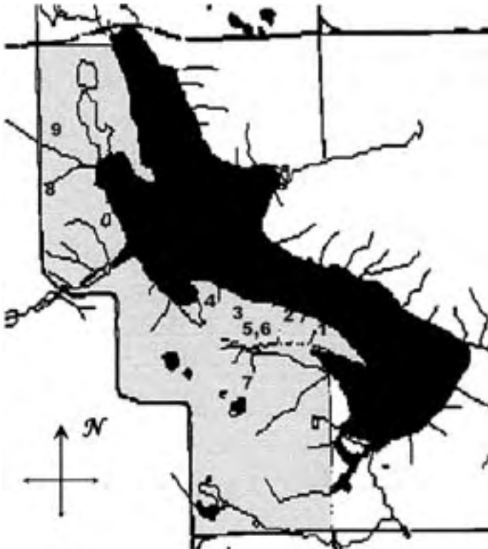
Figure 1. GIS-generated map of Oak Lake Field Station, Brookings Co., SD, with locations of numbered sites shown.

Sampling was conducted at the Oak Lake Field Station, Brookings Co., South Dakota during the summers of 2003 and 2004. The Oak Lake Field Station (OLFS) is a 230 ha research facility owned and operated by South Dakota State University (Troelstrup 2005) (Fig. 1). The OLFS is situated in a prairie pothole and is a prime study area due to a wide variety of habitats, which optimizes the collection of different types of spiders.