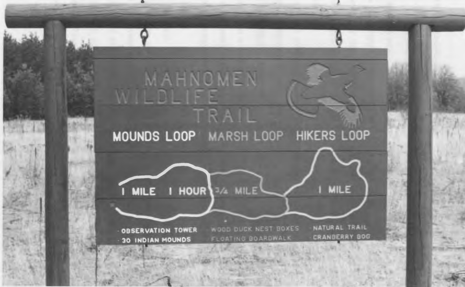
Fig. 1. Trailhead map of Mahnomen Wildlife Trail, Sherburne National Wildlife Refuge, Minnesota .