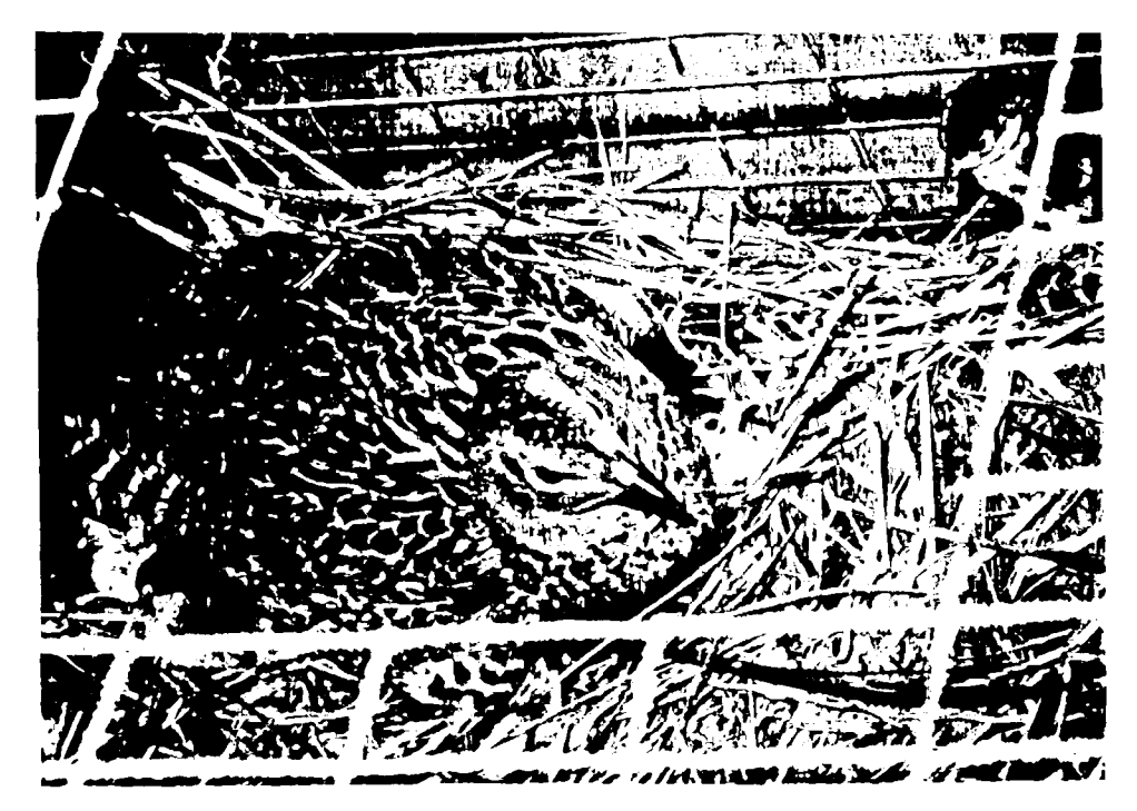
Fig. 4. Many hens accepted and brooded introduced chicks.