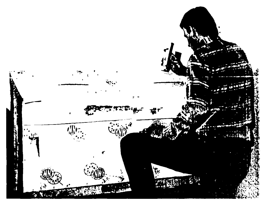
Fig. 3. Hens were observed during adoption experiments with a red-lens flashlight.