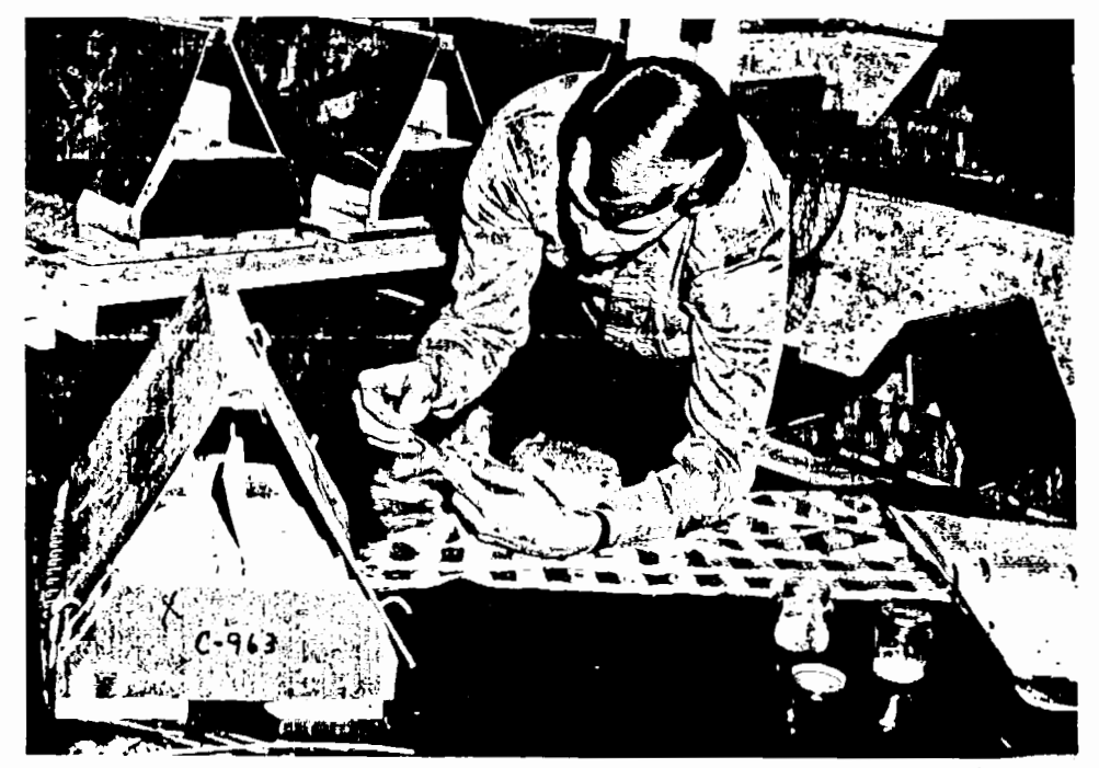
Fig. 1. Individual hen cages and method of administering capsules.