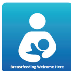
Figure 4. Breastfeeding-Friendly Business Initiative Window Cling

At a pledge signing event, representatives from the three major industries represented on the coalition signed the breastfeeding-friendly pledge (see Figure 5). Five additional businesses that are community opinion leaders also signed the pledge at this event. Then, students canvassed local businesses and had a 73.4% success rate. Businesses could also take the pledge online. As a result of the initiative, over 100 businesses are now ‘breastfeeding-friendly.’ The SDDOH has begun implementing a similar initiative in other communities across the state.