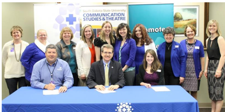
Figure 5. Breastfeeding-Friendly Business Initiative Pledge Signing Event.