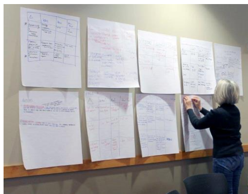
Figure 3. Prioritized Approaches from Each Table Discussion at the Public Deliberation Event

Participants prioritized three specific business-related actions: 1) developing and disseminating tools for mothers and employees, 2) helping businesses create policy regarding