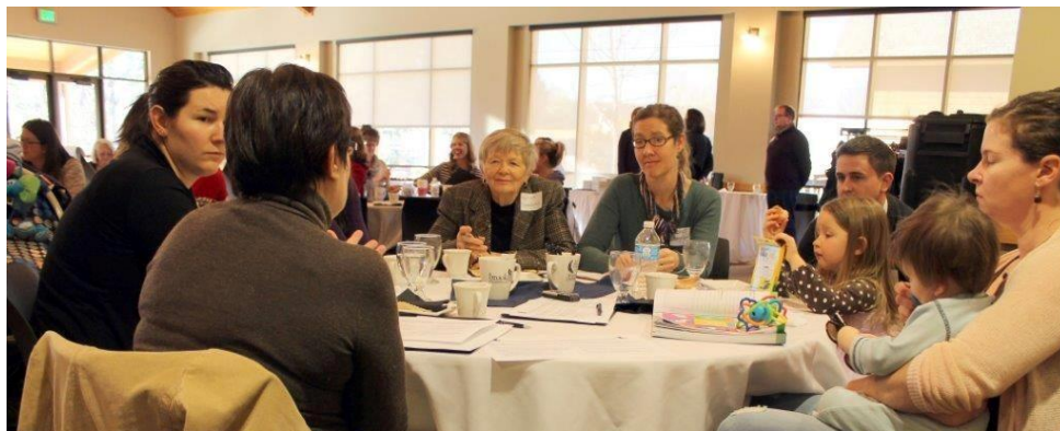
Figure 2. Community Members Discuss Breastfeeding at the Public Deliberation Event.

Understanding the issue. During the event, facilitators led participants in dynamic, interactive conversations at each table. Participants spent considerable time and energy unpacking the problem itself and considering different specific approaches to it (see Figure 2). The participants used the public deliberation guide—based on formative research in the community—to unpack the problem, even challenging or refining results from formative research, similar to the process of member-checking [30]. The descriptions in the guide generally resonated with participants’ experiences and knowledge. In particular, they felt that the problem of a lack of breastfeeding support boiled down to problems with dissemination of information about breastfeeding challenges and supports. They specifically noted that businesses are unaware of the benefits of breastfeeding; employers, friends, and families do not understand the challenges of breastfeeding; and there is limited public awareness of general breastfeeding benefits.