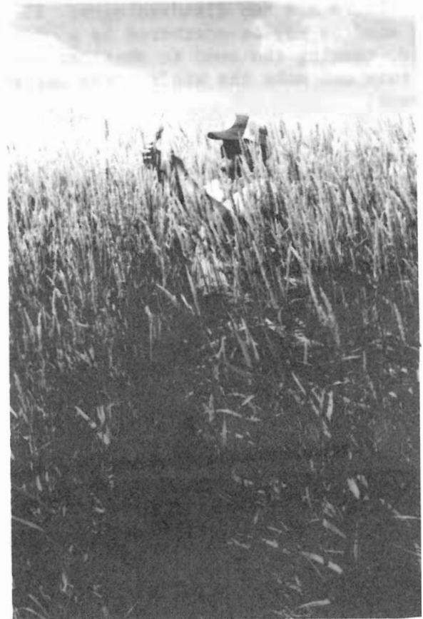
Fig 3. Harvest when most of seed is in hard-dough stage; you will have to inspect the field daily to find best time.

Direct combining requires less time and labor; however, greater seed loss may occur. Direct combining begins when