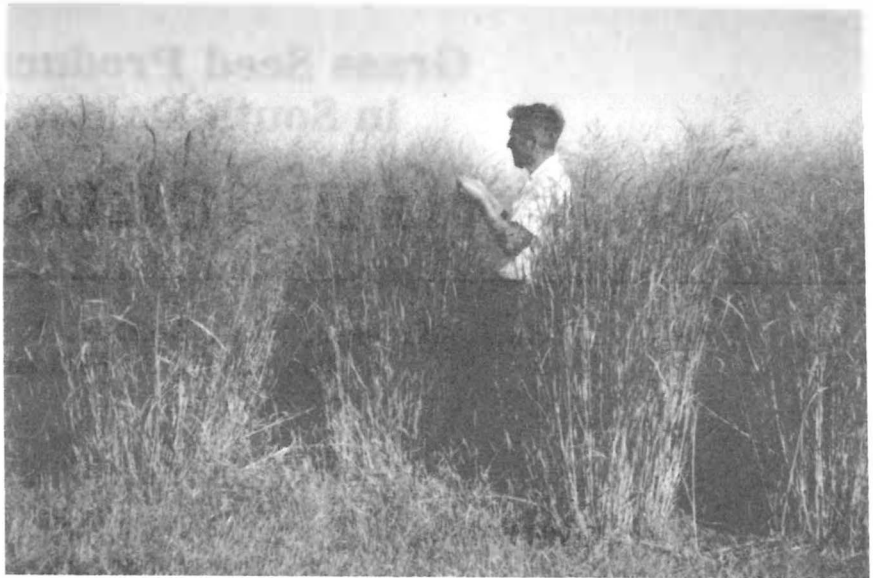
Fig 1. Grass that will be combined and marketed will give higher yields when planted in rows.

criterion in determining row spacing. Irrigation may allow 9- to 18-inch row spacing, depending upon the grass species.