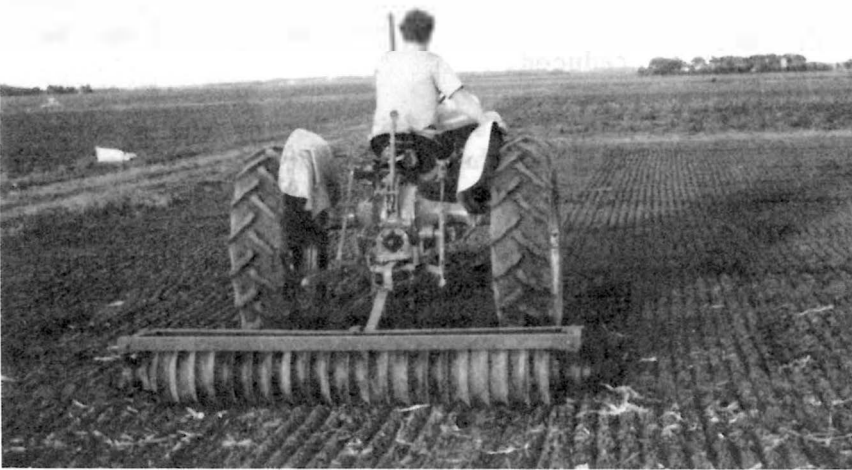
Fig 2. Grass seed is small; a firm seedbed is essential for establishment. Match row spacing to your existing equipment.

equipped with packer wheels that follow the furrow openers. Shoe-type corn planters may be used if they are equipped with modified seed plates for small seeds, or use a grain drill with drill cups appropriately plugged for proper row spacing.