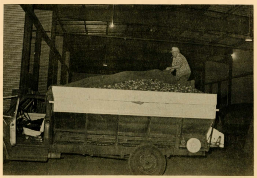
Since light turns tubers green, storage must be in total darkness. A high relative humidity allows the tubers to heal any harvesting injuries, and carefully regulated temperatures keep them from sprouting.

maximum yields. In general, heavy yielding or poor setting varieties should be spaced closer to reduce the yield of oversized tubers.