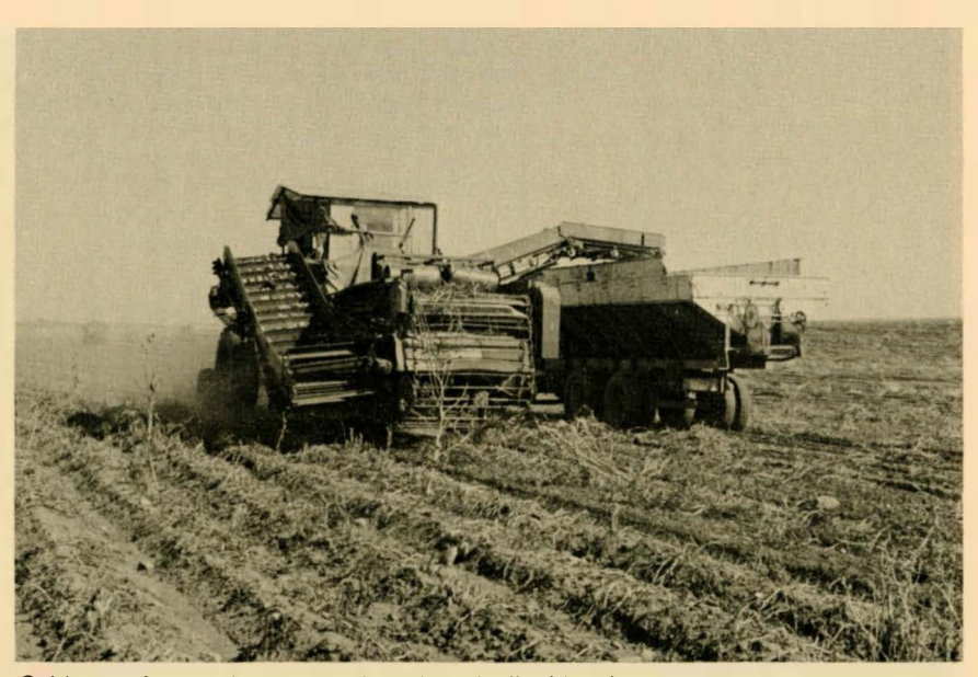
Cultivate often, to destroy weeds and gradually ridge the rows to protect the tubers. The best potato fields are on sandy loam, and the grower must make every effort to prevent serious soil erosion.

surface of the seed pieces and should be used with an applicator specifically designed for this purpose.