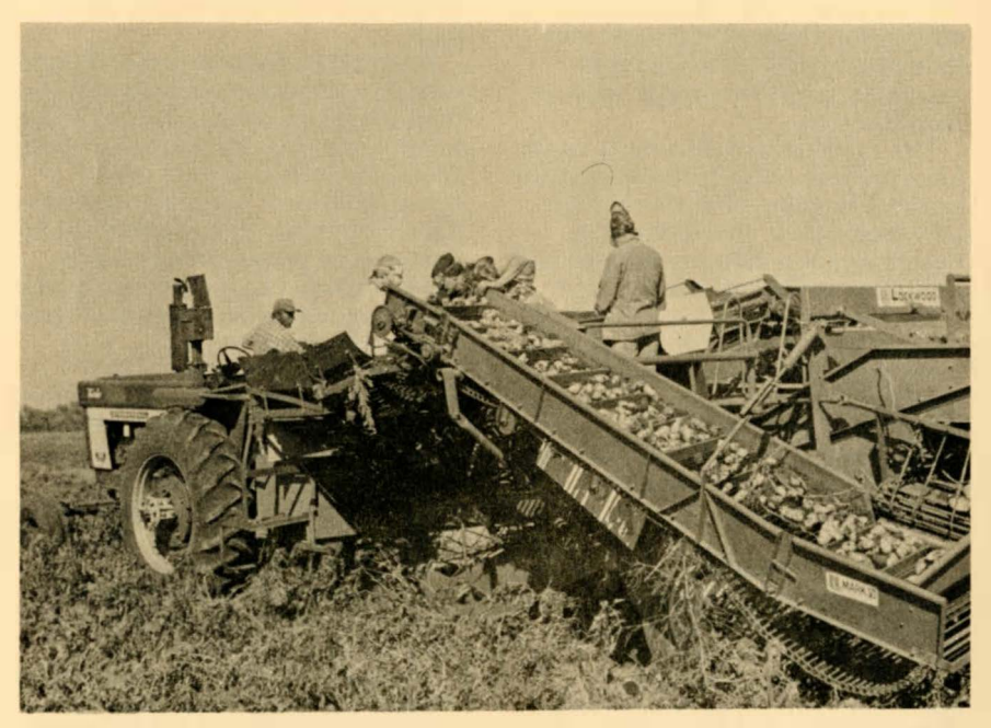
Technology has moved faster in the potato industry than in most other crop areas. While back breaking chores are not so common any more, certain times of the year are still labor intensive. This harvesting crew gets a rest because vines were still a little green.

Nitrogen fertilizer recommendations are based on the amount of