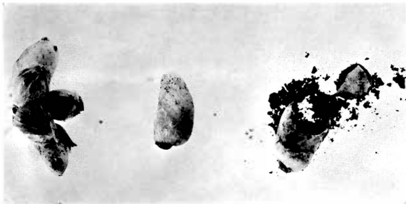
Fig. 2—Each “smut kernel” is a mass of spores. This mass is covered by a gray membrane, which is crushed when the grain is combined or harvested.

tive overwintering of smut in the soil or on plant refuse. Smutted heads develop only on plants grown from seed infected during germination.