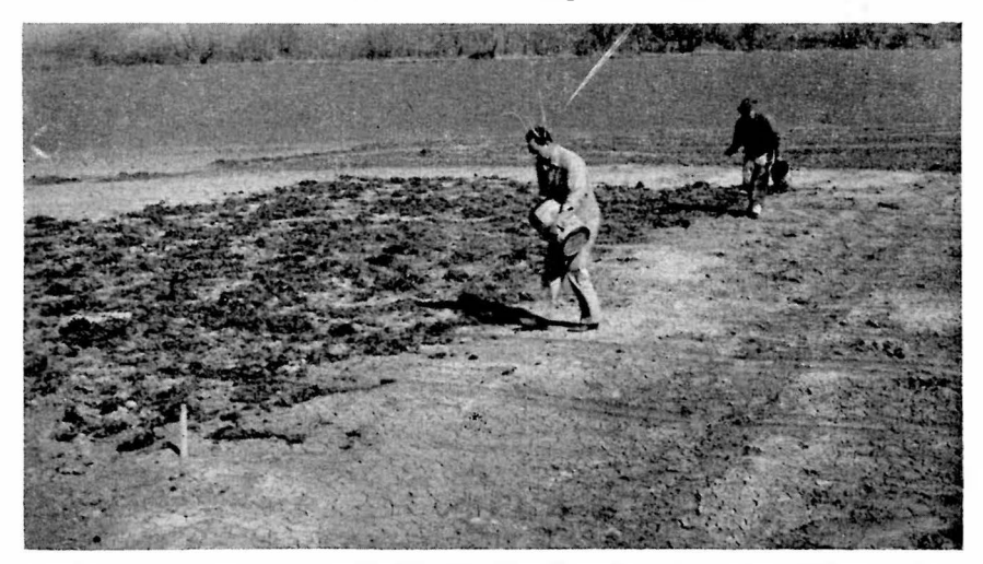
Fig. 4. Right: Showing the effects of applying sodium chlorate to a small area which was infested with perennial weeds. Left: Applying the chemical to an untreated area