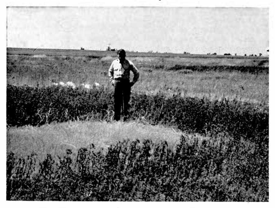
Fig. 5. Fifteen pounds of borax per square rod will eliminate leafy spurge

obtained by applying 40 pounds per acre after the area has been plowed shallowly. The cost of the chemical is rather high, making it impractical for use on large areas.