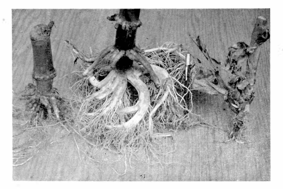
Fig. 2. Various degrees of root injury in corn following excessive use of 2,4-D

Sorghum can be treated as outlined for corn. However, sorghum should not be treated between the five-leaf and nine- or ten-leaf stage of growth as serious root injury, a decrease in the number of seeds and a yield reduction may follow. Likewise, the application of 2,4-D dur-