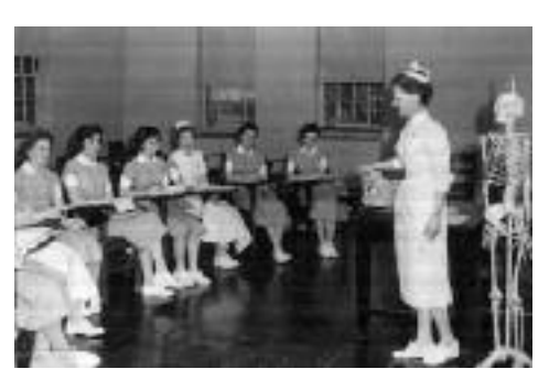
An early nursing class.