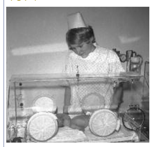
A student views newborns at the Brookings Hospital.