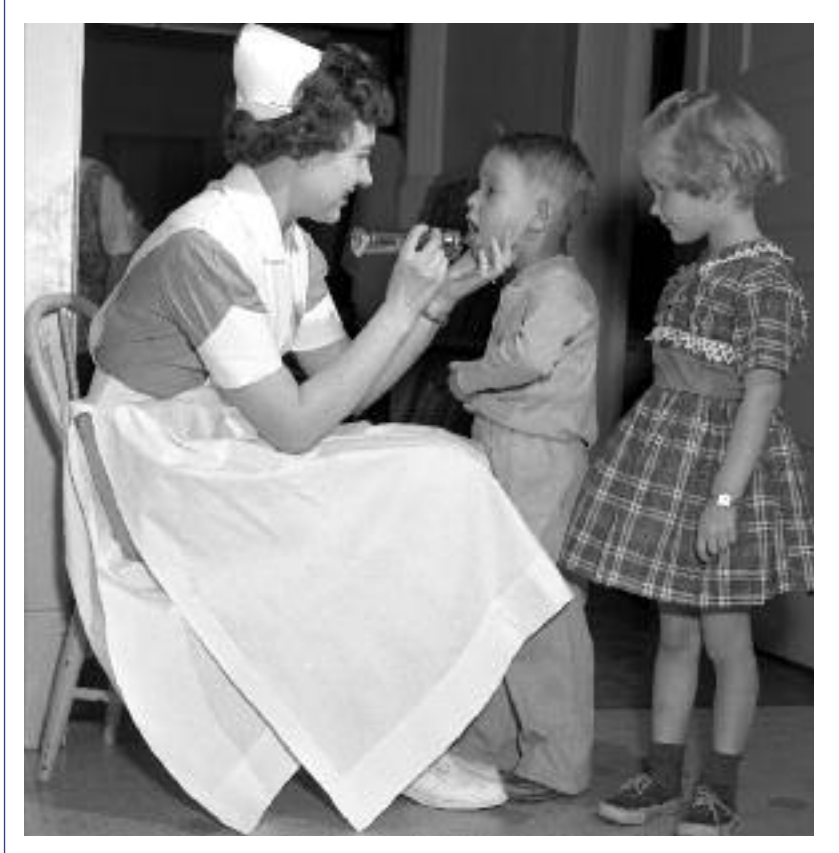
State had a nursery school and the college provided various clinical activities.