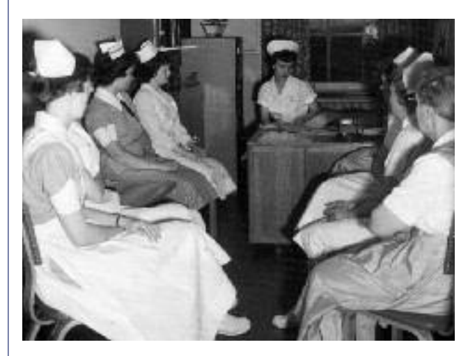
Nursing care planning conference.

Courses in arts and science were initiated for the completion of a baccalaureate degree in nursing for those who were RNs from diploma programs.