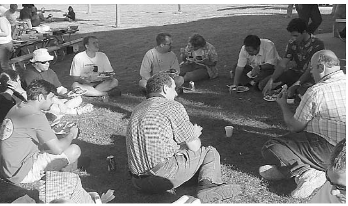
Faculty and students share some chicken and a place on the park grass.