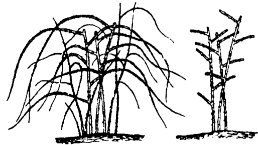
Figure 2. Purple raspberries before and after dormant pruning.