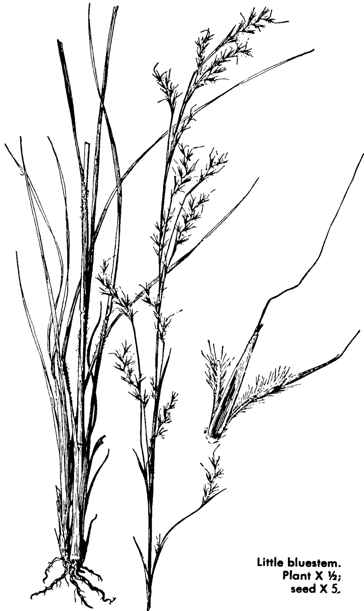
Little bluestem. Plant X 1/2; seed X 5.

Pawnee is a variety developed from selections obtained in Pawnee County, southern Nebraska. Champ is a composite developed from four strains obtained on sandy soils in Cherry and Holt counties of northern Nebraska, Ames, Iowa, and Pawnee County, Nebraska. Pawnee should be adapted to the southeastern quarter of South Dakota; whereas Champ may be more widely adapted. Seed from native stands less than 200 miles north or 300 miles south of the area to be seeded is recommended.