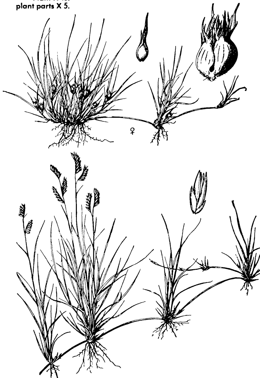
Buffalograss. Plant X 1/2. plant parts X 5.

The authors have drawn freely from the USDA Yearbook "Grasses" and the SCS Agriculture Handbook No. 339 "Grasses and Legumes for Soil Conservation in the Pacific Northwest and Great Basin States." The line drawings were taken from SCS Agriculture Handbook 339 and SCS-TP-151, "Key to Perennial Grasses." All production data, however, were obtained in South Dakota, except where otherwise specified.