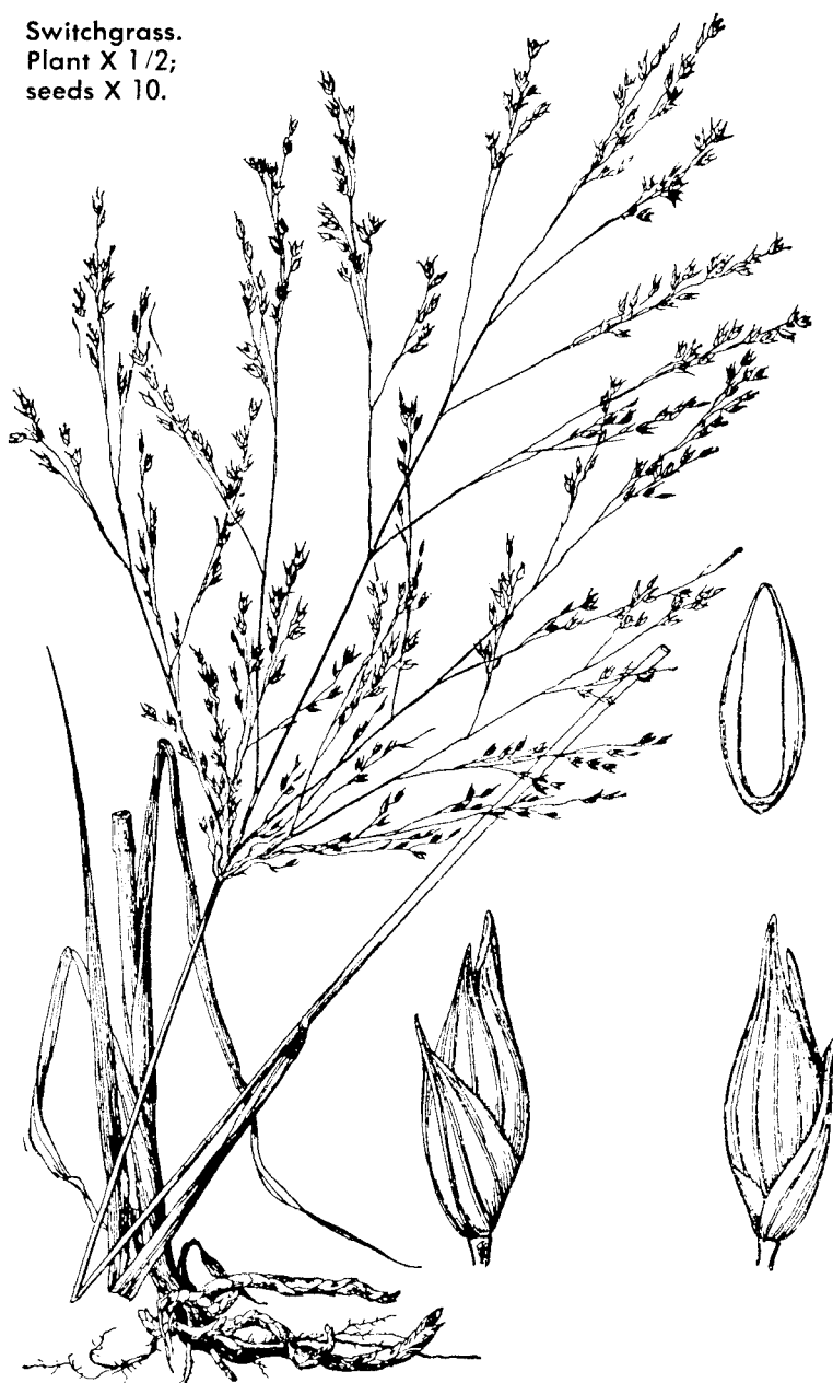
Switchgrass. Plant X 1/2; seeds X 10.