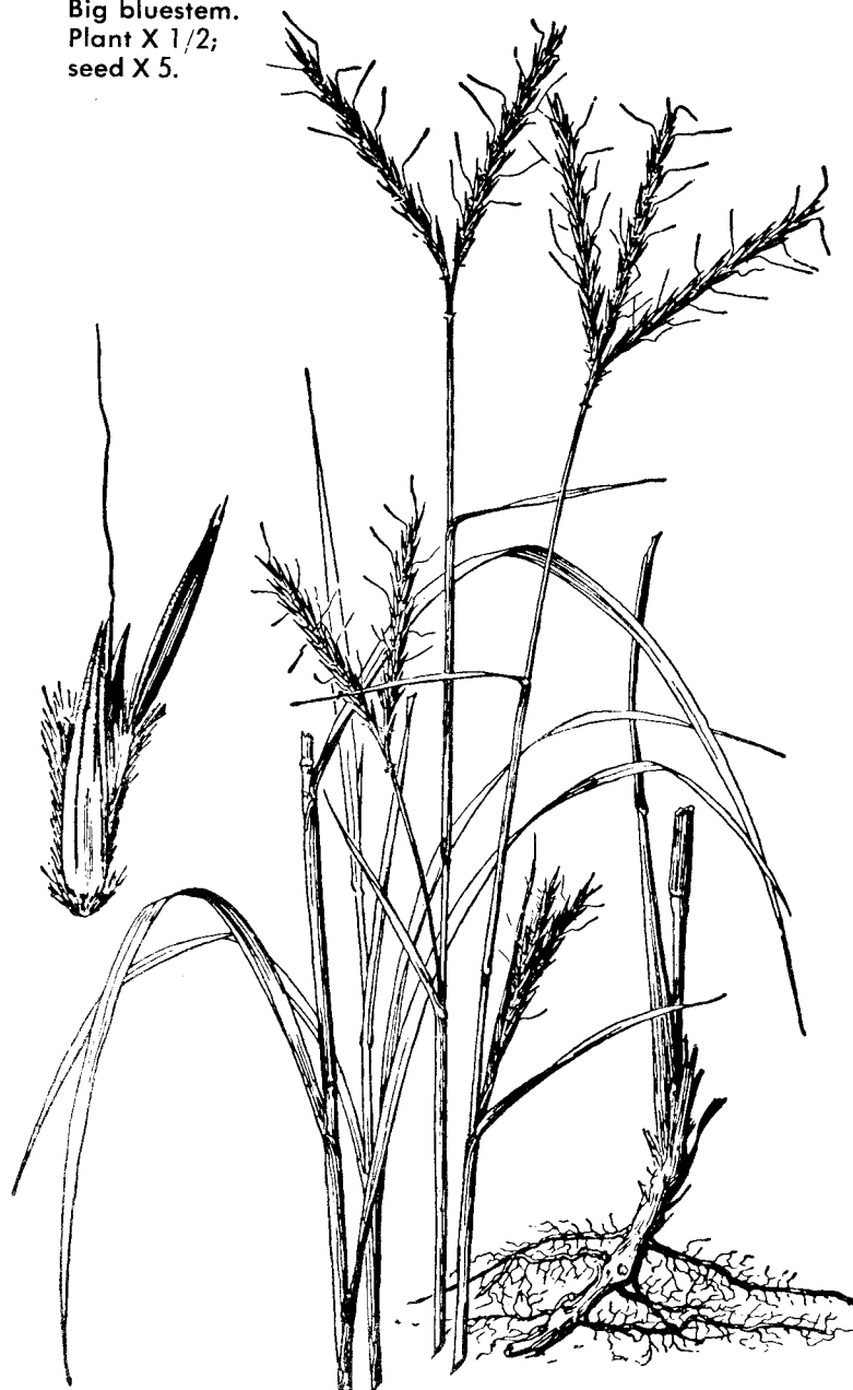
Big bluestem. Plant X 1/2; seed X 5.

Nebraska 28 was selected at the Nebraska Agricultural Experiment Station in cooperation with ARS and SCS from a native collection from Holt County, NE, and released in 1949. This variety is an early maturing strain, representative of sand hill types. Plants are fine stemmed, moderate in height, and leafy. The variety is well