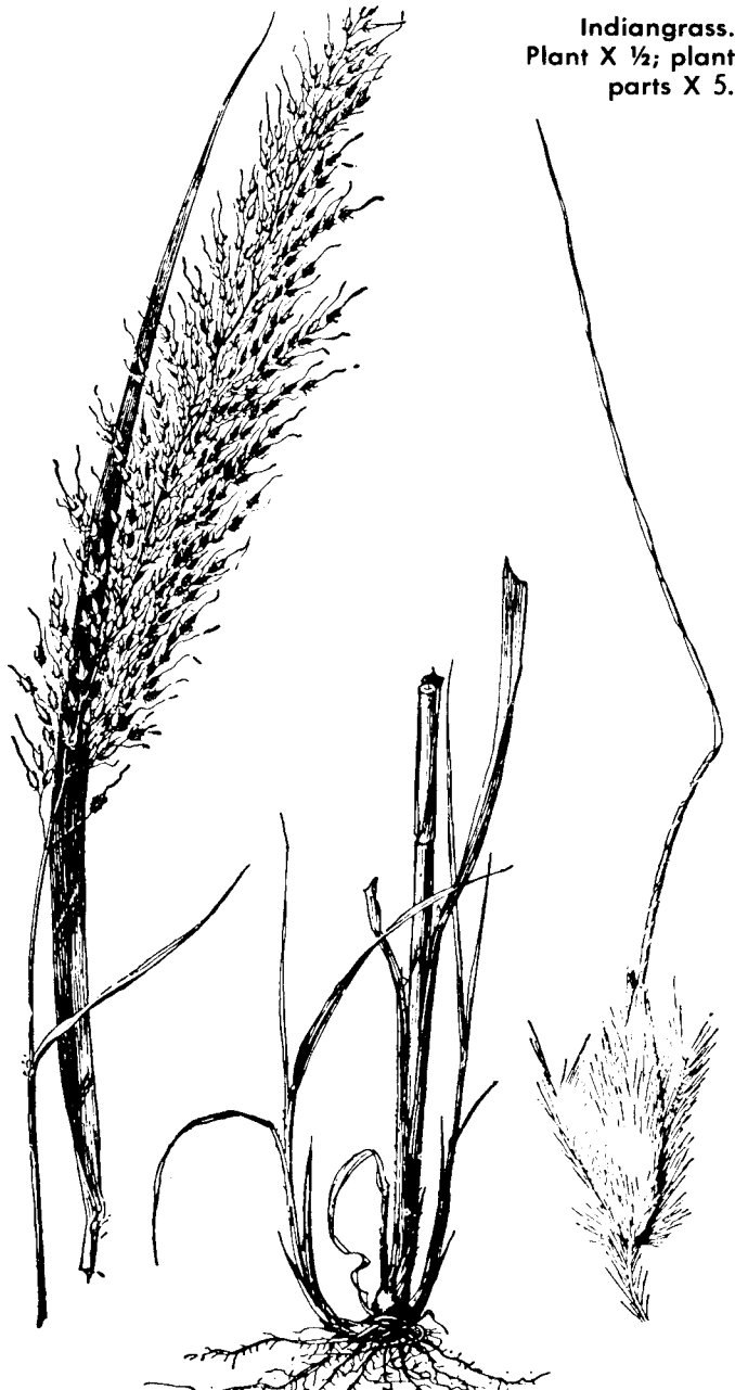
Indiangrass. Plant X 1/2; plant parts X 5.