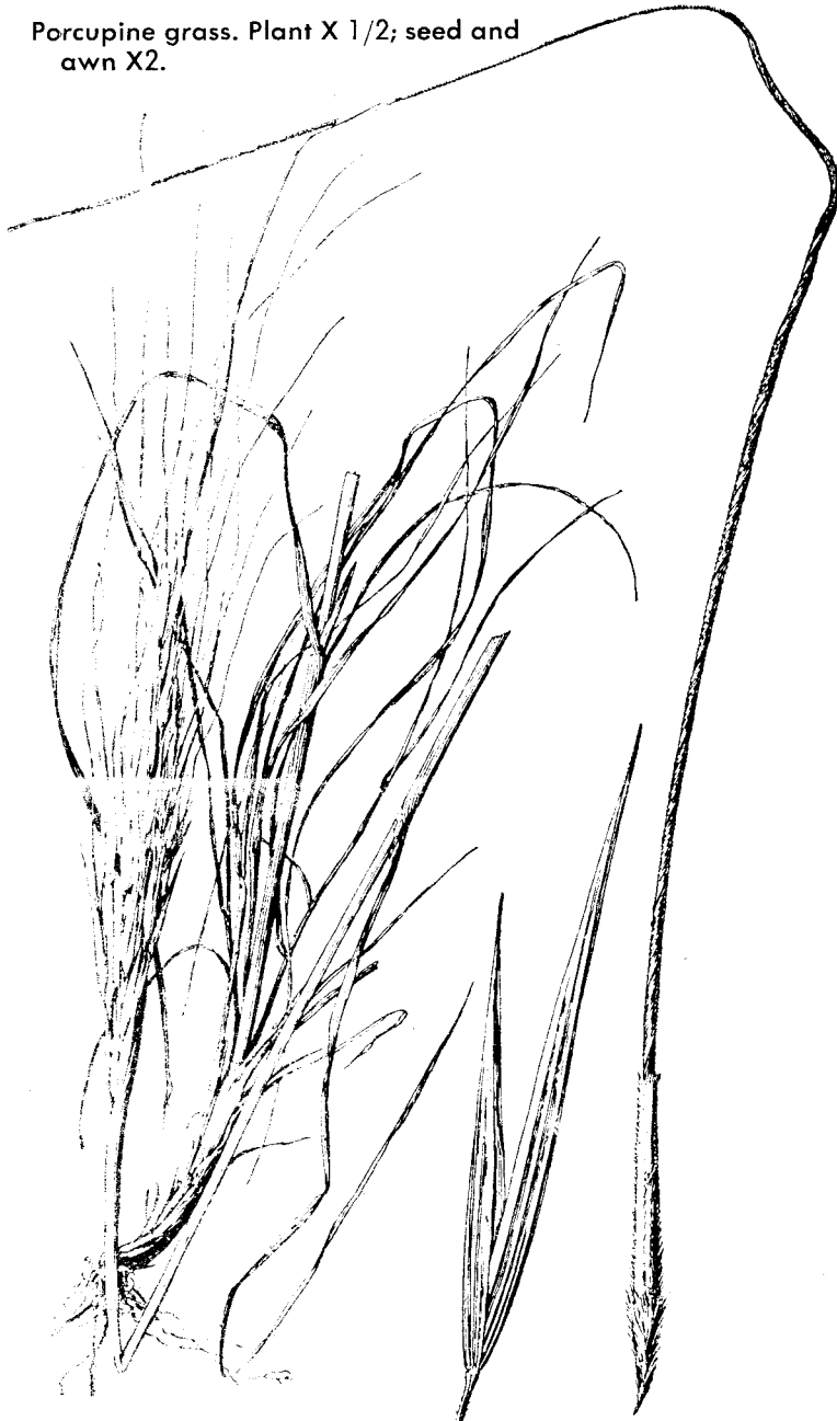
Porcupine grass. Plant X 1/2; seed and awn X2.

Green stipagrass is a variety of green needlegrass selected in North Dakota and released in 1946. It produced 4- or 5-year average yields of about 1.4 tons per acre at Eureka and Cottonwood. Lodorm is the variety of