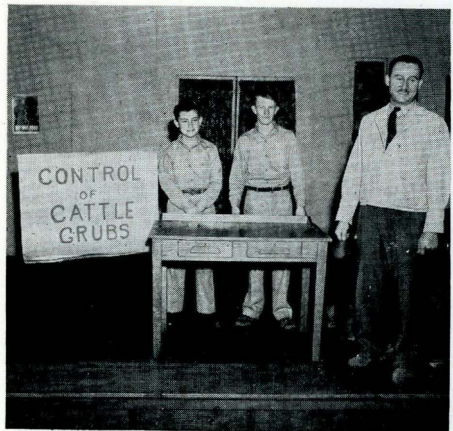
Team Members Are Introduced

The introduction of your demonstration is your "interest getter;" so make it clever, original and not too long. Give the main reasons for choosing the topic and tell why it is worthwhile and important—economy,