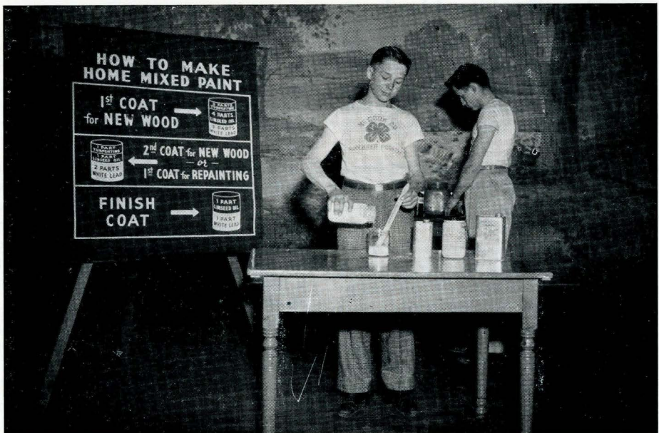
Posters Should Relate to Work, Be Brief and Easy to Read

4. Be well groomed and appropriately dressed for the demonstration you are giving. Uniform dress is desirable, dressing alike makes the team appear as a unit. Girls' hem lines that are the same add to appearance. Clothes should be neat, clean, well pressed and attractive. Food demonstrators should wear nets or ribbons to keep their hair in place.