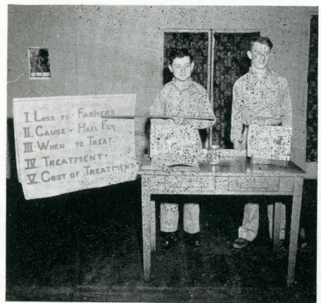
Review Key Points in Summary