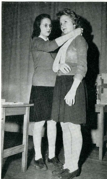
"Show by Doing"

Use the type or kind of equipment which fits the demonstration to be presented. Be sure to have enough to do your work well yet avoid the disorder which comes from having too much.