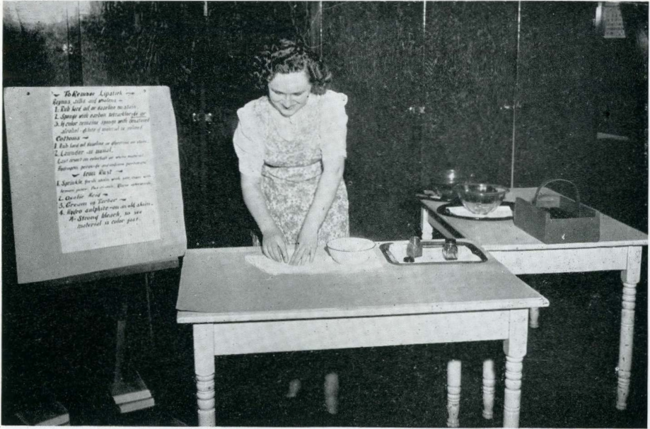
Keep Working Space Clear So Audience Can See Each Step