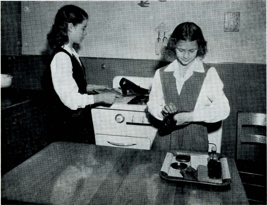
Well-grouped Equipment Makes Demonstrating Easy