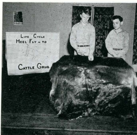
Posters Lend Emphasis to Work

When no more questions are asked, thank the audience and invite them to inspect or sample the finished product.