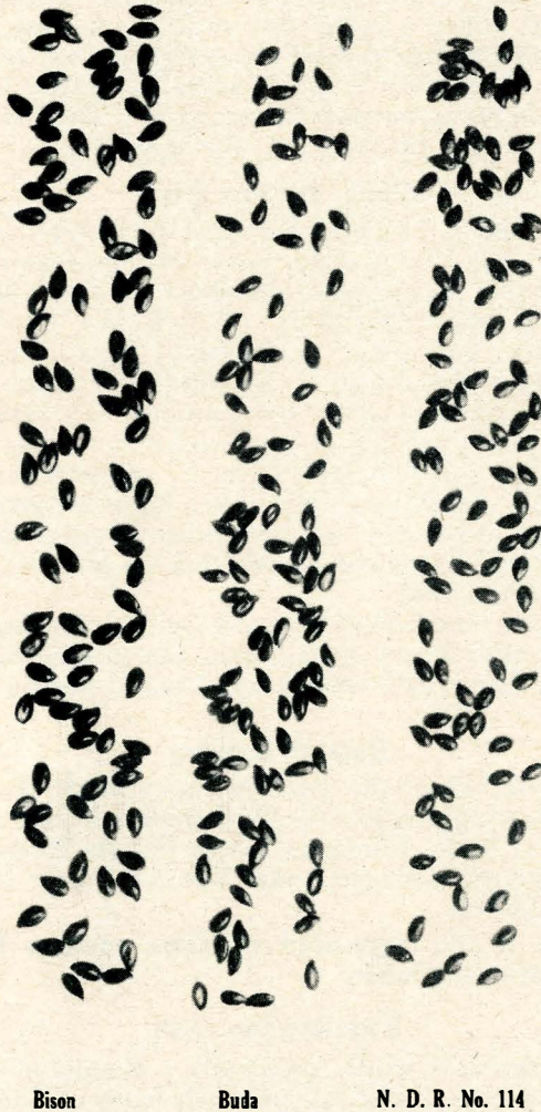
Fig. 1. Seeds of Bison Variety are Approximately One-Third Larger Than Buda and North Dakota Resistant No. 114. One-Third More Seed per Acre of Bison or Other Large Seeded Variety Must Be Sown To Obtain Desired Stand of Plants

Bison or Buda. This seed plot should be planted on well-worked, old, wilt-producing land, so if there chances to be any admixture of non-resistant flax in the seed, the soil of the seed plot may destroy the non-resistant plants.