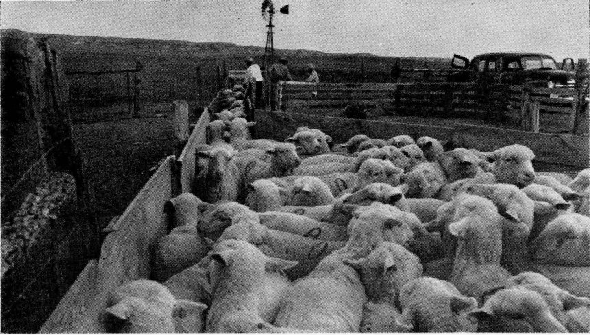
A representative group of the ewes that were used in the grazing level trials at Antelope Range Field Station. These ewes are being weighed and fecal specimens collected.

requirements are not met through the soil or forage.