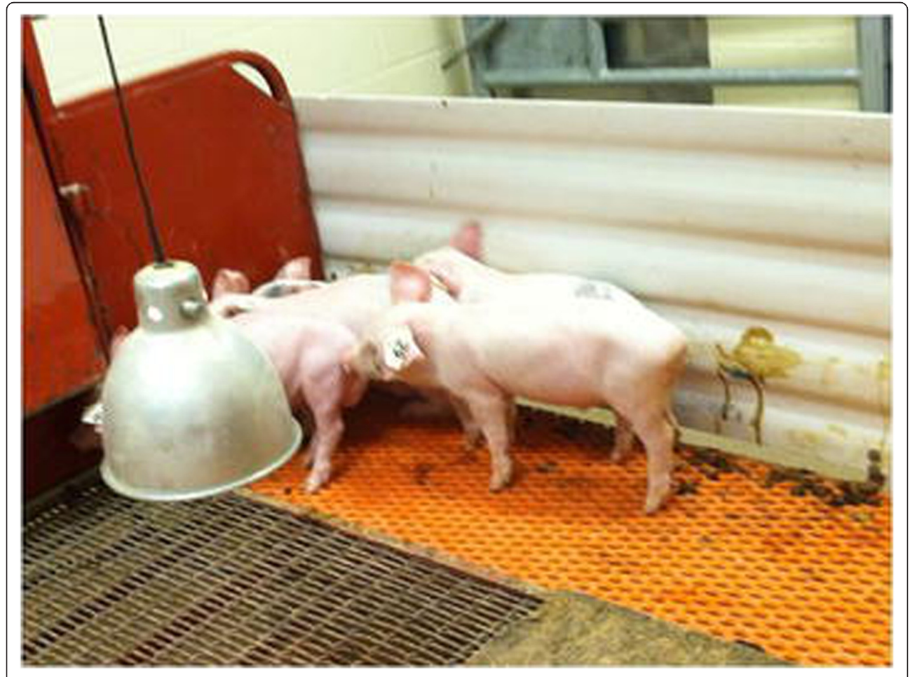
Figure 1 PED in treatment group. Depicted in this figure are clinically affected piglets from the Treatment group on day 6 post-ingestion of PEDV-contaminated feed. Piglets demonstrated loss of condition, rough hair coats, along with clinical signs of PED (diarrhea and vomiting). Evidence of diarrhea is visible on the pen wall behind the pigs. Prior to necropsy, rectal swabs from all 5 piglets were PEDV-positive as detected by PCR.