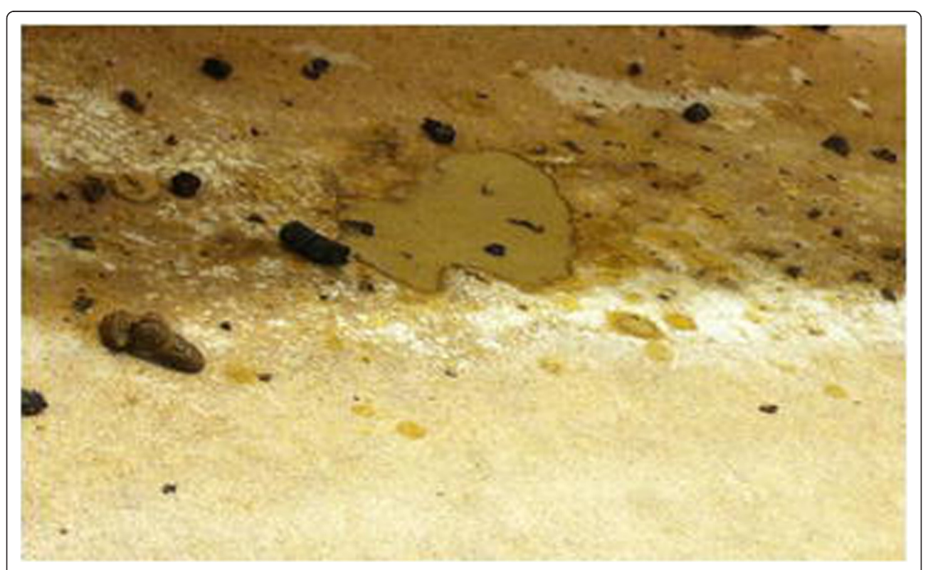
Figure 3 Diarrhea on floor below the positive control group pen. Following ingestion of feed spiked with stock PEDV, piglets in the Positive control group developed clinical signs of PED 2 days post-ingestion. This photo illustrates watery diarrhea observed below the pen floor housing these piglets.

The in vivo phase of the study was conducted from January 17–24 and results are summarized in Table 2. Prior to initiation of the in vivo phase of the study, all