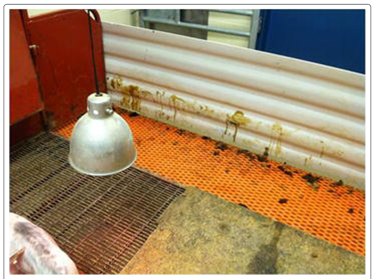
Figure 2 Diarrhea in the treatment group pen. This figure illustrates fecal staining on the wall of the pen housing the Treatment group piglets. This image was taken on day 6 post-ingestion of PEDV-positive feed.

For select samples, it was planned to conduct nucleic acid sequencing of the PEDV S1 gene. Specifically, fragments of the S1 domain of the spike gene were amplified from extracted RNA. Primers 1: (5'- ATGARGTCTTT AAYYTACTTCTGG-3'), 2: (5'-CATCCTCACCWGCA CTAGTAAC-3'), 3: (5'- GTTGTGCTATGCAATATGT TTAY-3'), 4: (5'-TGAAATTAATTGTGACAGCATC-3'), 5: (5' -TTGTCATCACCAAGTAYGGTG -3'), 6: (5' - CT AAAAGACAGGTAATCATTAACAG- 3'), 7: (5'- CTG TGTTGACACTAGACAATTTAC- 3'), 8: (5'- CATACT AAAGTTGGTGGGAATAC- 3') were designed to anneal to conserved genomic regions. Incorporation of degenerate bases maximizes the ability of the PCR to amplify genetically divergent PEDV variants between the US and UK strains. Primer pair 1 and 2 obtained a PCR product size of 670 bp, primer pair 3 and 4 obtained a PCR product size of 678 bp, primer pair 5 and 6 obtained a PCR