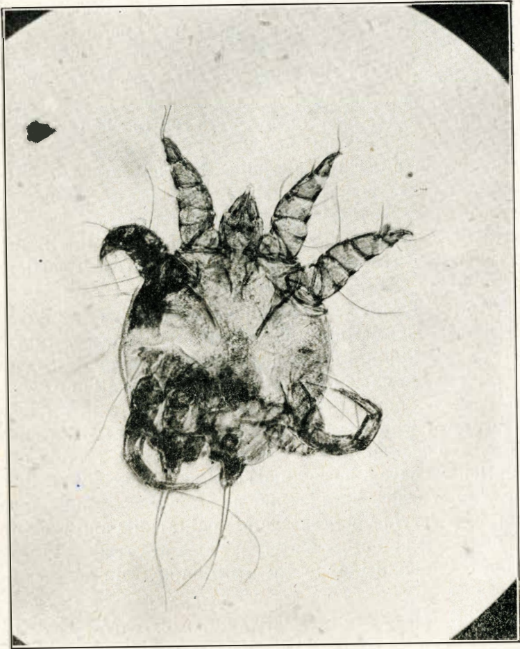
FIG. 1.— Psoroptes bovis , the parasite producing cattle mange